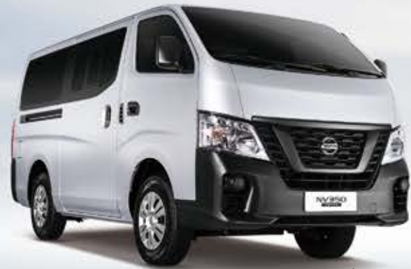
The New NV350 Urvan