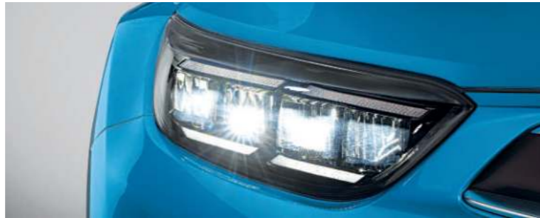
LED Head Lamps - Stylish LED headlights with DRLs offer enhanced illumination, enabling you to better view the road ahead.