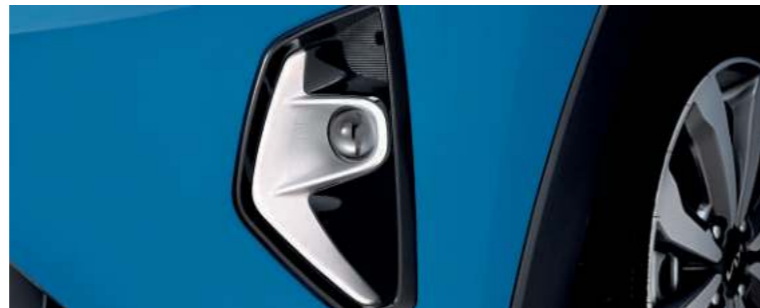
Fog Lamps - The front fog lamps allow for increased visibility in low visibility environments.