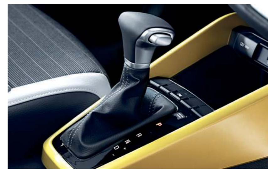
6 Speed Automatic Transmission Stay firmly in control, thanks to the 6-Speed automatic transmission that seamlessly transitions the power, making it an effortless drive.

Engine Specification Dynamic and reliable 1.4L MPI petrol engine provides frugality and agility for an excellent all-round performance.