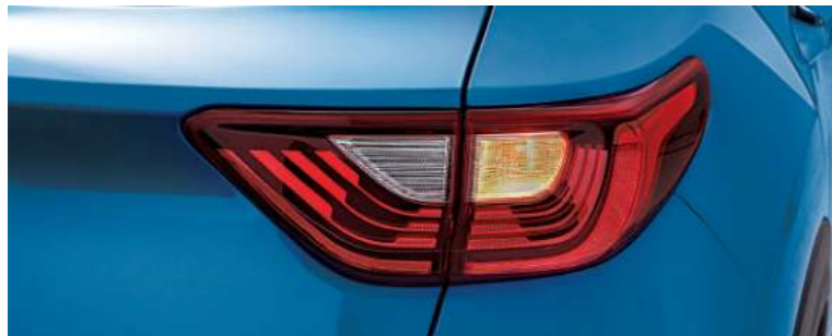
Rear Lamps - LED rear combination lamps illuminate instantly and give the rear a modern, high-tech appearance.