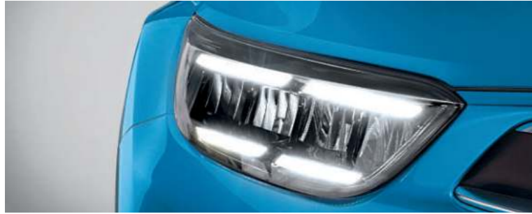
LED Daytime Running Lamps - Make your presence known during the day with the DRL of New stonic with its cutting edge design that is sure to make your head turn.

A striking design with stunning modern horizontal LED DRLs, iconic shape, and vibrant color options. Featuring a capability that exudes exhilaration and puts your positive vibes on full display, drive through a rainy night with absolute visibility and accuracy.