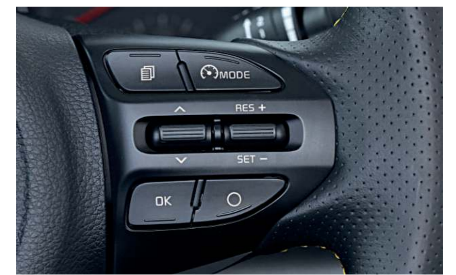
Cruise Control with Manual Speed Limit Assist Set and maintain a constant speed and simply step on the brake or accelerator when you want to disengage.