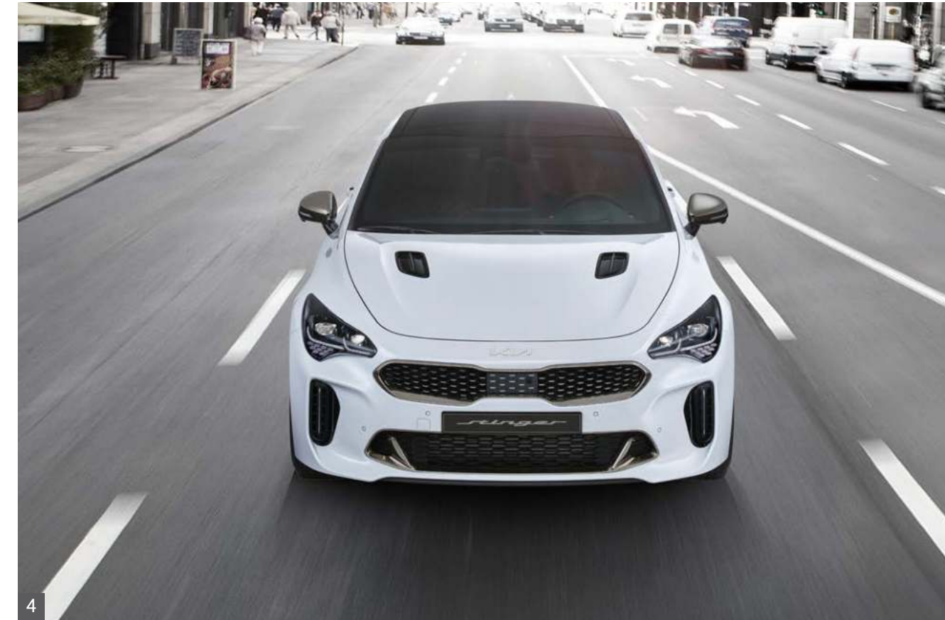
4 Lane Following Assist Tracks lanes using the front–view camera and helps maintain the vehicle in the center of the lane.