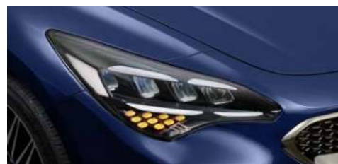
LED headlamp & DRL

* Brembo brakes depicted with the 19" full finish wheel and 19" design wheel are only available with the Performance Package.