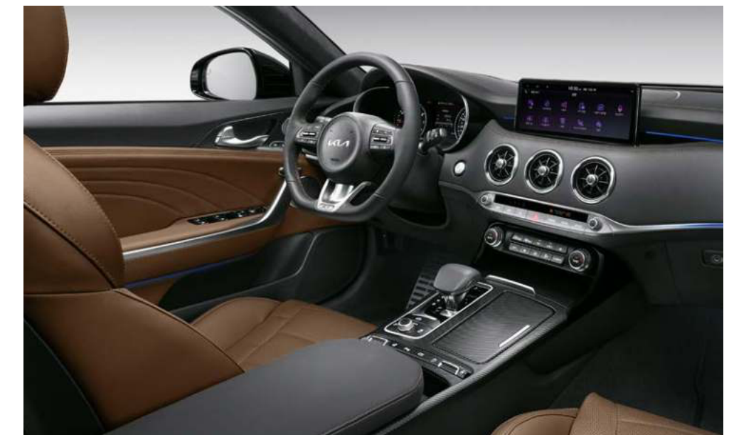
Terracotta Brown interior (Nappa leather/for Tribute Edition only)

* The Tribute Edition is only available in this interior color.