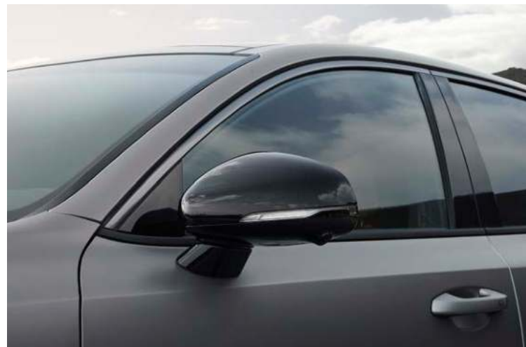
Black outside mirror cover