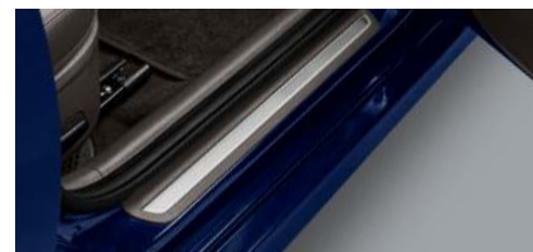
Metal door scuff