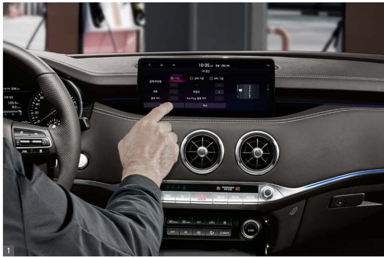
1 Kia Pay Kia Pay is a hassle-free payment system that can be used to make payments, such as gas and parking fees, to affiliated merchants with a card registered in the Kia Pay app and a few taps of the navigation screen. * The list of merchants is continuously expanding. For an updated list, please consult the navigation system or the Kia Pay app.