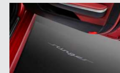
Door spot lamp