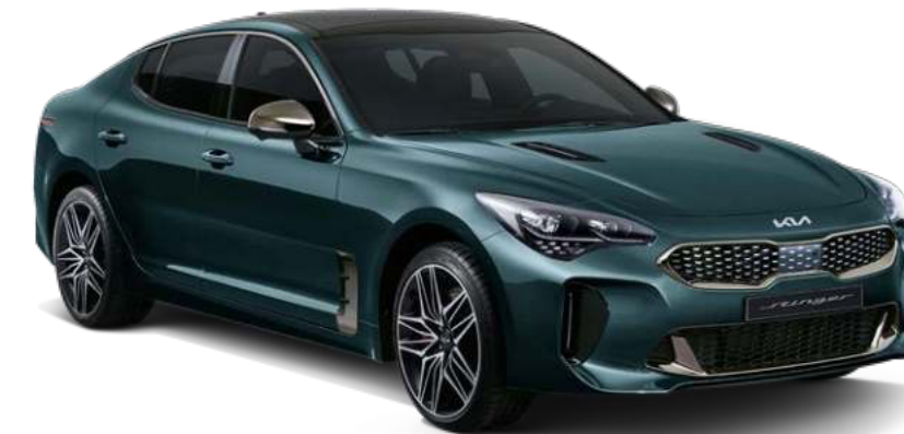
2.5 gasoline turbo