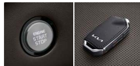
Engine start/stop button smart key system