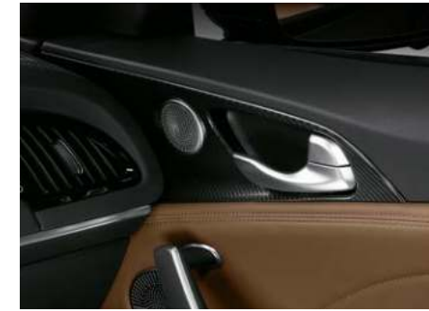
Door garnish (Carbon insert film)