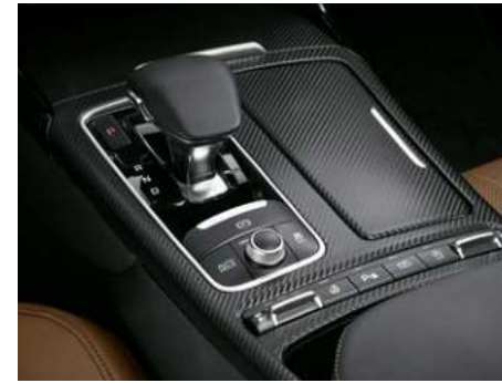
Console upper cover (Carbon insert film)