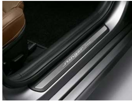
Door scuff (Tribute Edition exclusive)