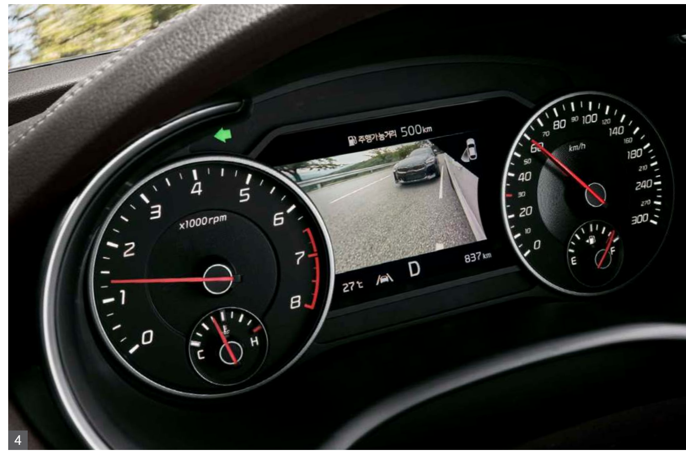
4 Blind-spot View Monitor (BVM) Cameras on the bottom of outside mirrors display a posterolateral view of the vehicle on the cluster's screen when the turn signal is activated, providing greater visibility of the surroundings in comparison to conventional outside mirrors for a safer driving environment.