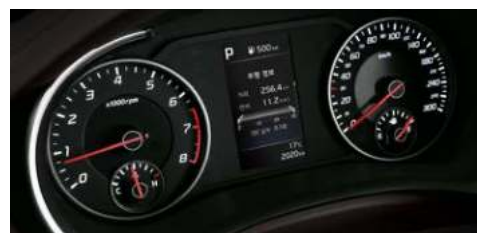
Supervision cluster (4.2" color TFT LCD)