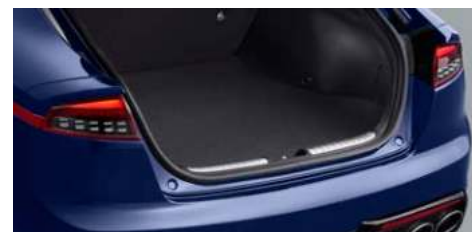
Metal transverse trim