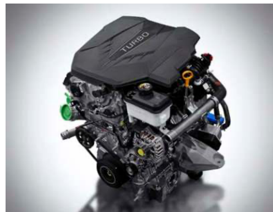
Smartstream G2.5 T-GDI engine

Powerful and bold 300+ horsepower driving performance of a Smartstream G2.5 T-GDI and 3.3 T-GDI gasoline engine.