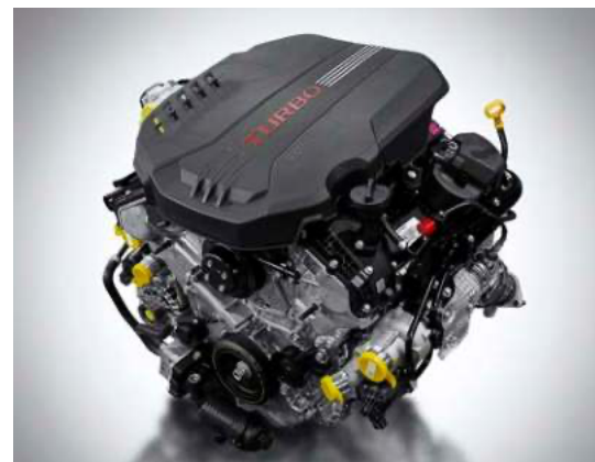
3.3 T-GDI gasoline engine