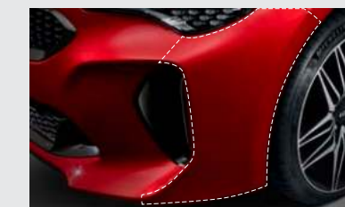
Vehicle protection film* Applied to the front and rear bumpers' sides, door edges, door caps, door steps, and fuel door.