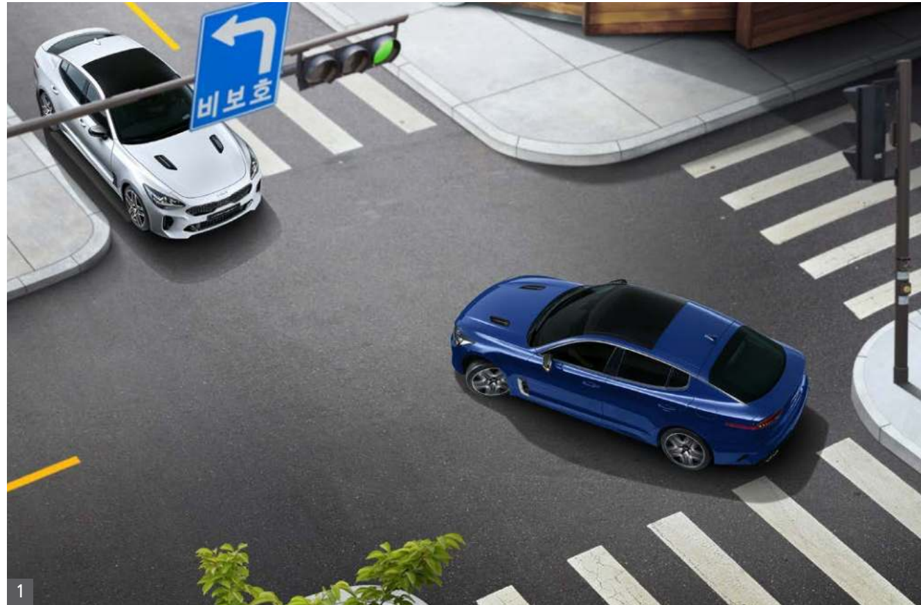
1 Forward Collision–avoidance Assist (oncoming traffic in intersections) Alerts the driver when danger of colliding with a car, pedestrian, or cyclist in front is detected. Automatically helps to apply the brakes if the risk of a collision increases even after sounding an alarm or when a risk of colliding with an oncoming vehicle on an opposite lane is detected while making a left turn in an intersection.