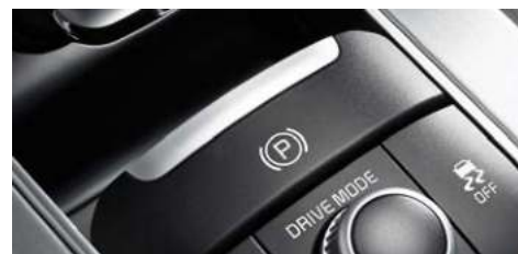
Electric Parking Brake