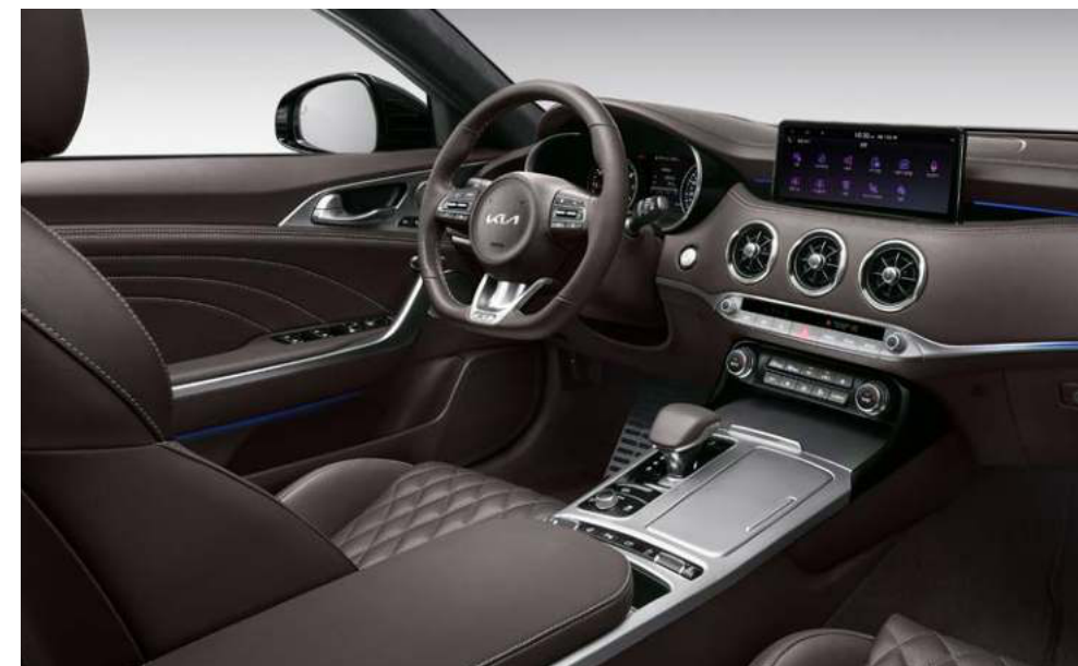
Brown interior (Quilted Nappa leather)