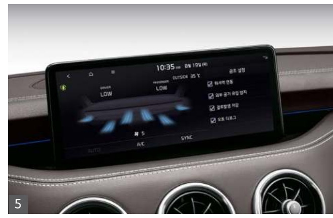
5 Air purification system (including micro-dust sensor) Monitors and displays indoor air quality in real time in 4 levels (good, normal, bad, very bad) on the air conditioning display window. Automatically activates the high-performance combi-filter to purify the air if air quality is bad or very bad.