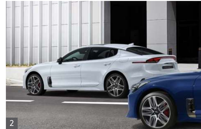
2 Safe Exit Warning Alerts disembarking passengers if a vehicle is approaching from the rear in an adjacent lane.