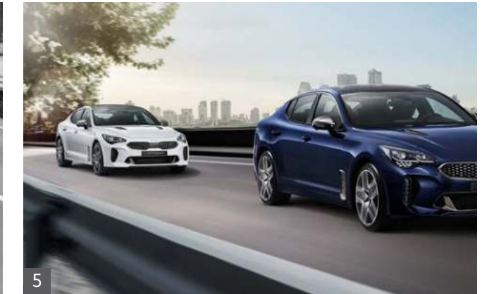
5 Highway Driving Assist (HDA) Helps to maintain a safe distance from the car in front while driving on an expressway or highway and to keep the center of the lane even while driving at a preset speed through a curved section of the road.