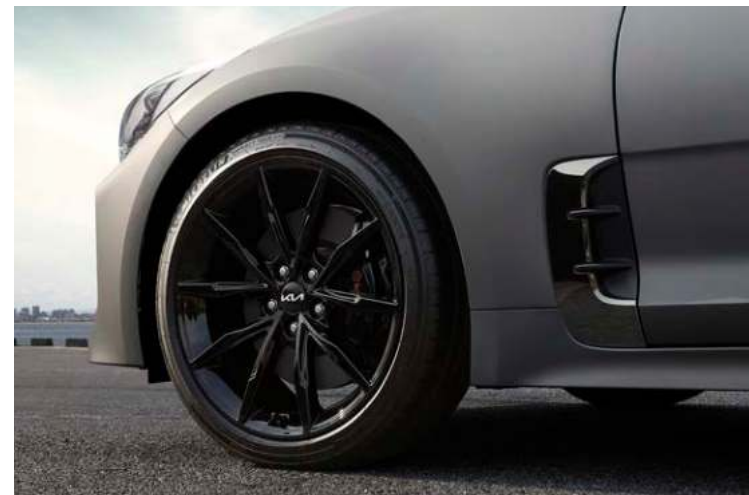
19" glossy black design wheels and black Brembo brake calipers