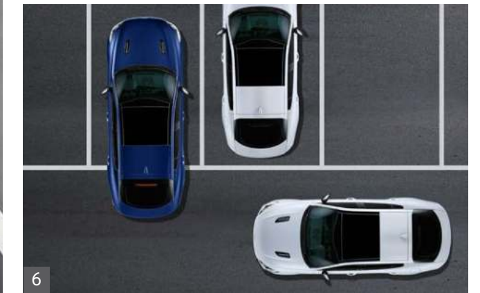
6 Rear Cross–traffic Collision–avoidance Assist (RCCA) Alerts the driver if a car is approaching from the left or right while pulling out in reverse. Applies the brakes automatically if the risk of collision increases even after sounding an alarm.