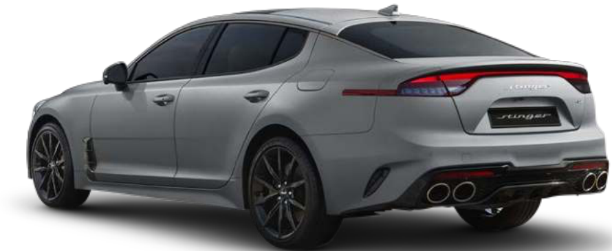
3,3 gasoline turbo (Applicable to the Tribute Edition)