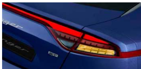
LED rear combination lamp & bulb turn signal lamp