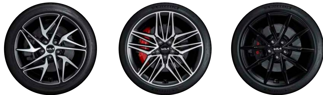
18" full finish wheel