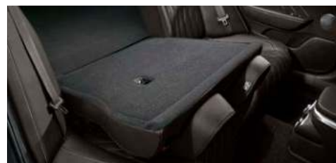
6:4 split-folding rear seat