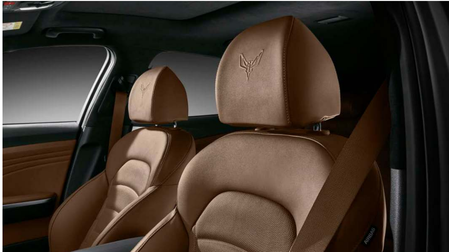
Terracotta Brown Nappa leather seats (headrests with the Tribute Edition's exclusive logo)

The Tribute Edition maximizes differentiated value with the application of terracotta brown color throughout the interior (Nappa leather upholstery, seat belts, and stitching) and the new exclusive design is applied on the door scuffs and headrests.