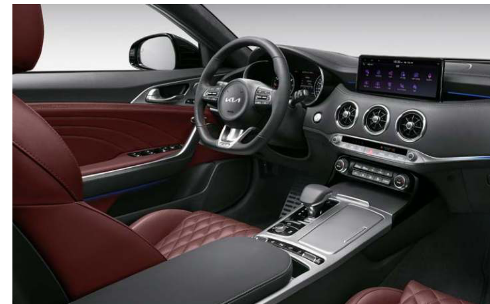
Dark red interior (Quilted Nappa leather)