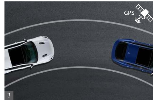
3 Navigation–based Smart Cruise Control* (Safety zones and curved sections of expressways and highways) Reduces speed before entering safety zones and curved segments while driving on expressways and highways. Resumes acceleration to preset levels thereafter.