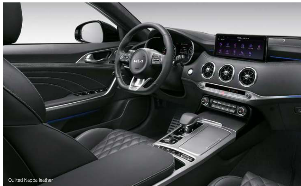
Quilted Nappa leather Black interior (Quilted Nappa leather/Leather)