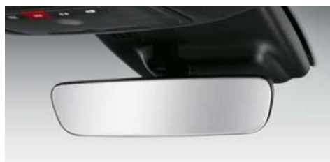
Frameless rear-view mirror