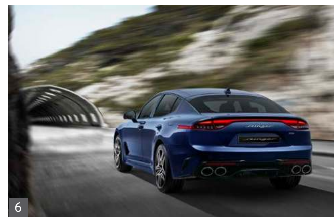
6 Outside air intake control Linked with the navigation system, windows are automatically closed and air circulation is automatically switched to the recirculation mode before entering a tunnel or passing through an area where the air is thought to be polluted in order to maintain a pleasant cabin air quality. * Tunnel-linked controls activate when driving on an expressway or highway. They do not operate in tunnels less than 50 m long.