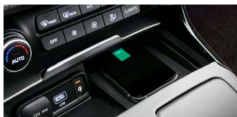
Wireless smartphone charging system