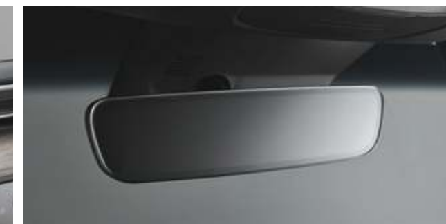
Frameless inside mirror