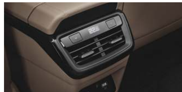
3-zone climate control system (rear seat climate control system)