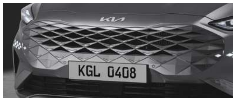
Bumper-integrated radiator grille