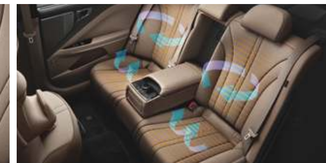
Seat ventilation/warming system (all seats)