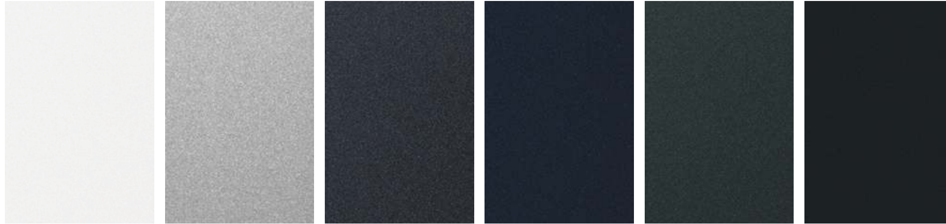
Snow White Pearl (SWP)