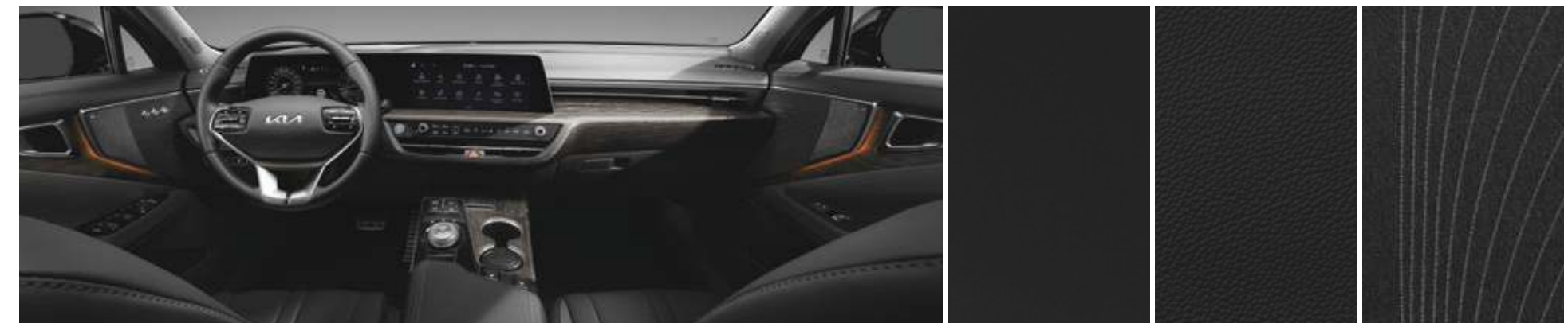
Saturn Black One-tone