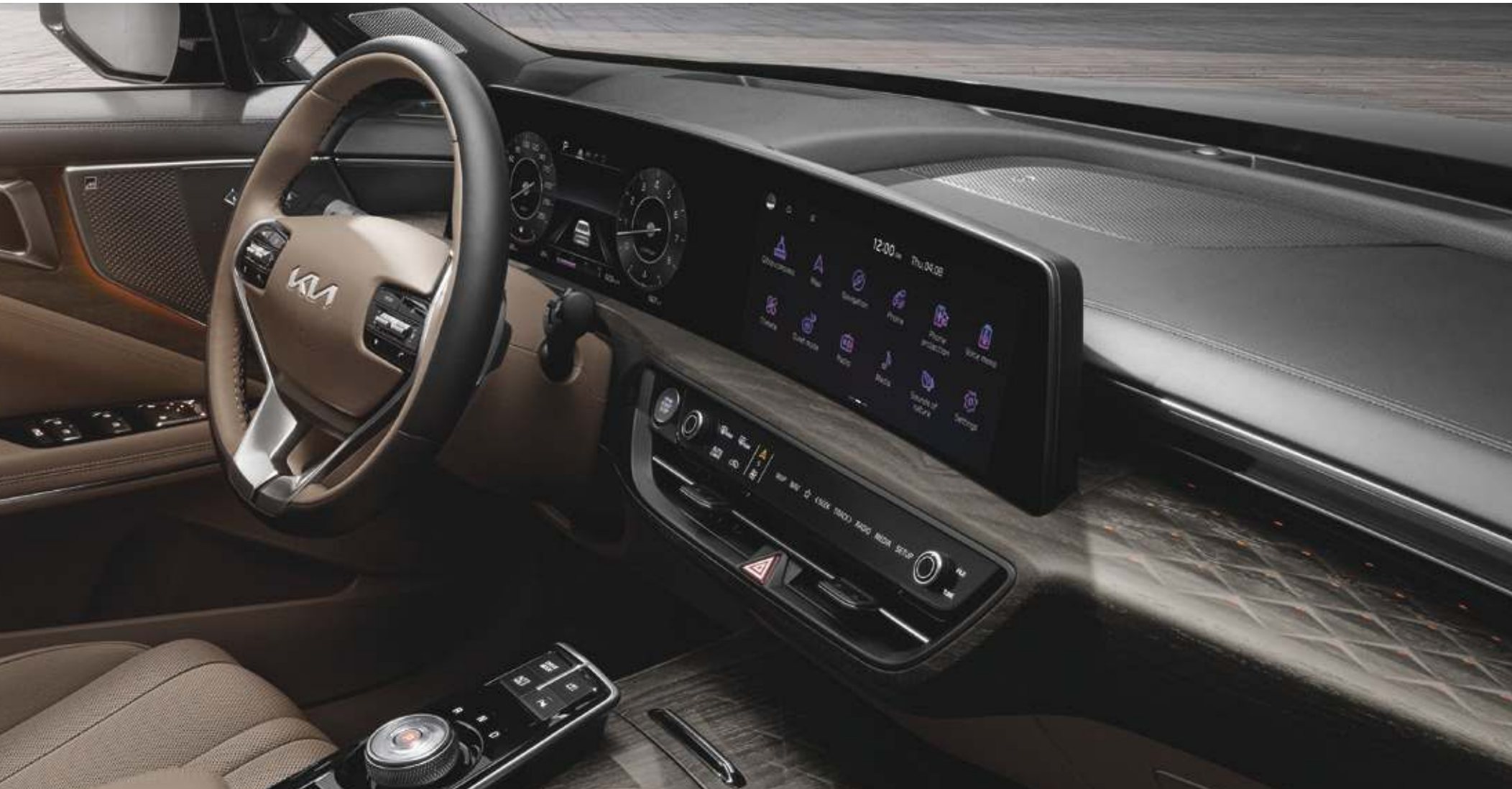
Panoramic curved display