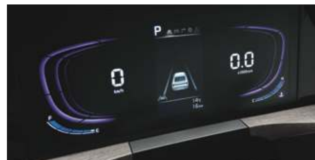
Supervision cluster (4.2-inch color TFT LCD)