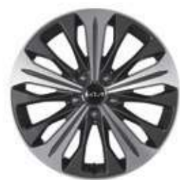
18-inch alloy wheels

Details should serve a purpose. Everything in the Kia K8 adds something to the mix. From the artful front grille to the soft suede and classic gauge faces on the inside. Some project a bold or playful image. Some just feel right. Some accomplish tasks in new and better ways. When they all come together, the Kia K8 really shines.