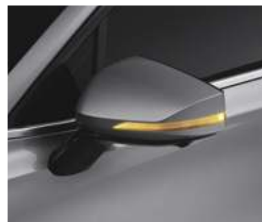
LED repeater integrated outside mirrors