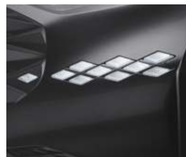
LED DRLs / LED turn signals