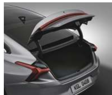
Electric safety power trunk