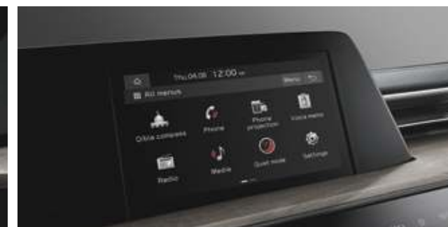
8-inch display audio