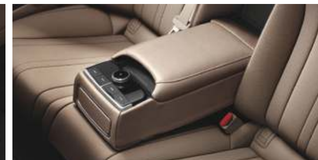
Rear seat armrest