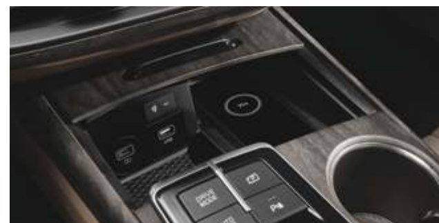
Wireless charging tray