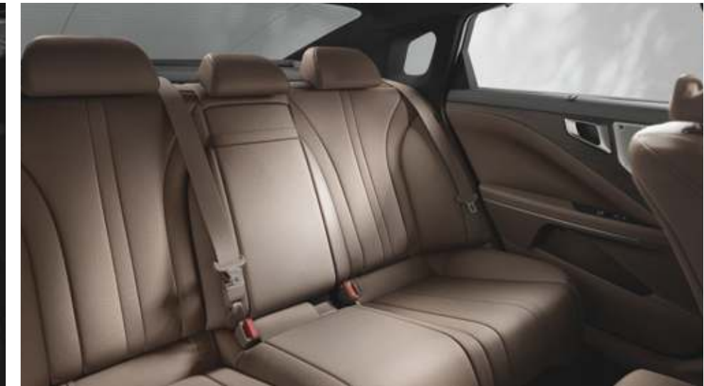
Premium leather seats Ergo Motion Seat