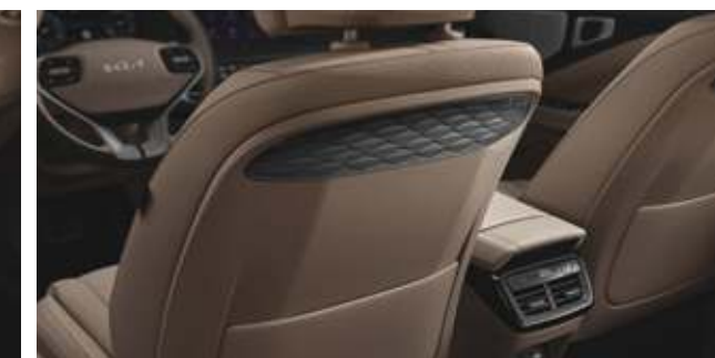
Seatback pocket (board type)