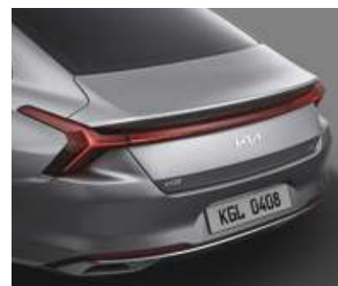
LED rear combination lamps