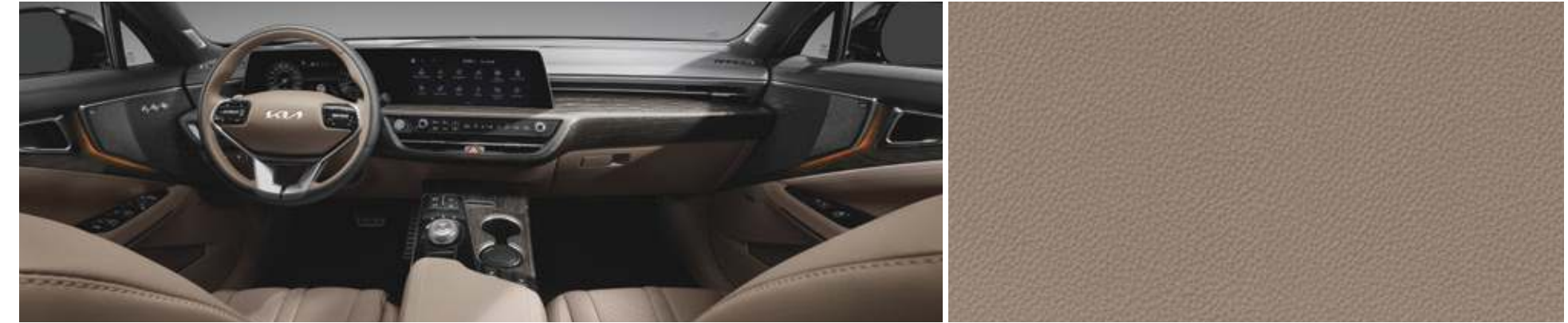
Toffee Brown Two-tone