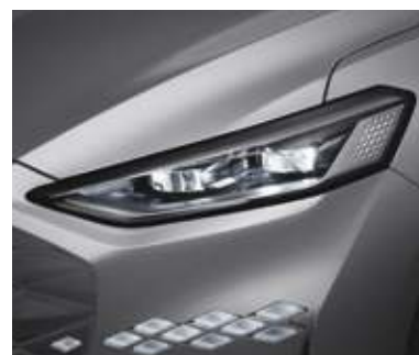
Projection LED headlamps