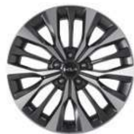
19-inch alloy wheels