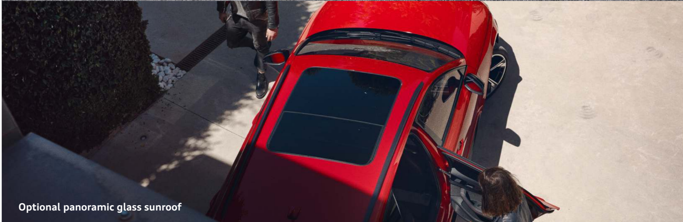
Optional panoramic glass sunroof