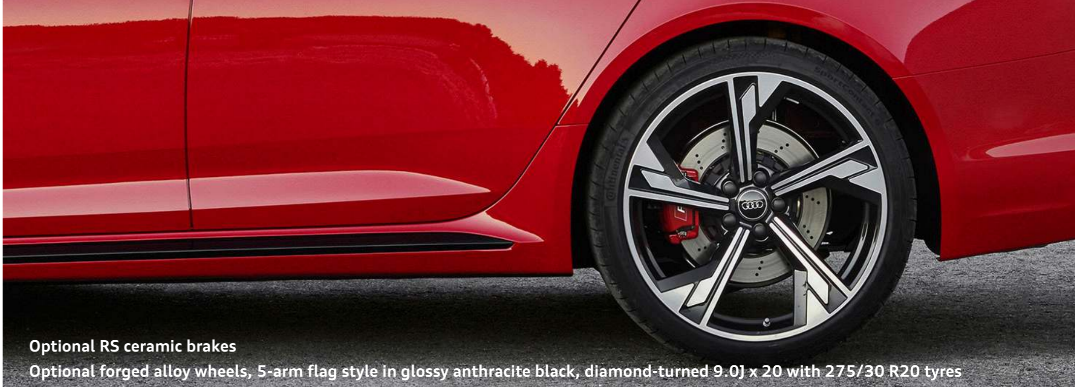
Optional RS ceramic brakes