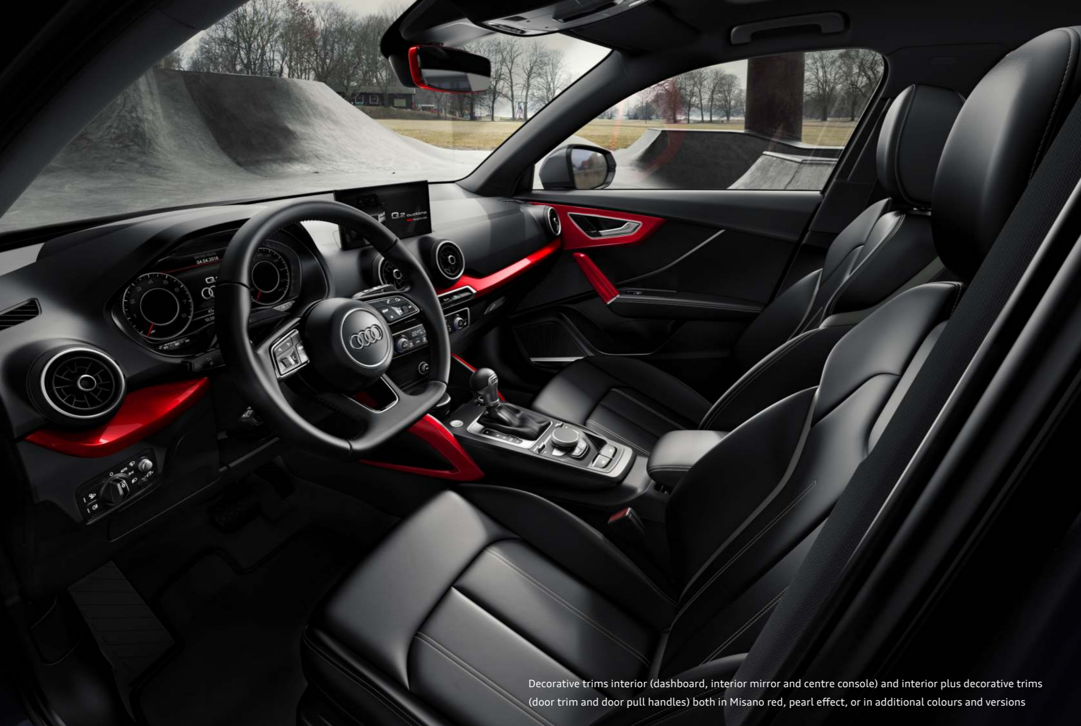
Decorative trims interior (dashboard, interior mirror and centre console) and interior plus decorative trims (door trim and door pull handles) both in Misano red, pearl effect, or in additional colours and versions