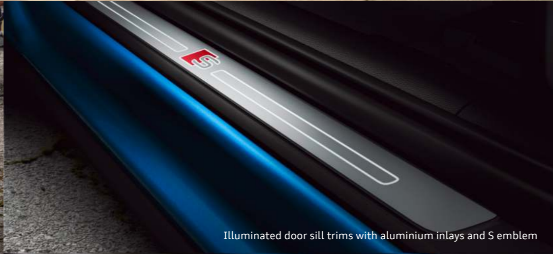
Illuminated door sill trims with aluminium inlays and S emblem