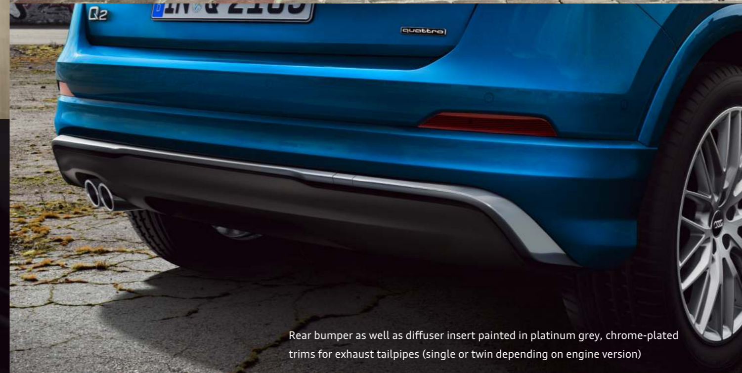
Rear bumper as well as diffuser insert painted in platinum grey, chrome-plated trims for exhaust tailpipes (single or twin depending on engine version)