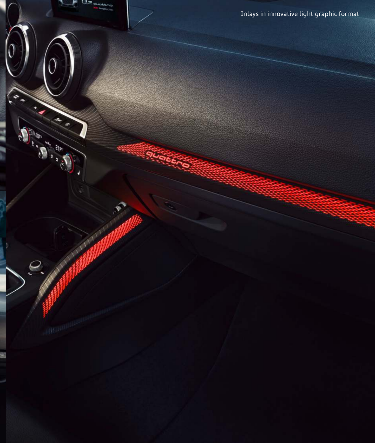
Inlays in innovative light graphic format