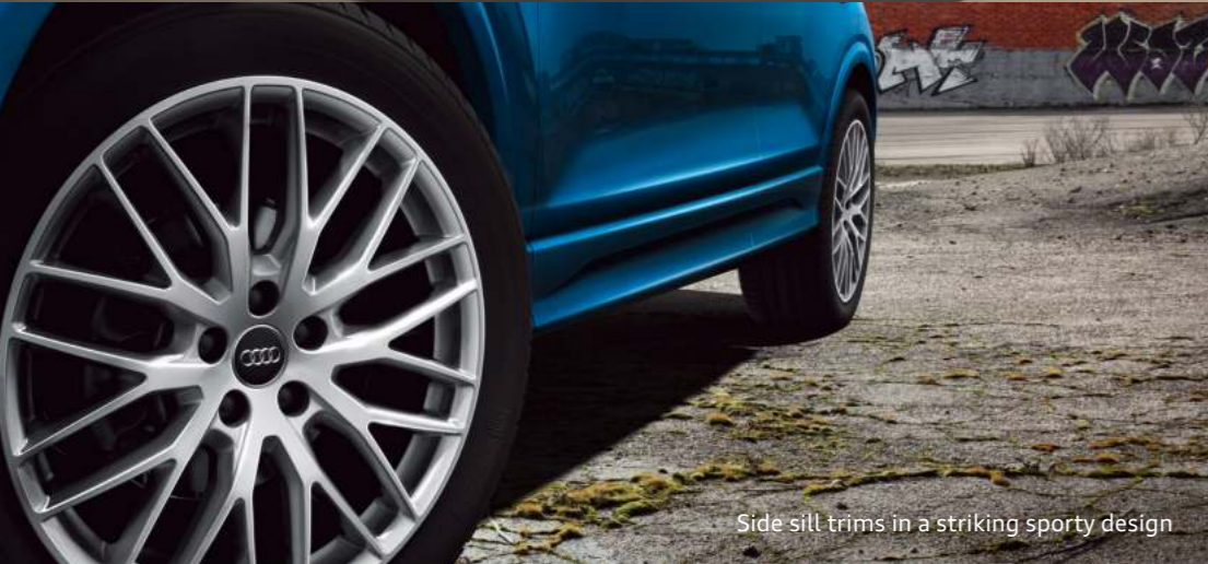
Side sill trims in a striking sporty design

Don't just emphasise the sport character of the Audi Q2 – enhance it. The optional S line exterior package further accentuates the Audi Q2's dynamic body line and uses exciting details to create special highlights.