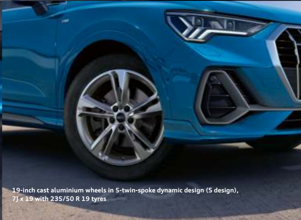
19-inch cast aluminium wheels in 5-twin-spoke dynamic design (S design), 7J x 19 with 235/50 R 19 tyres