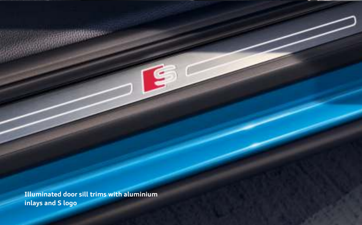
Illuminated door sill trims with aluminium inlays and S logo