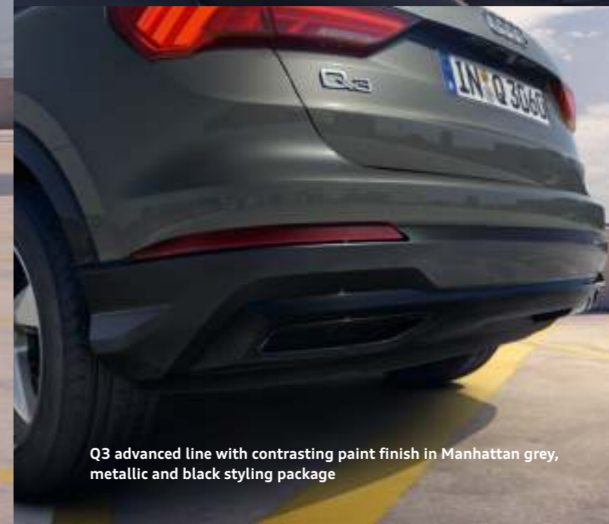
Q3 advanced line with contrasting paint finish in Manhattan grey, metallic and black styling package