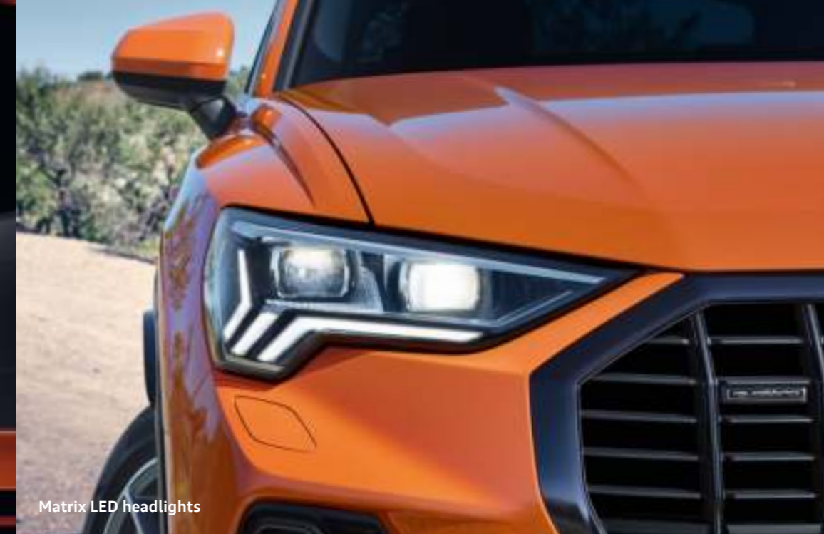
Matrix LED headlights