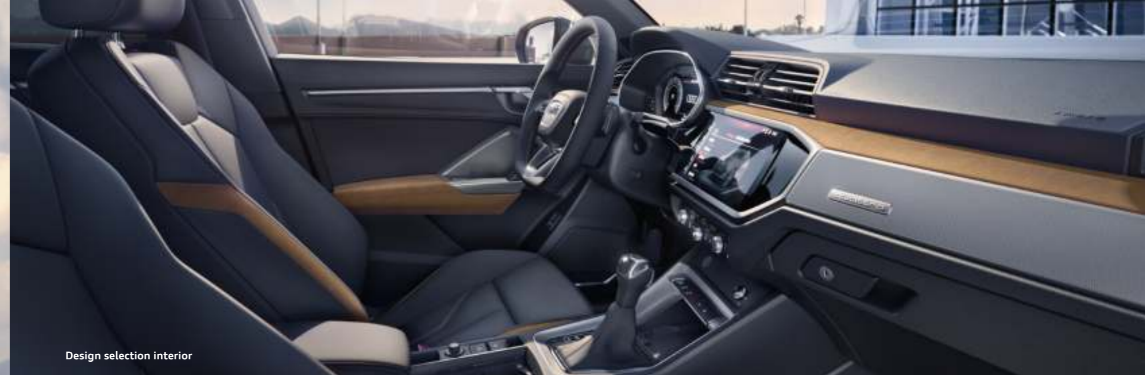
Design selection interior

“The Q3 advanced equipment line places the focus on exterior design: Contrasting paint finish in Manhattan grey, metallic and striking highlights make the Q3 eye-catching. Various interior packages add on to the finishing touches with sport seats, elements in Alcantara, elegant aluminium look and many other details. And the best thing: the various exterior lines can be easily combined with the interior packages.”