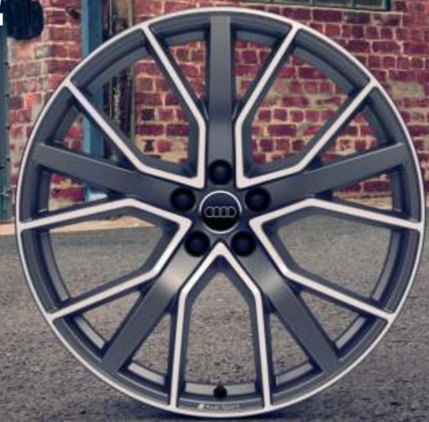
20-inch Audi Sport cast aluminium wheels in 5-V-spoke star design in matt titanium look, gloss turned finish