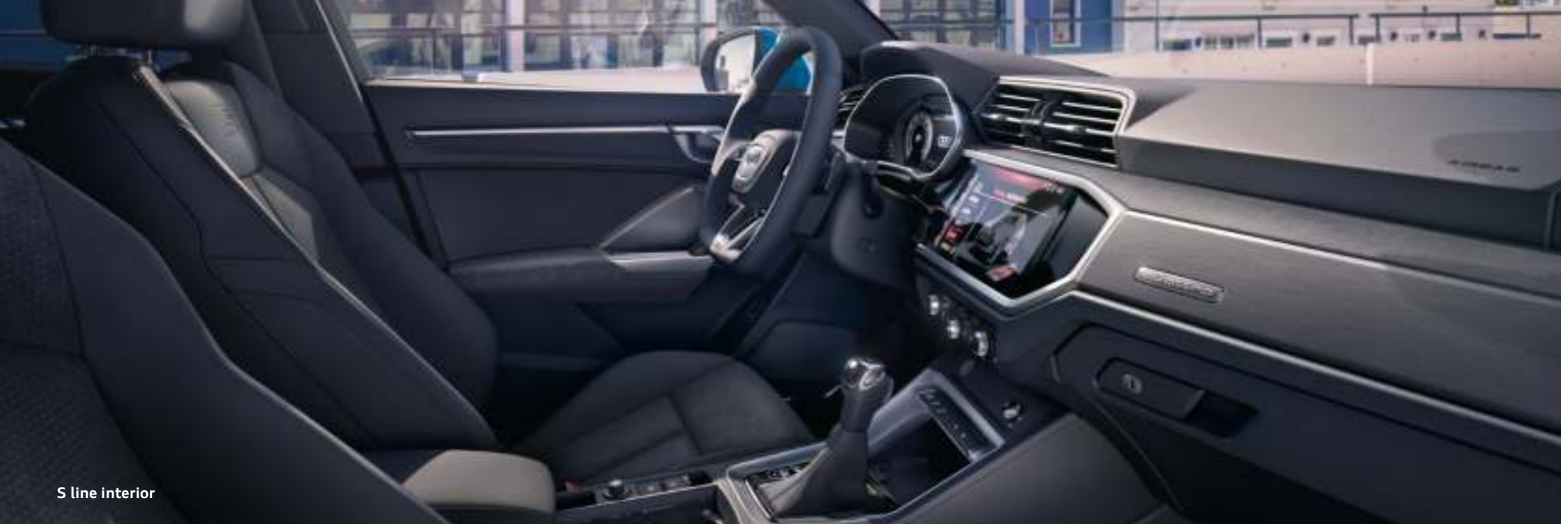
S line interior