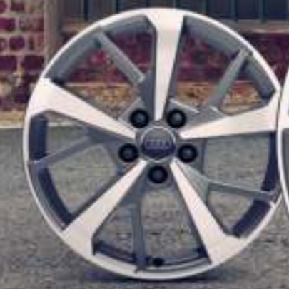
18-inch cast aluminium wheels in 5-Y-spoke design, partly polished