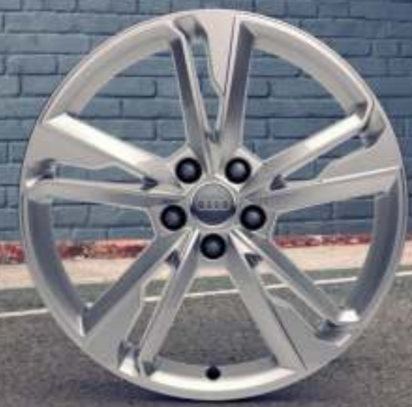
19-inch cast aluminium wheels in 5-twin-spoke dynamic design (S design)

“Its wheels emphasise the powerful, dynamic appearance of the Audi Q3. In an elegant or sporty design and in sizes from 17 to an impressive 20 inches. Regardless of which set of wheels you choose, you can be assured of the high quality, guaranteed by a special test procedure and rigorous inspection.”