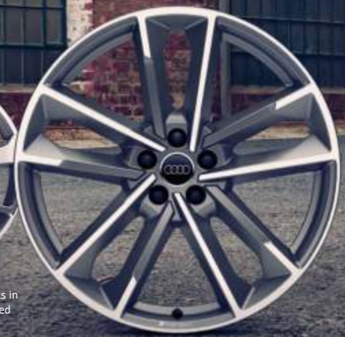
19-inch Audi Sport cast aluminium wheels in 5-twin-arm design in matt titanium look, gloss turned finish