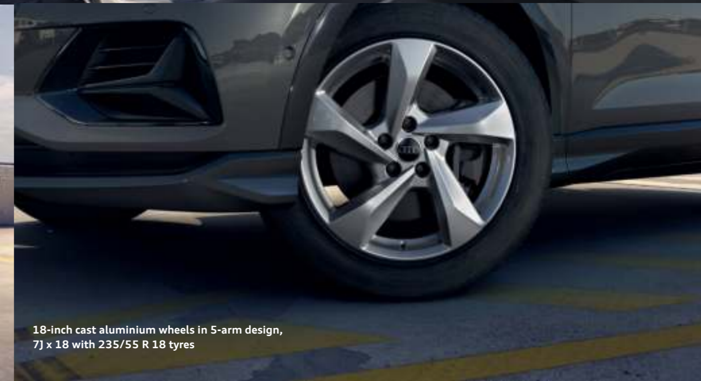
18-inch cast aluminium wheels in 5-arm design, 7J x 18 with 235/55 R 18 tyres