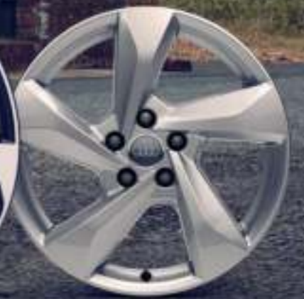
18-inch cast aluminium wheels in 5-arm design