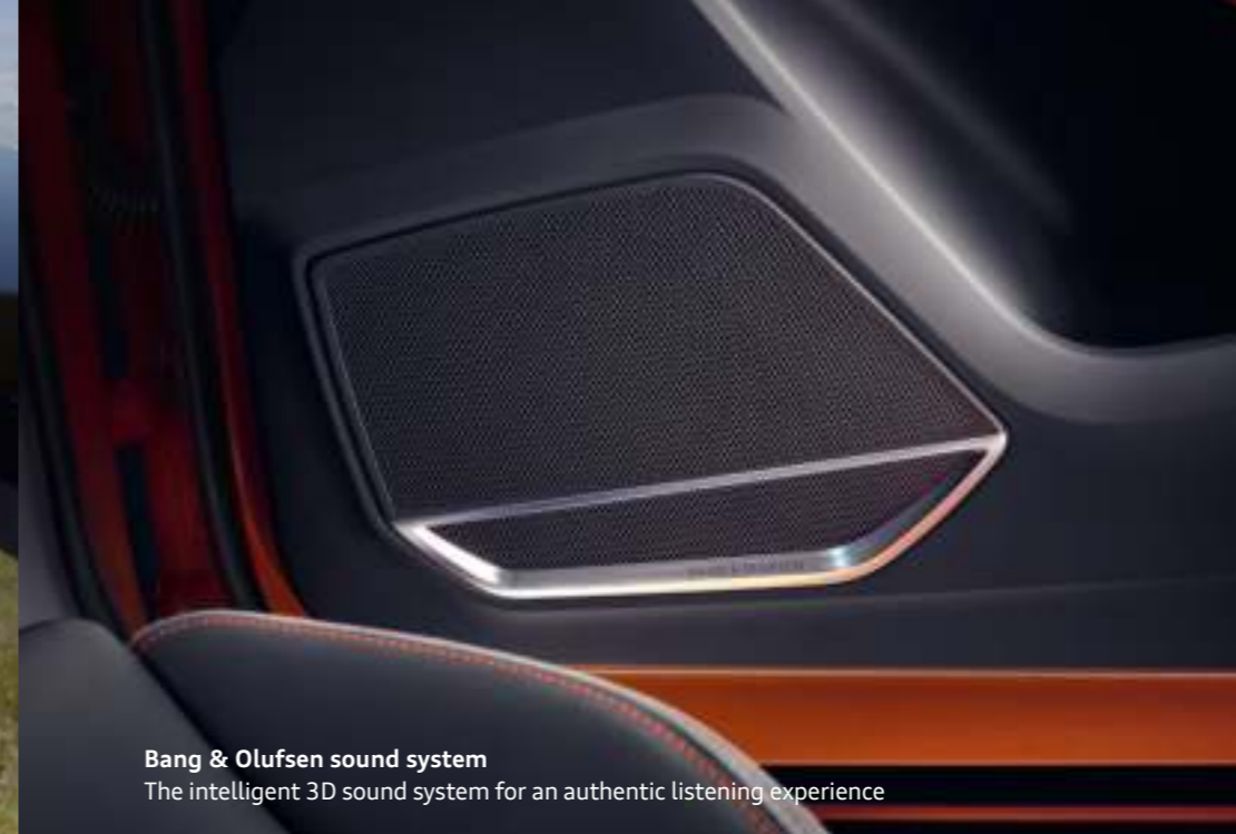
Bang & Olufsen sound system The intelligent 3D sound system for an authentic listening experience

“Easy-to-operate technology, design and comfort. Typical qualities that make the new Audi Q3 particularly suitable for everyday use. One example is the flexible rear seat bench plus that allows you to increase storage space whenever you need it.”