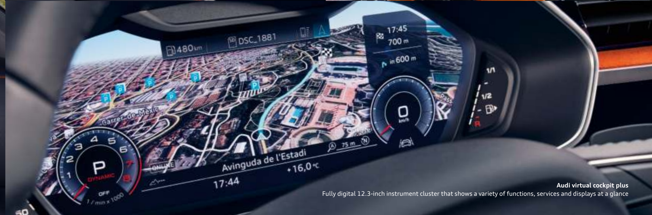
Audi virtual cockpit plus Fully digital 12.3-inch instrument cluster that shows a variety of functions, services and displays at a glance