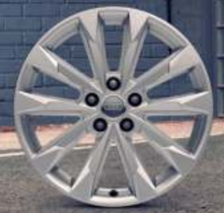
18-inch cast aluminium wheels in 5-twin-arm design