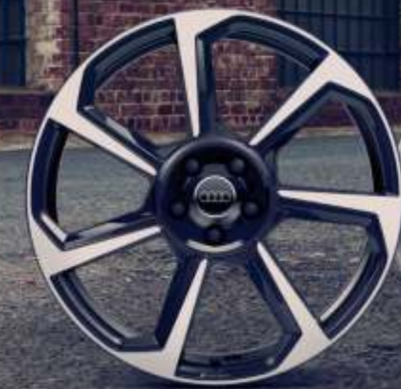
19-inch Audi Sport cast aluminium wheels in 7-spoke rotor design in gloss anthracite black, gloss turned finish