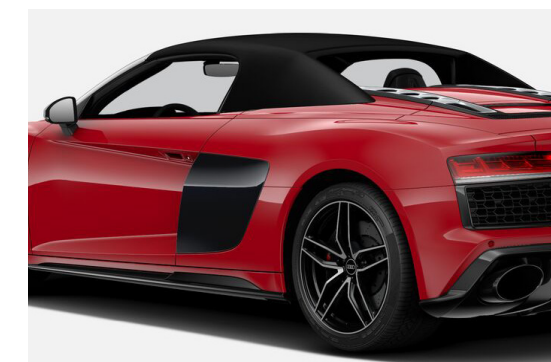
Alloy wheels, 5-V spoke Evo in titanium grey matte