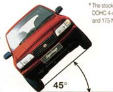
Max. safe angle of inclination