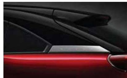
Soul Red Crystal Metallic with Black Side Panels and Roof (49V)