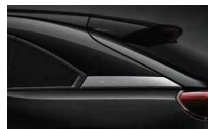
Jet Black Mica (41W)