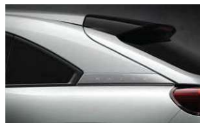
Ceramic Metallic (47A)