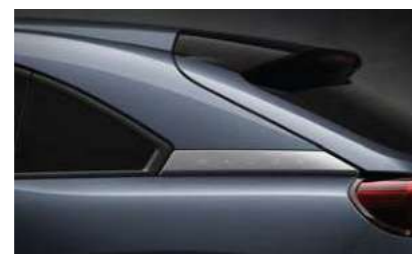
Polymetal Grey Metallic (47C)