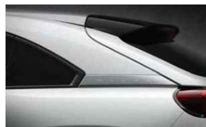
Arctic White (A4D)