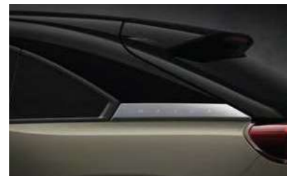
Zircon Sand Metallic with Black Side Panels and Roof (49T)