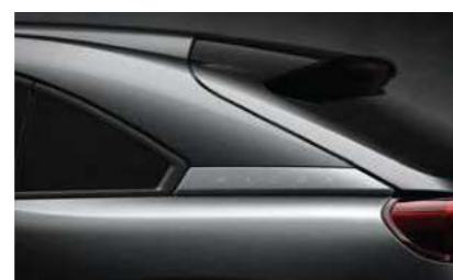
Machine Grey Metallic (46G)