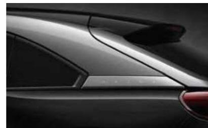
Jet Black Mica with Silver Side Panels (49P)