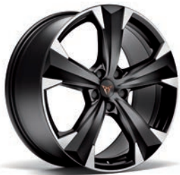
19" Exclusive Diamond Cut Alloy Wheels