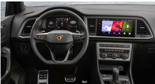
Satin Black with Dark Aluminium Glossy insert