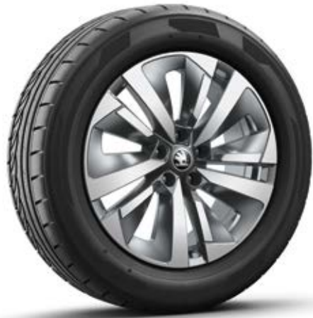
18" Soira Aero anthracite alloy wheels