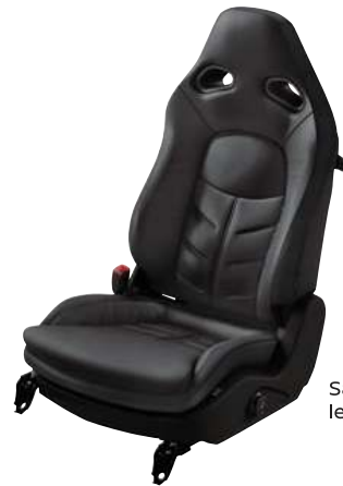
Samurai Black Semi-aniline leather accented