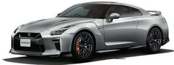
■ Super Silver (KAB)