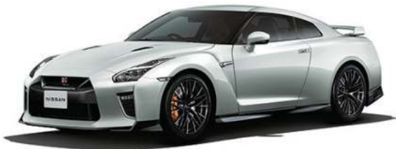
■ Storm White (QAB)