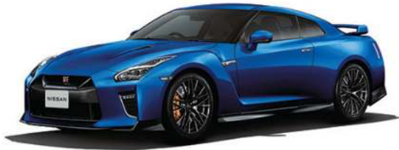
■ Bayside Blue (RCB)