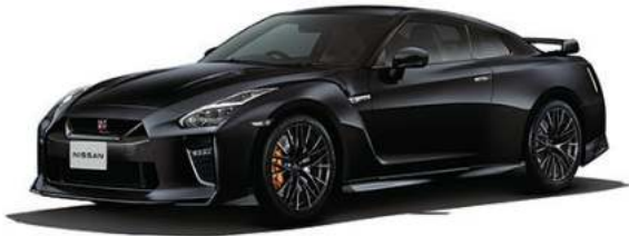
■ Pearl Black (GAG)