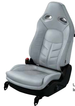
Urban Grey Semi-aniline leather accented