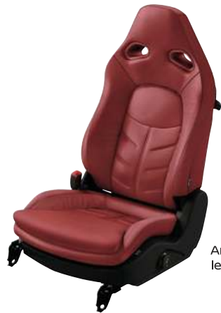
Amber Red Semi-aniline leather accented