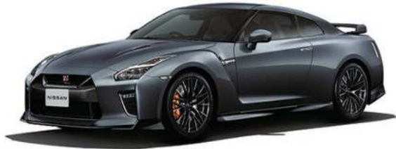
■ Gun Metallic (KAD)