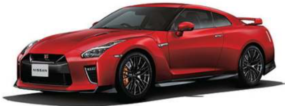
■ Vibrant Red (A54)