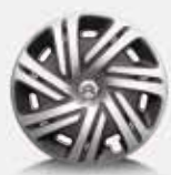
Standard on VT, VTR and XTR 5 models