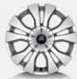
Standard on XTR 6 models