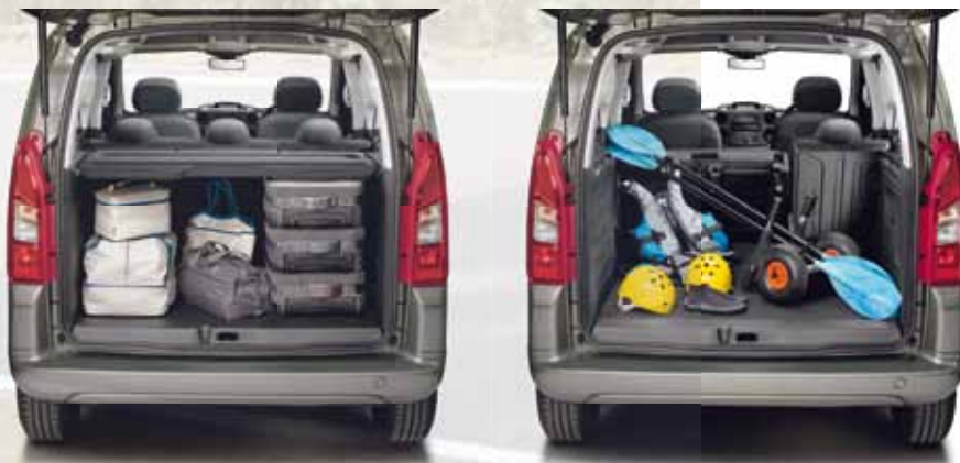
Please note: Trim shown is not available in the UK.

A MULTI-FUNCTION ON-BOARD TRIP COMPUTER AND AN MP3 COMPATIBLE CD PLAYER, STANDARD ON ALL MODELS ALONG WITH A SPEED LIMITER FUNCTION, STANDARD ON e-HDi AND OPTIONAL AS PART OF DETECTION PACK ON OTHER VTR AND XTR MODELS, ARE ALL DESIGNED TO MAKE LIFE MORE ENJOYABLE AND SAFER FOR EVERYONE ON BOARD.