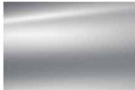
Cool Silver (M)