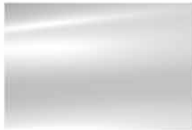
Pearl White (P)