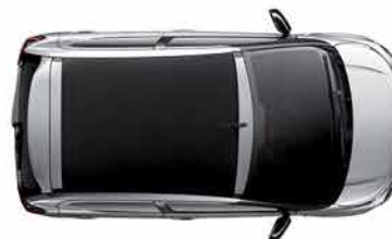
Black fabric roof

15 inch Black 'Planet' alloy wheels Automatic Pack – Automatic air conditioning, automatic headlights, electrically heated and adjustable door mirrors Reversing camera Sunrise Red fabric roof Metallic paint Flat paint