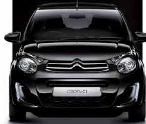
Caldera Black (M)