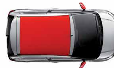
Sunrise Red fabric roof