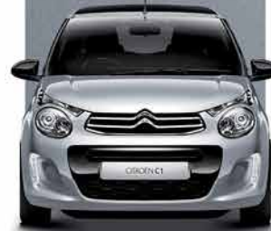
Gallium Grey (M)