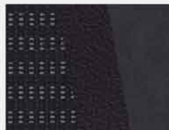
Optional on Exclusive models