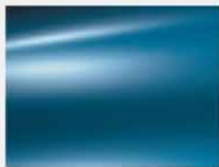
Belle Ile Blue (M)