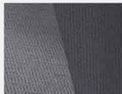
Standard on Exclusive models