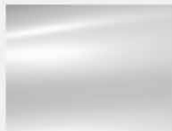
Pearl White (P)