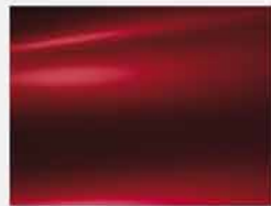
Ruby Red (M)