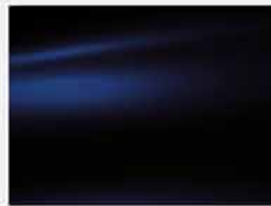
Ink Blue (M)