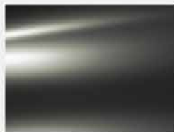
Shark Grey (M)