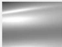
Arctic Steel (M)