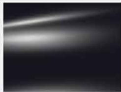
Perla Nera Black (M)