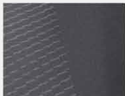
Standard on VT models