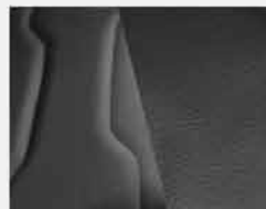
Optional on Exclusive models