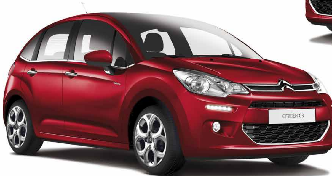
> CITROËN C3 EXCLUSIVE