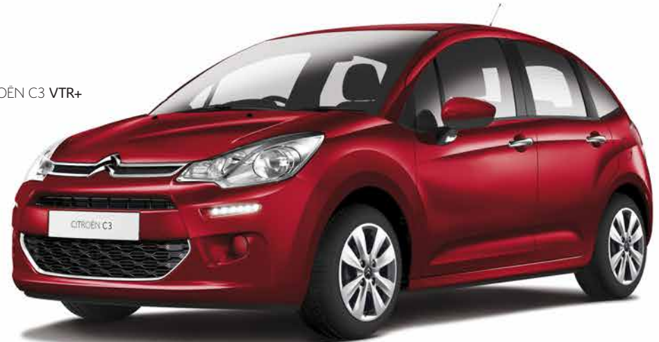
> CITROËN C3 VTR+