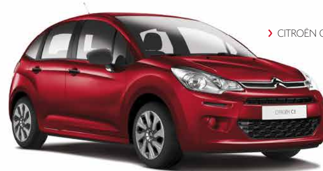
> CITROËN C3 VT

THERE ARE THREE UNIQUE VERSIONS, EACH WITH ITS OWN PERSONALITY, SPECIFICATION AND STYLE. THE DIFFERENCES ARE CLEAR AND STRAIGHTFORWARD SO CHOOSING SHOULD BE BEAUTIFULLY SIMPLE.