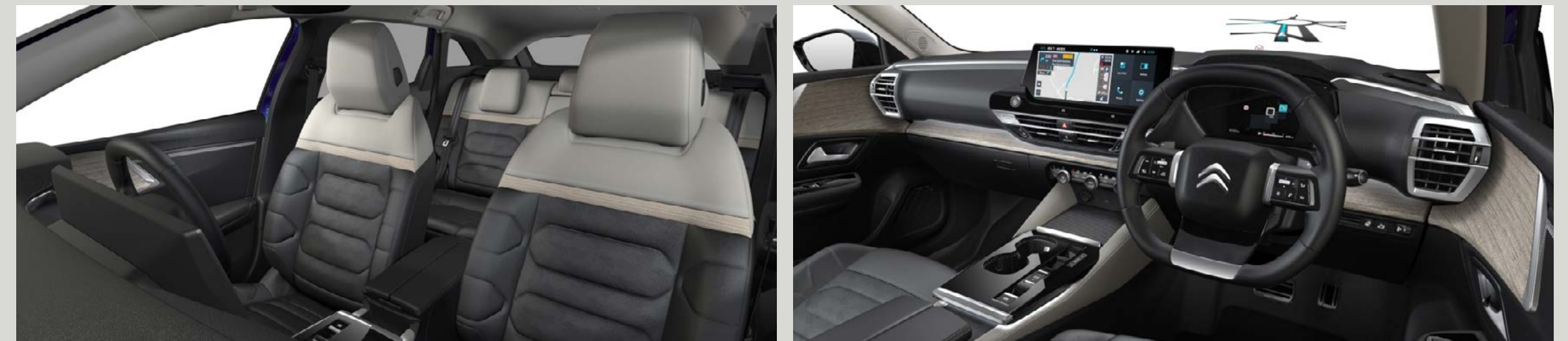
Hype Adamantium ambience Optional on MAX.