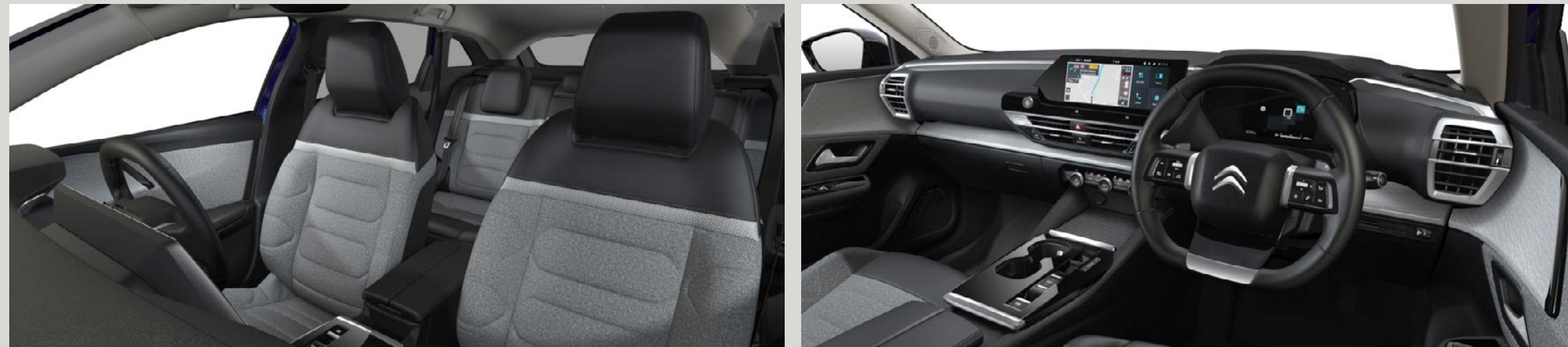
Urban Grey ambience Standard on YOU!