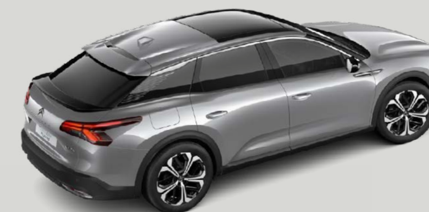
Opening panoramic roof with sunblind