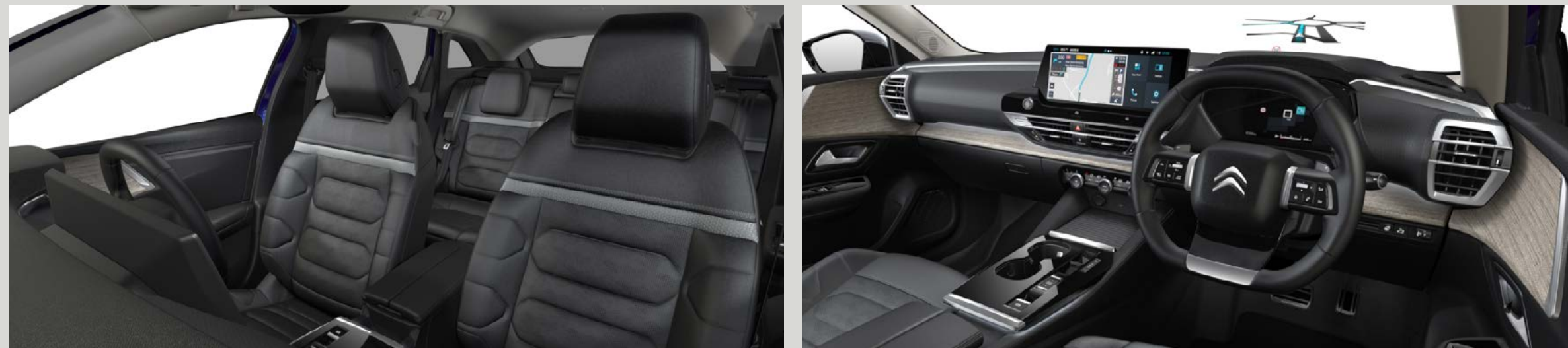
Hype Black ambience Standard on MAX, optional on PLUS.