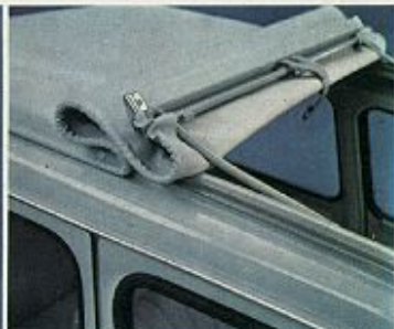
Her sunroof opens easily from inside.