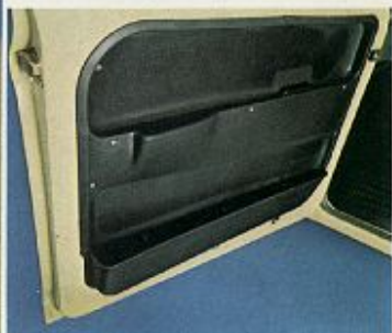
Enormous door pockets.