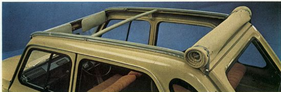
For picnics, her seats can be quickly removed.

Even if the road you have chosen is not the best, Dyane is never happier than when being put to the test. Her four wheel independent suspension, hydraulic shock absorbers, and inertia dampers, swallow up the impossible. If you happen to see another Dyane riding over pavé, watch her closely : it's quite spectacular. She's intelligently designed in other ways too, with adjustable headlamps and interior locking bonnet up front, and an enormous 2 position tailgate at the rear.