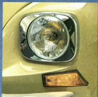
Headlamp beam level adjustable from inside the car.

Her generosity doesn't spoil her character. Just study her. She's clean, honest, well-behaved; her sweeping bonnet, her square framed headlamps, her sculptured doors, all give her a warm personality. Honestly, don't you think she has what it takes?