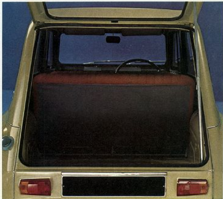
Her 47 cu.ft. boot capacity is easily accessible through her large tailgate.