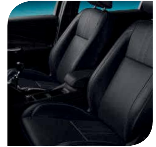
Napoli Full Leather In Charcoal Black, optional on Titanium X