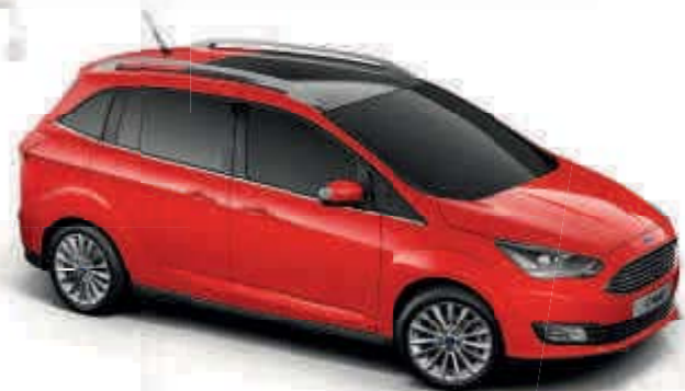
Race Red Standard