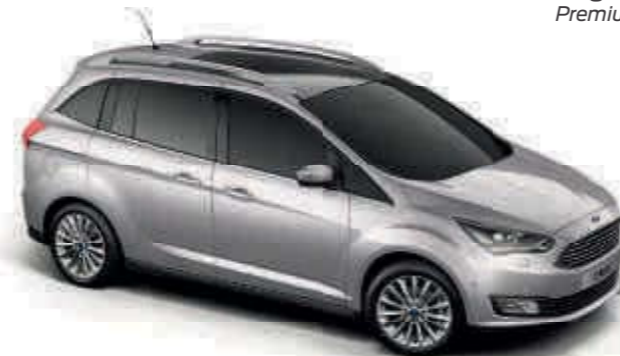
Moondust Silver Premium*