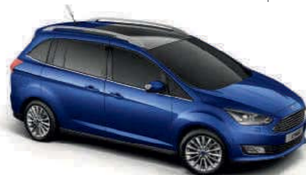
Deep Impact Blue Premium*