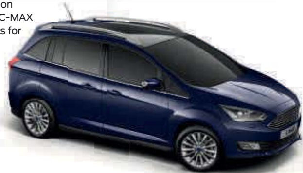
Blazer Blue Not available in the UK