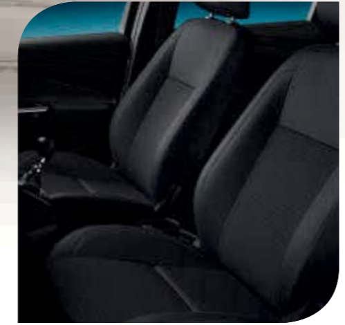
Tetra In Dark Charcoal Black for Zetec