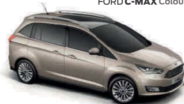
Tectonic Silver Exclusive*