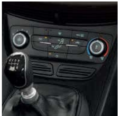
Manual air conditioning