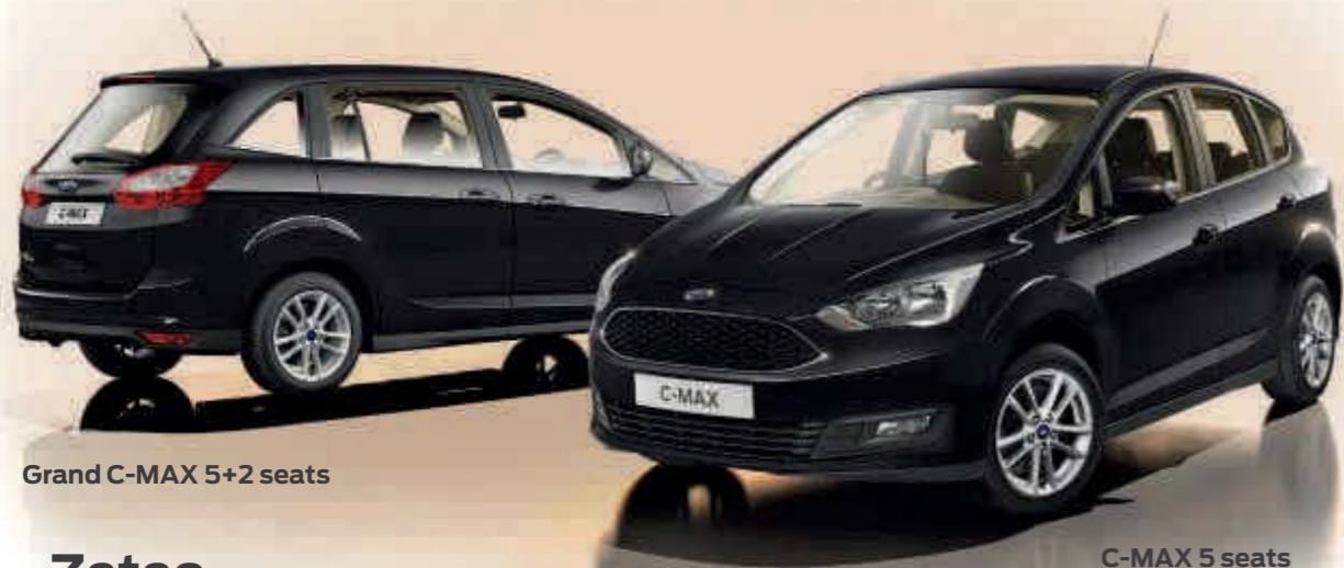
Grand C-MAX 5+2 seats