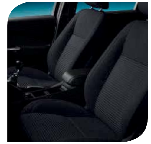
Groove In Charcoal Grey standard on Titanium