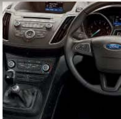
Leather-trimmed steering wheel and gearshift knob