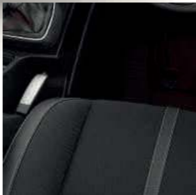
Partial leather seat trim