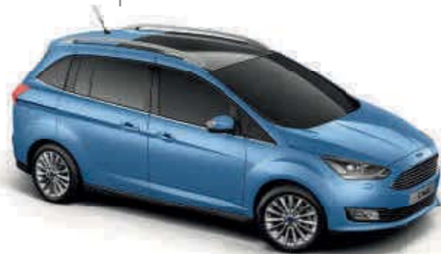
Iceberg Blue Exclusive*