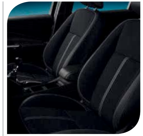
Torino Partial Leather Torino partial leather in Charcoal Black, standard on Titanium X