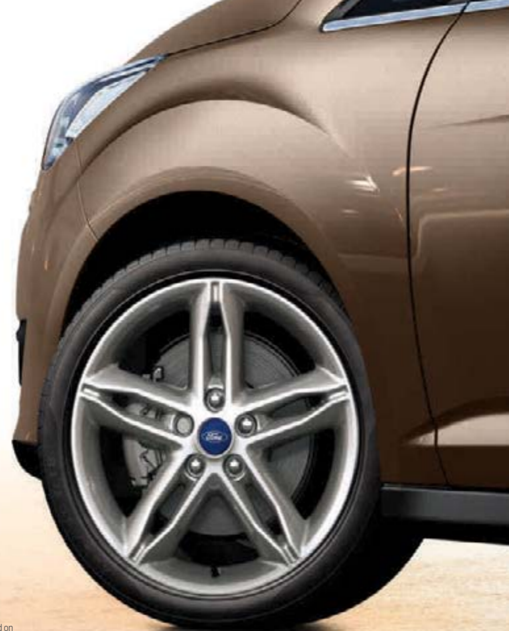
Wheel shown is standard on Titanium X