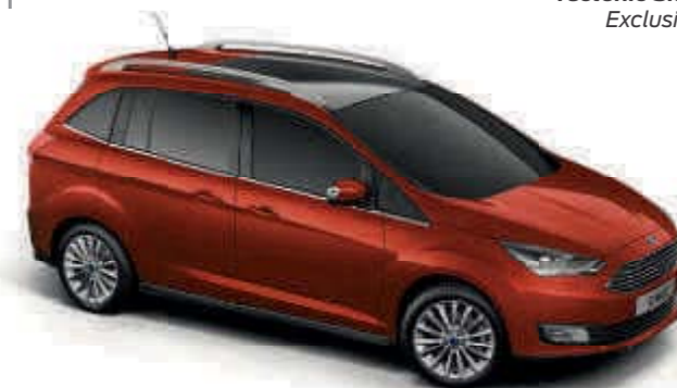
Red Rush Exclusive*