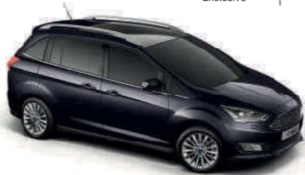
Shadow Black Premium*