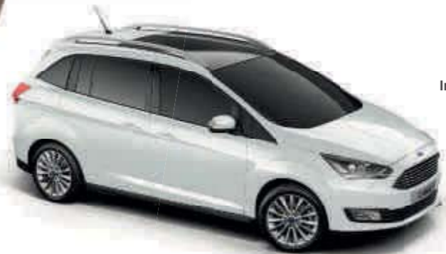
Frozen White Premium*

The Ford C-MAX owes its beautiful and durable exterior to a special multi-stage painting process. From the wax-injected steel body sections to the protective topcoat, new materials and application processes ensure your C-MAX will retain its good looks for many years to come.