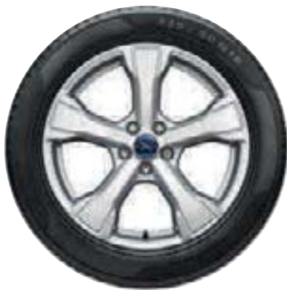
18" 5-spoke alloy wheels