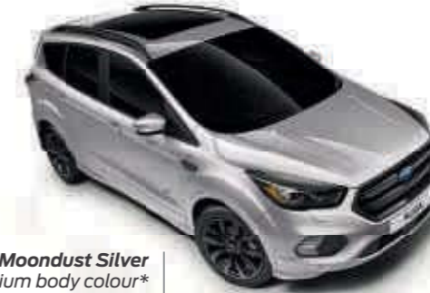
Moondust Silver Premium body colour* Zt T SL