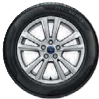
17" 10-spoke alloy wheels