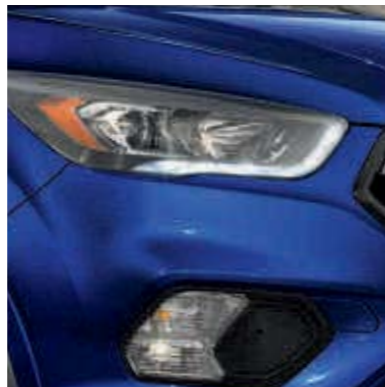
● Black headlight bezels