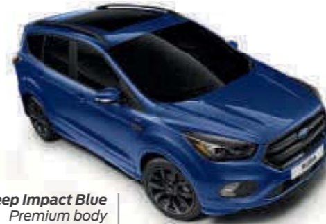
Deep Impact Blue Premium body colour* Zt T SL