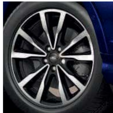
● 18" alloy wheels