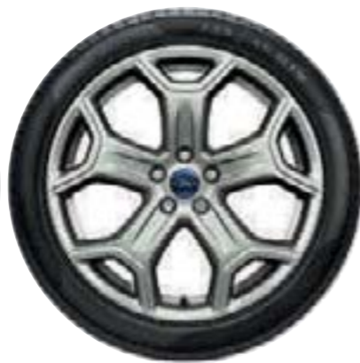
19" 5 Y-spoke alloy wheels