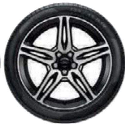
19" 5x2-spoke alloy wheels