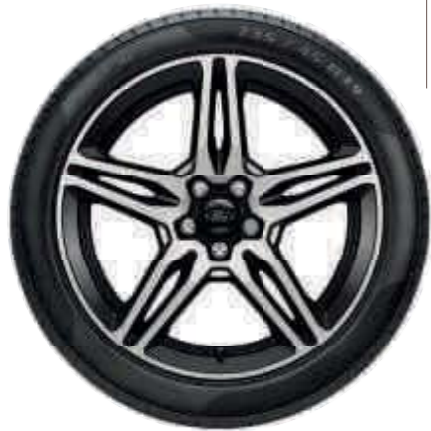
19" 5x2-spoke Black machined alloy wheels. (Option and Accessory)

Robust retention systems helps keep items of luggage in the load compartment of your Ford Kuga. The guard behind the second row is available as an option only because the fixation brackets cannot be retrofitted (option). Installation of the first row guard is available as an accessory (but only for vehicles fitted with second row option and not in combination with panorama roof).