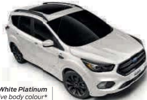
White Platinum Exclusive body colour* Zt T SL