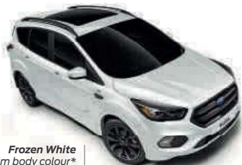
Frozen White Premium body colour* Zt T SL

Zetec Zt Zt Titanium T T ST-Line SL SL Standard Option