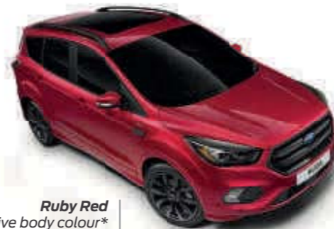
Ruby Red Exclusive body colour* Zt T SL