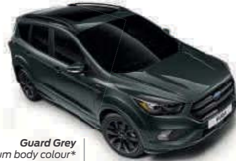
Guard Grey Premium body colour* Zt T SL