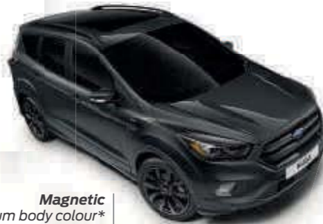
Magnetic Premium body colour* Zt T SL

Ford Kuga owes its beautiful and durable exterior to a special multi-stage painting process. From the wax-injected steel body sections to the protective top coat, new materials and application processes ensure your Ford Kuga will retain its good looks for many years to come.