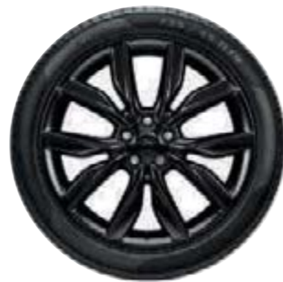
19" 5x2-spoke alloy wheels