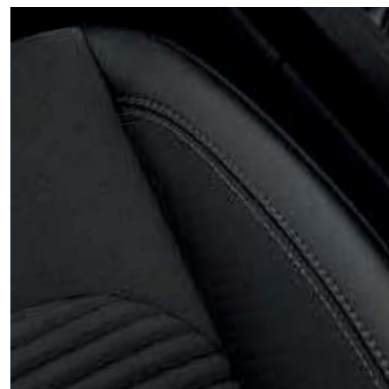
● Partial leather seats