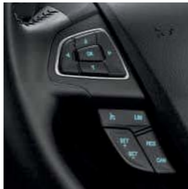
● Cruise control including Adjustable Speed Limiter