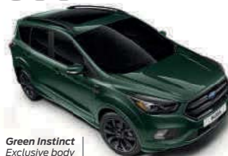
Green Instinct Exclusive body colour* Zt T SL