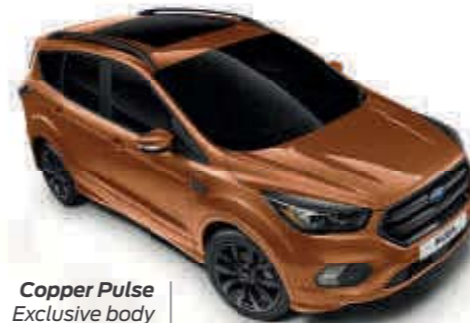
Copper Pulse Exclusive body colour* Zt T SL