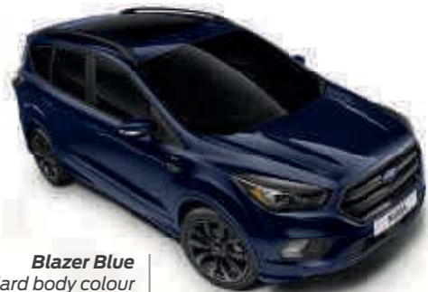
Blazer Blue Standard body colour Zt T SL