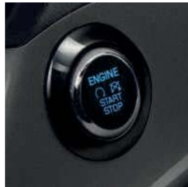
● Keyless Start