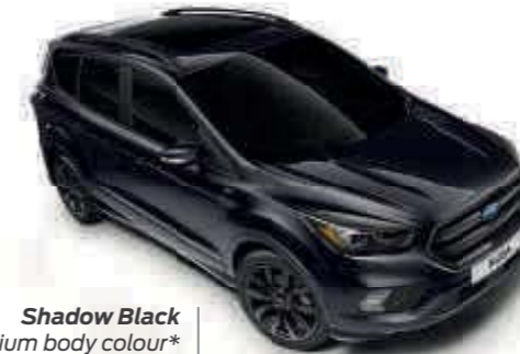
Shadow Black Premium body colour* Zt T SL