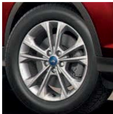
● 17" alloy wheels