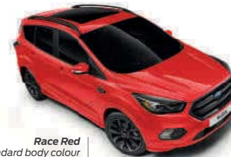
Race Red Standard body colour Zt T SL