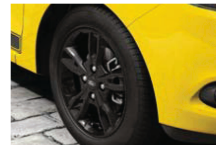
Special 5x2-spoke 15" alloy wheels