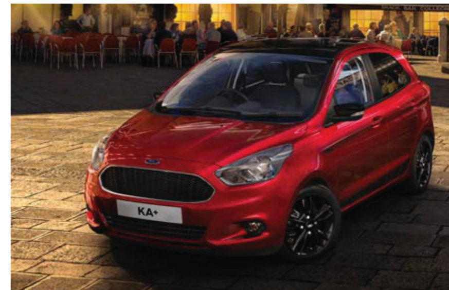
Black contrasting roof and door mirror caps

*Ford Emergency Assistance is an innovative SYNC feature that uses a Bluetooth® paired and connected mobile phone to help vehicle occupants initiate a call to the local Communications Centre, following a vehicle crash event involving an airbag deployment or fuel pump shut off. The feature operates in more than 40 European countries and regions. SYNC and Emergency Assistance not supported by all European Languages. See www.ford.co.uk for the latest information. Model shown left is KA+ Colour Edition in Moondust Silver premium body colour with EATC (options at extra cost).