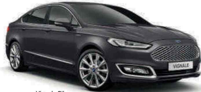
Vignale Silver Metallic body colour