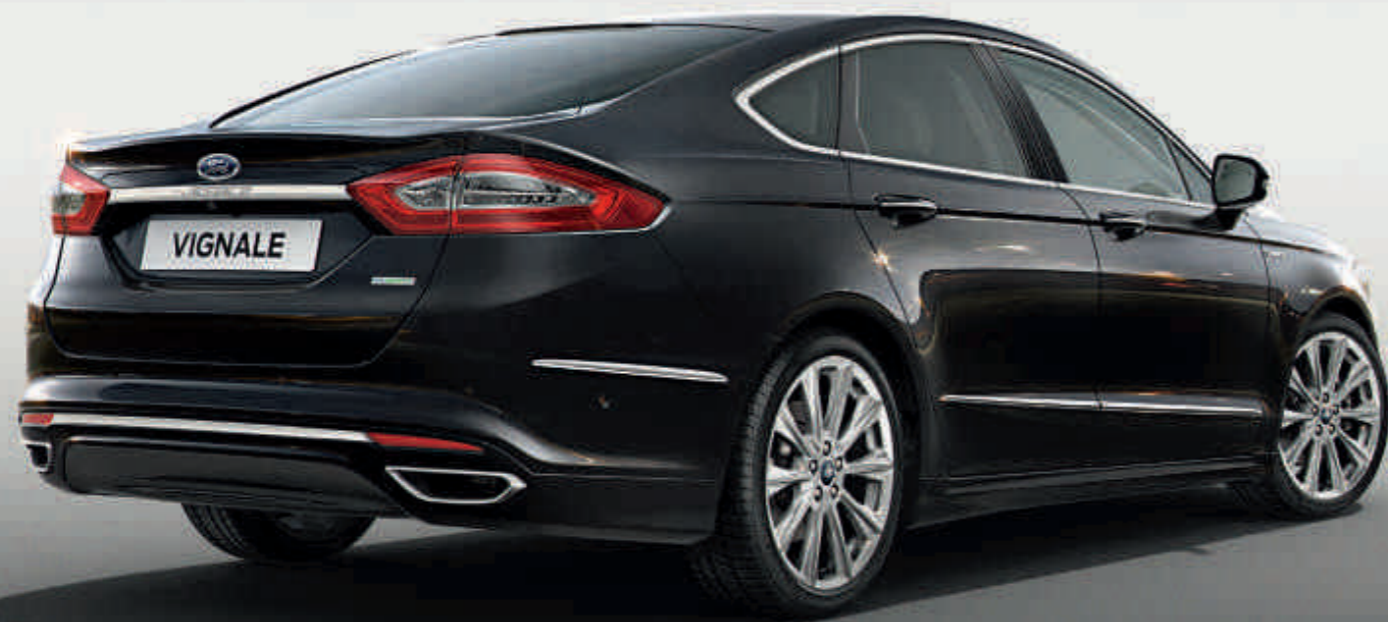
Ford Mondeo Vignale 4-door saloon.