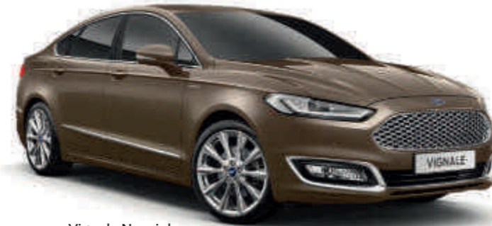
Vignale Nocciola Metallic body colour*