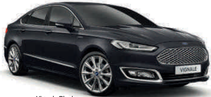
Vignale Black Mica body colour