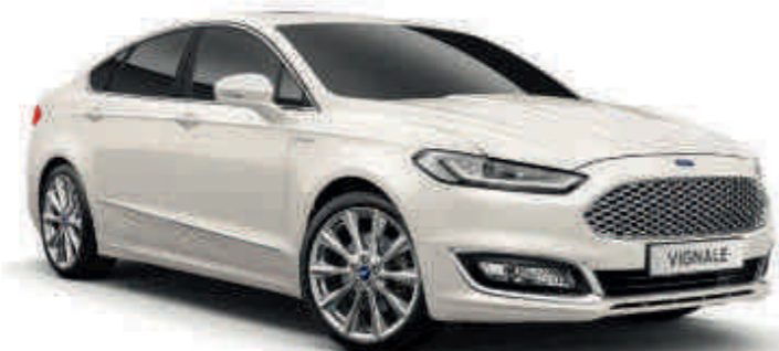
Vignale White Four-Coat metallic body colour*