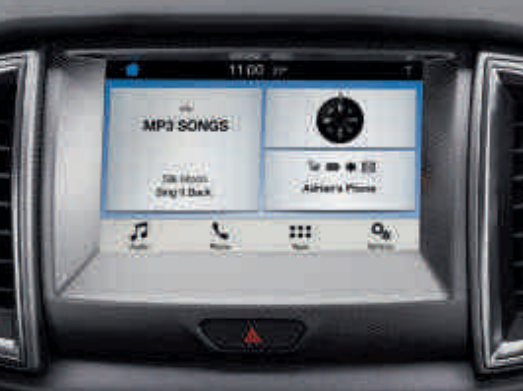
Ford SYNC 3 with 8" TFT touchscreen and Voice Control (Standard)