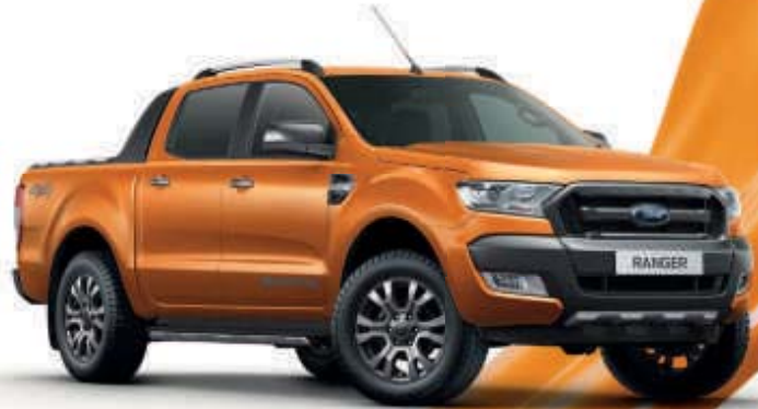
Pride Orange 2) Metallic body colour*

We chose Pride Orange. What will you choose?