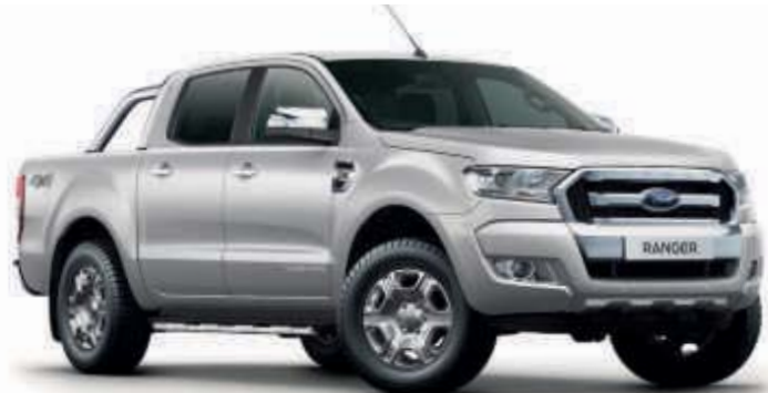
Moondust Silver Metallic body colour*