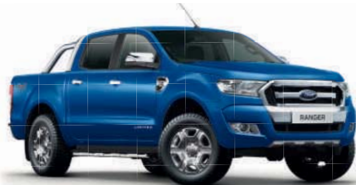
Performance Blue 1) Metallic body colour*