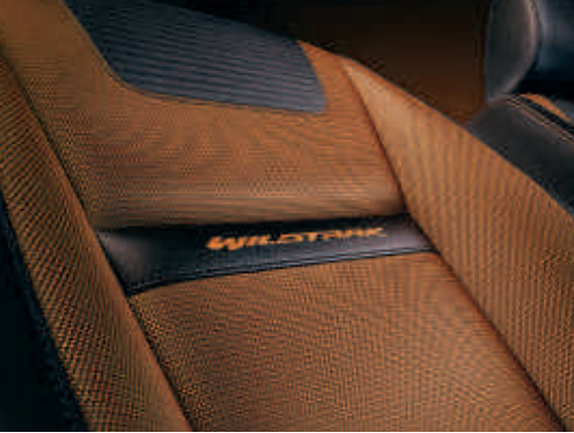
'Wildtrak' logo seat stitching (Standard)