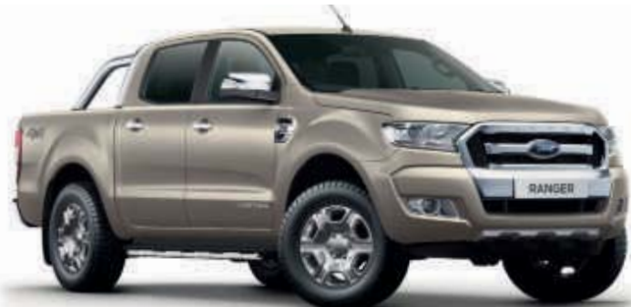
Oyster Silver 1) Metallic body colour*