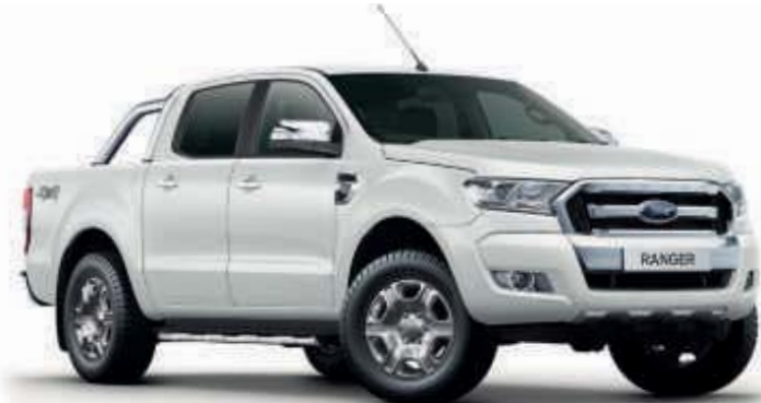
Frozen White Solid body colour