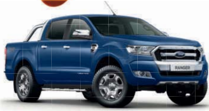
Ocean 1) Metallic body colour*