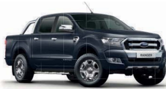
Sea Grey Metallic body colour*