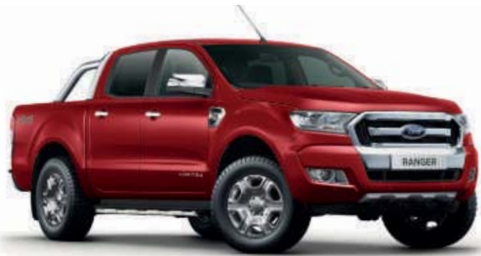
Copper Red 1) Metallic body colour*