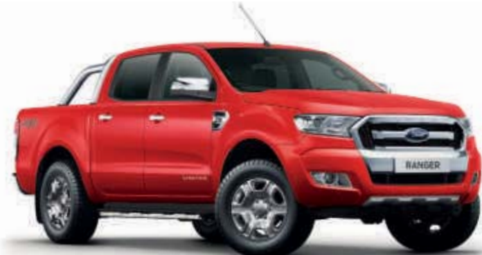
Colorado Red 1) Solid body colour