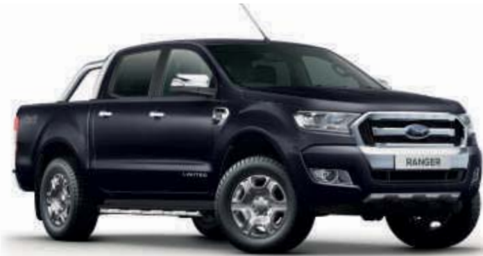
Shadow Black Mica body colour*