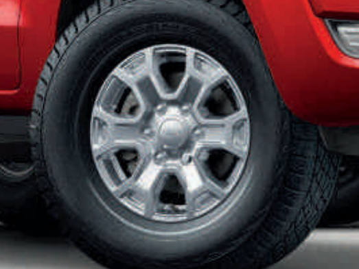
16" Alloy wheels (Standard)