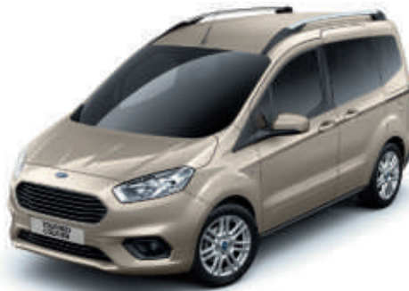
Diffused Silver Exclusive body colour*