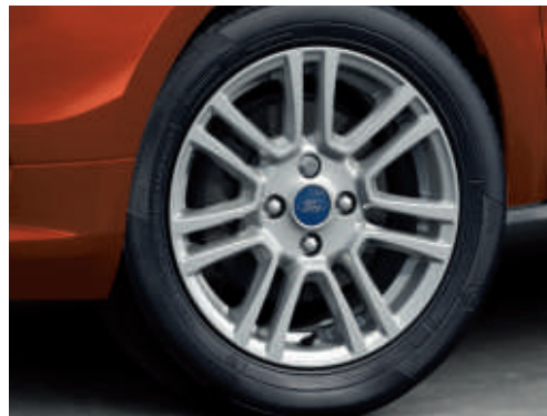
16" 7-spoke silver alloy wheels (Standard)