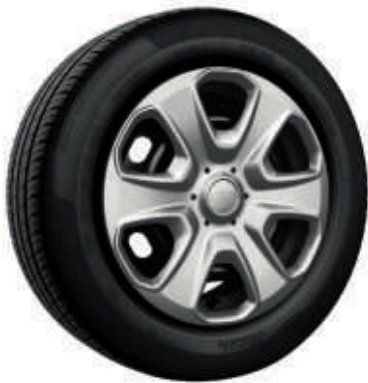
15" wheel cover design (Standard on Zetec)