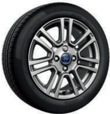
16" 7-spoke alloy wheel (Standard on Titanium, Dealer fit accessory on Zetec)