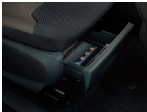
Passenger's side underseat stowage drawer (Standard)

§ Note: A rear-facing child seat should never be placed in the front passenger seat when the Ford vehicle is equipped with an operational front passenger's airbag. The safest place for children is properly restrained on the rear seat.