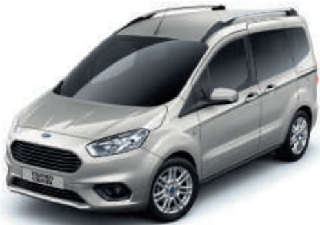
Moondust Silver Premium body colour*