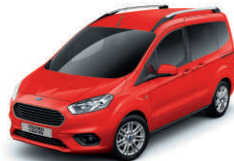
Race Red Solid body colour