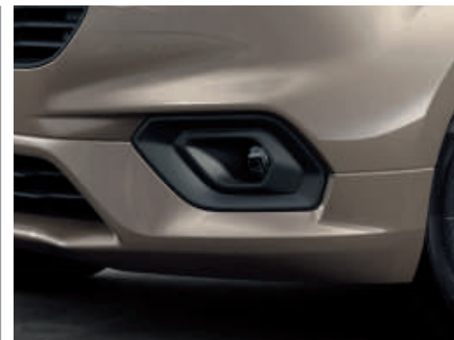
Front fog lights (Standard)

§ Note: A rear-facing child seat should never be placed in the front passenger seat when the Ford vehicle is equipped with an operational front passenger's airbag. The safest place for children is properly restrained on the rear seat.