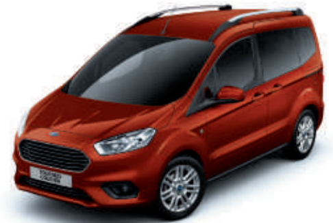
Red Rush Exclusive body colour*