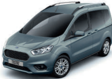
Metal Blue Premium body colour*

*Premium and Exclusive body colours are options at extra cost. Note The car images used are to illustrate body colours only and may not reflect current specification. Colours and trims reproduced within this brochure may vary from the actual colours, due to the limitations of the printing processes used. The Ford Tourneo Courier is covered by the Ford Corrosion Protection Warranty for 12 years from the date of first registration. Subject to terms and conditions.