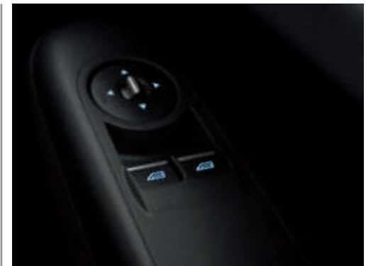
One touch up/down electrically-operated driver's and front passenger's windows (Standard)