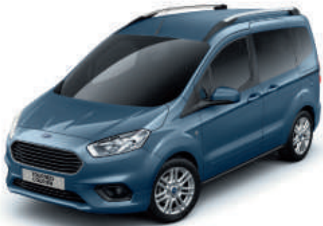
Chrome Blue Premium body colour*