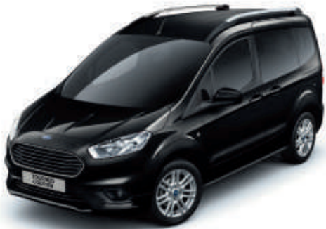
Agate Black Premium body colour*