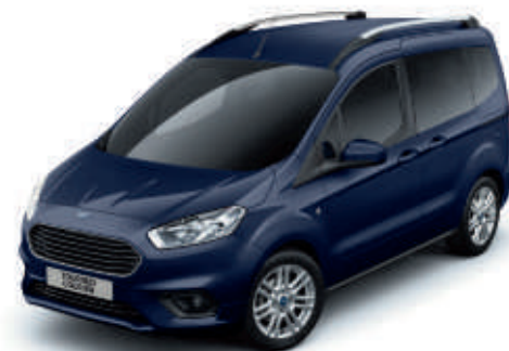
Blazer Blue Solid body colour

Tourneo Courier owes its durable exterior to a thorough multi-stage painting process. From the wax-injected steel body sections to the hard-wearing top coat, new materials and application processes will ensure your new Tourneo Courier retains its good looks for many years to come.