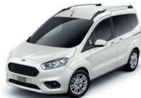
Frozen White Solid body colour