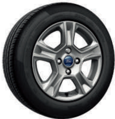
15" 5-spoke alloy wheel (Option on Zetec)