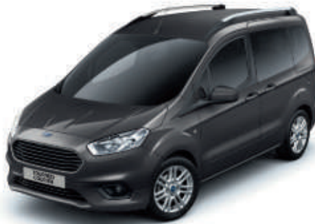
Magnetic Exclusive body colour*