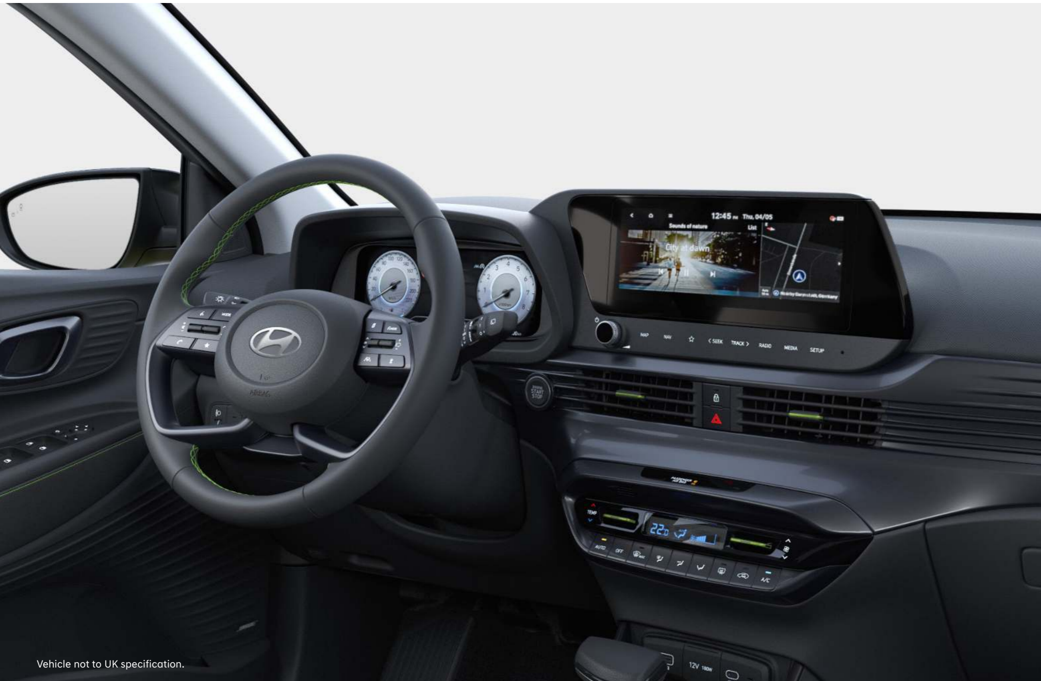
Vehicle not to UK specification.