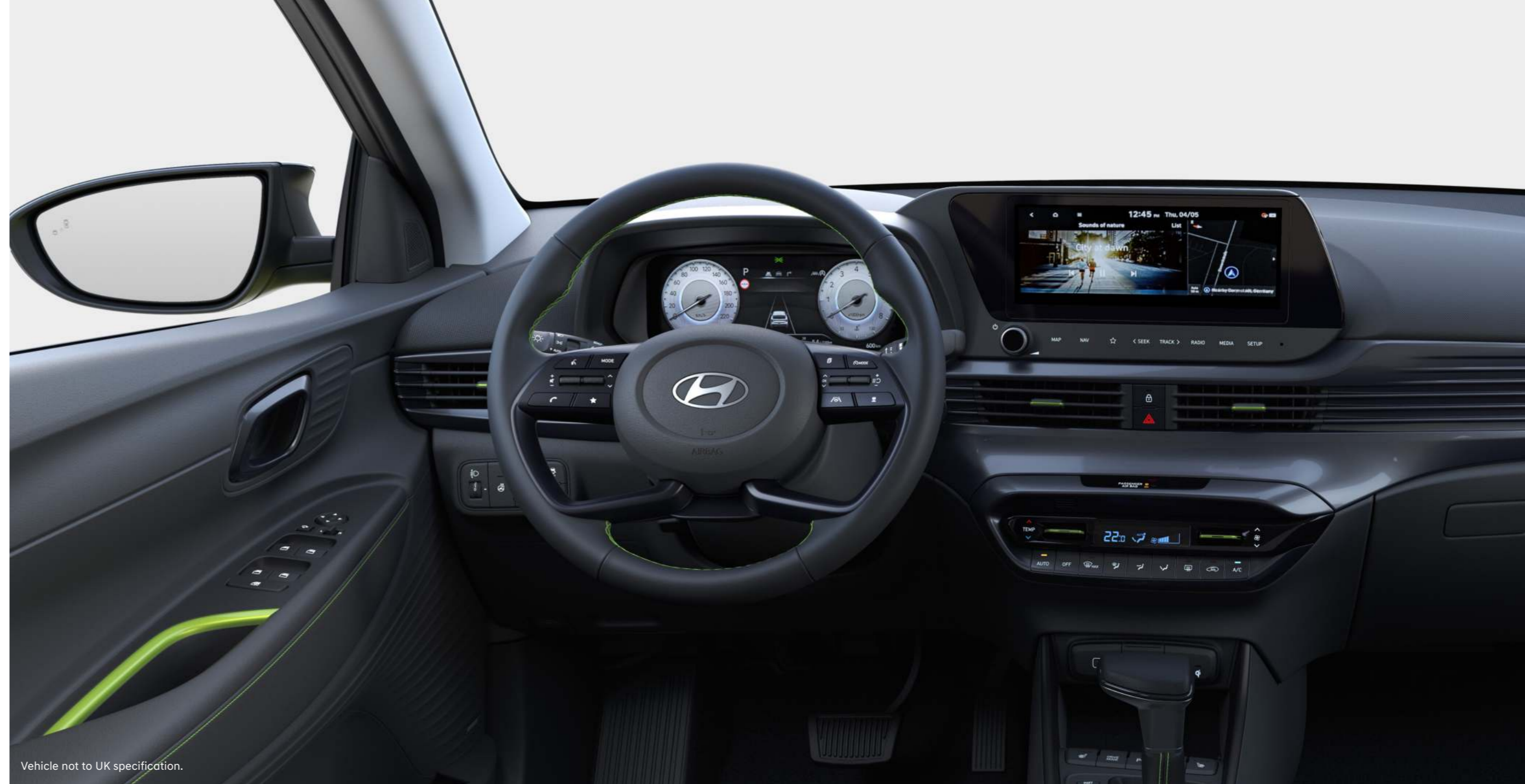
Vehicle not to UK specification.