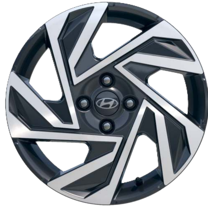
New 16" Alloy Wheel

Choose from two fresh wheel designs created specifically to accentuate the new i20's energetic stance: a new 16" alloy wheel and a new 17" alloy.