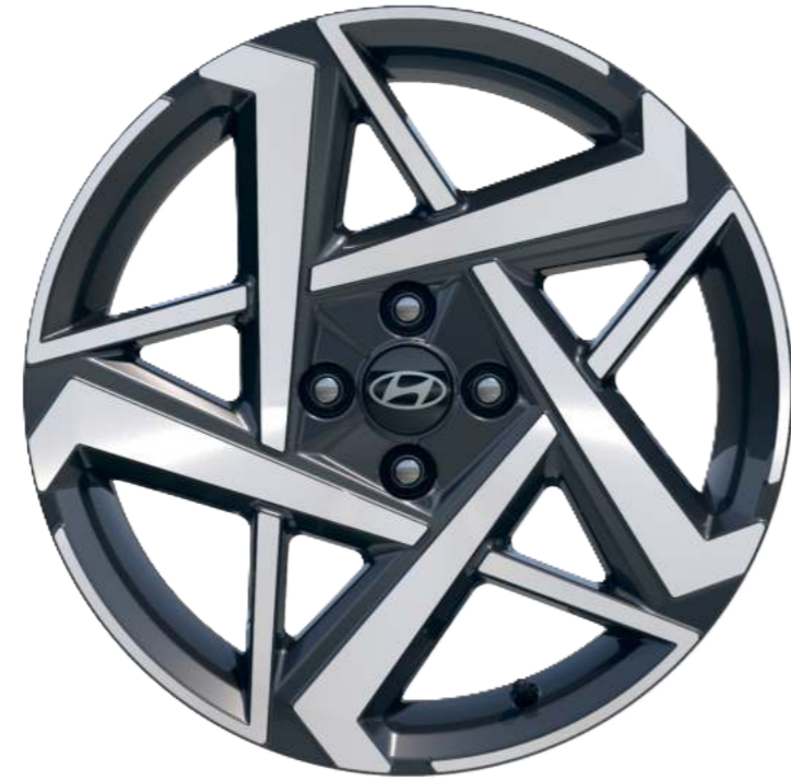
New 17" Alloy Wheel