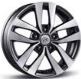
16" 5-twin-spoke Design alloy wheel (metallic grey)