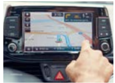
8" floating touchscreen (SE Nav upwards)