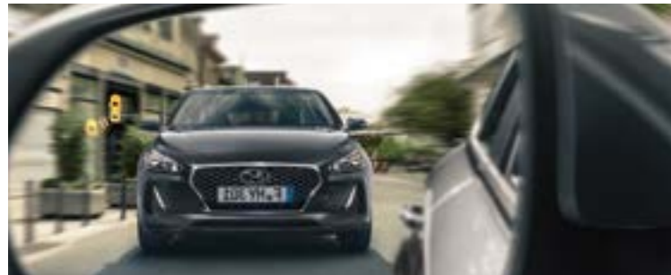
Blind-Spot Detection (BSD) warns of the presence of vehicles hidden in blind spots by means of visual and acoustic alerts (Premium and Premium SE).

Peace of mind is assured for everyone on board the New Generation i30 Tourer. Its Driver Attention Alert technology monitors driver behaviour and detects any tendency of the driver to lose focus on driving safely. Among other advanced safety technologies are Autonomous Emergency Braking and Lane Keeping Assist System.