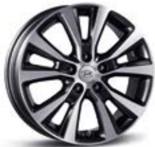
17" 5-twin-spoke Design alloy wheel (metallic grey)