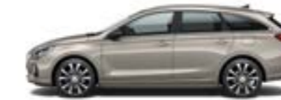
White Sand (Metallic)