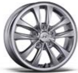
15" 5-twin-spoke Design alloy wheel (metallic grey)