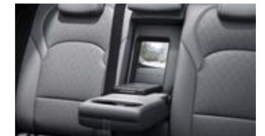
Centre armrest with Ski-Through (SE upwards)