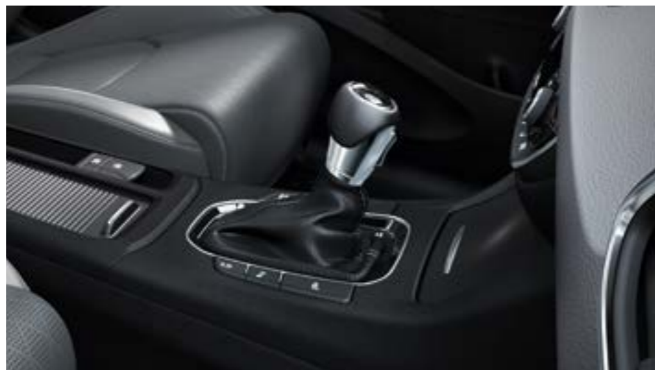
7-speed Dual-Clutch Transmission

New turbocharged petrol engines and a 7-speed Dual-Clutch Transmission invigorate the performance of the New Generation i30 Tourer. The highlight is the new 1.4 T-GDi, delivering a powerful 140PS. There's also a new 1.0 T-GDi with 120PS and a 1.6 Turbo-Diesel, available with power outputs of 110PS or 136PS (DCT only). Together with sharper steering, agile handling and the extensive use of weight-saving Ultra High Strength Steel, it all adds up to a thoroughly rewarding driving experience.