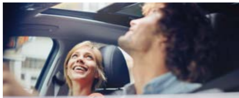
Panoramic Sunroof (Premium SE only)