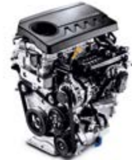
1.4l T-GDi with 140PS