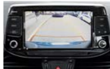
Rearview Camera (SE upwards)