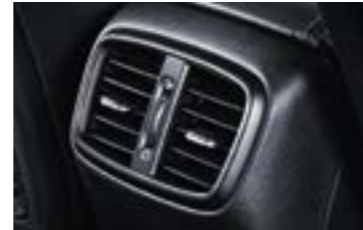
Rear Air Vents (Premium and Premium SE)