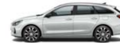
Platinum Silver (Pearl)