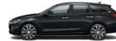
Phantom Black (Pearl)