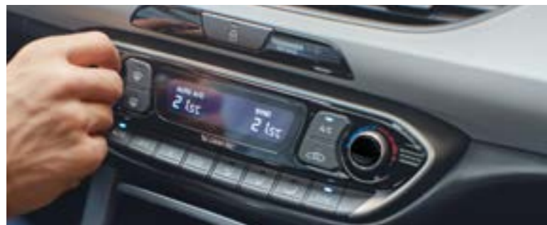
Dual-Zone Climate Control (Premium and Premium SE)

The calm sophistication of the cabin expresses a feeling of quality, elegance and space that is further enhanced by the large Panoramic Sunroof. A button-operated Electric Parking Brake frees up space on the centre console, and the roomy interior has plenty of useful storage spaces, perfect for family expeditions. Rear seat passengers benefit from their own vents for heated or cooled air, while the front seats offer an additional option for heating.