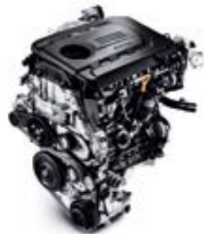
1.6l CRDi with 110/136PS (110PS Manual only, 136PS DCT only)