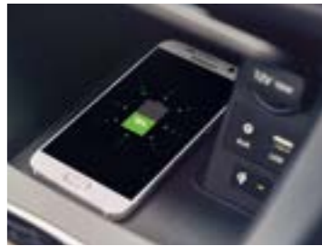
Wireless smartphone charging*

(SE Nav upwards) *Non-compatible smartphones require a wireless charging adapter.