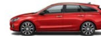
Engine Red (Solid)