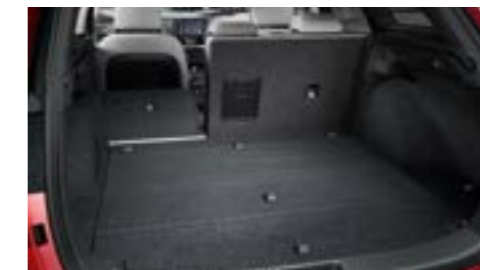
60/40 Split-folding rear seats

Opening the tailgate reveals the hidden talents of the New Generation i30 Tourer. You'll discover a roomy 602-litre load space that can be extended to a generous 1650-litres by folding down the rear seats. This built-in versatility makes the New Generation i30 Tourer your ideal partner for family outings, leisure activities or business purposes. And wherever your day takes you, you know that you'll always be arriving in superlative style.