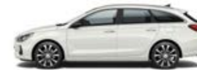
Polar White (Solid)