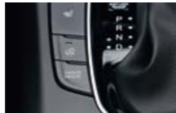
Drive Mode Select (DCT only)