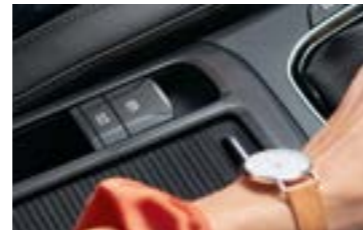
Electronic Parking Brake (Premium and Premium SE)