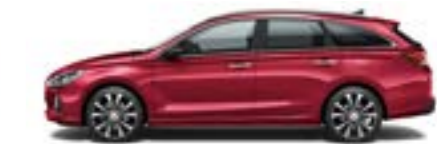
Fiery Red (Metallic)