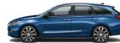
Stargazing Blue (Pearl)