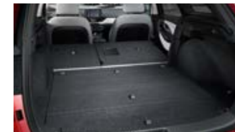
Large loading capacity