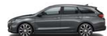
Micron Grey (Metallic)