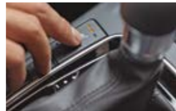
Heated Seats (Premium and Premium SE)