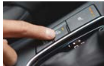
Heated Steering Wheel (Premium SE only)