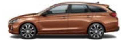
Intense Copper (Metallic)