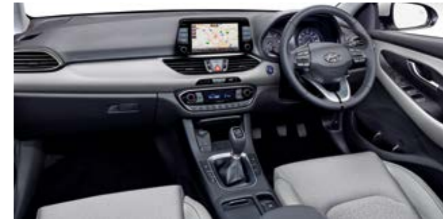
2-tone Black/Grey (Premium SE only)