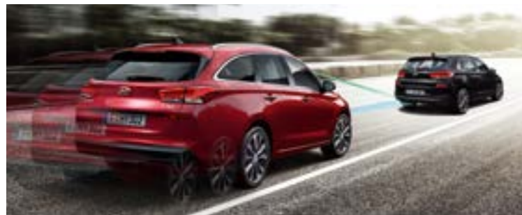
Autonomous Emergency Braking (AEB) can apply partial or maximum braking force if a potential collision is detected.