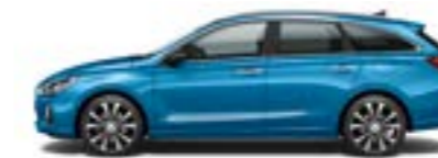
Ara Blue (Metallic)