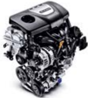
1.0l T-GDi with 120PS