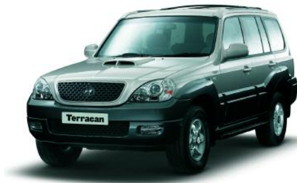
Warm Silver (Metallic)