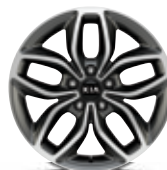
18" Alloy Wheels with Graphite Finish