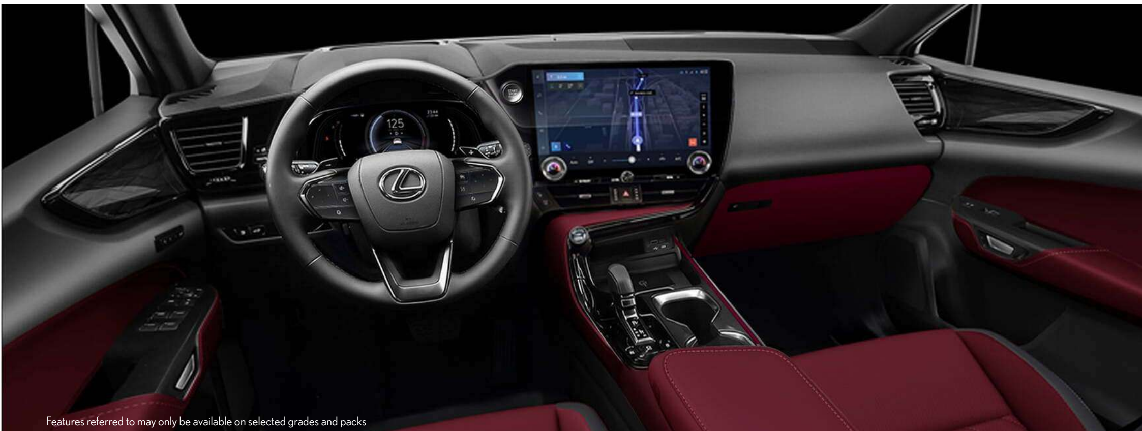
Features referred to may only be available on selected grades and packs

At once thrilling and soothing, the performance is made all the more pleasurable by S-Flow climate control, which, sensing which seats are occupied or where the sun is shining, adjusts the interior climate accordingly. And accompanied by the tranquility of the electrified hybrid powertrain, takes you to your destination in