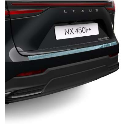
Rear Bumper Protection Film