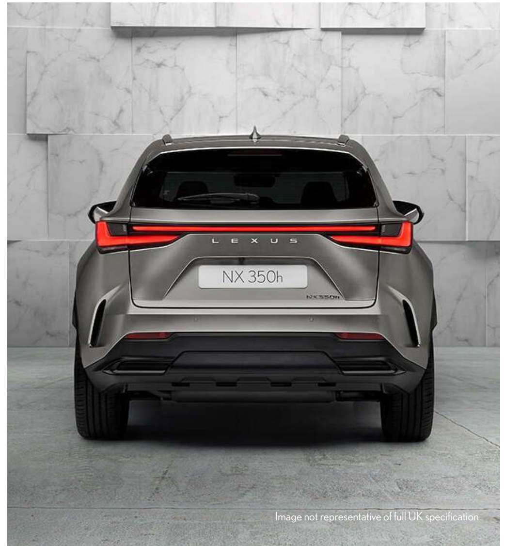
Image not representative of full UK specification