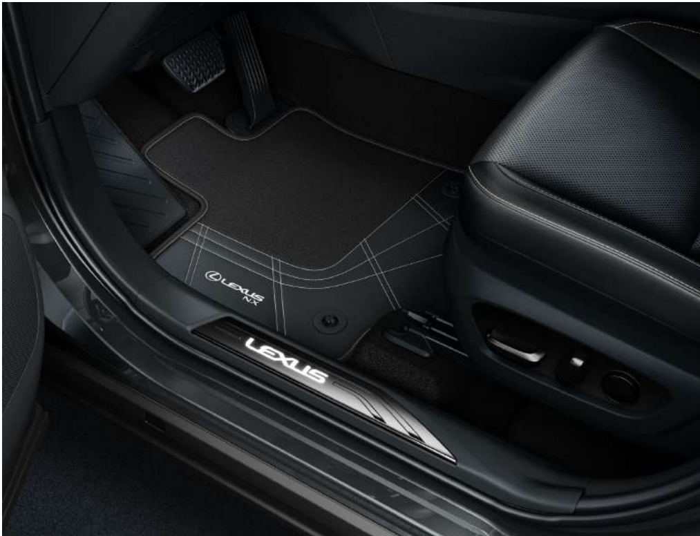
Standard Scuff Plates

First impressions matter. The illuminated scuff plates give the already sleek interior of your NX an added premium feel whilst protecting the interior panels of your Lexus SUV.