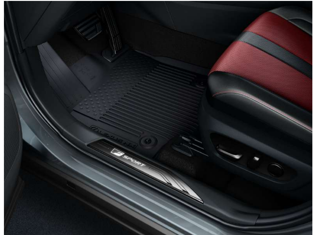
F Sport Scuff Plates with Rubber Floor Mats