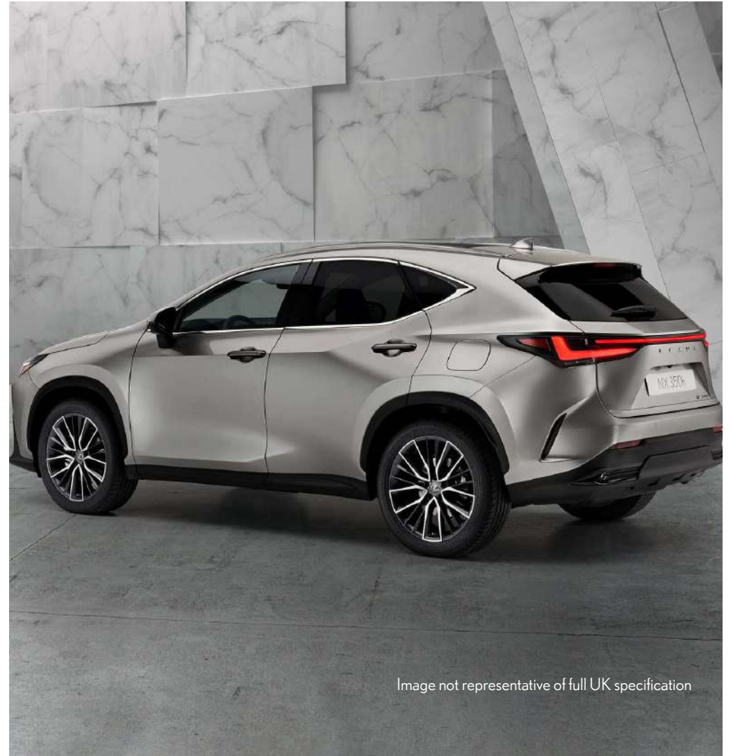
Image not representative of full UK specification