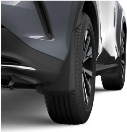
Front & Rear Mud Guards

Our protection pack is tailor-made with high-end materials that were designed for the interior and exterior of your NX. The pack comes with a set of Front & Rear Mud-Guards that keep pebbles and other road debris away from scratching your vehicle's paint. On the inside, you'll find tailor-made, tough & resistant rubber floor mats that are easy to clean for both front and rear passengers and at the rear of the vehicle, you will also find a boot liner made of the same material – the perfect staple if you use the rear of your vehicle regularly and like keeping this area clean & tidy. The pack also features a new transparent, highly resistant protective-film that will keep the top of your rear bumper scratch-free. Enabling you to load your boot area as many times as you want, without having to worry about scratching the paintwork.