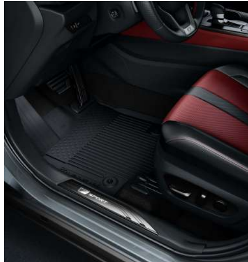
F-Sport Scuff Plates with Rubber Floormats