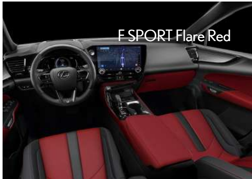
F SPORT Flare Red