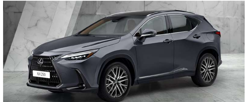
Front Skirt & Side Chrome Garnish

Minimalism blended with flair – this is the look our Design Pack achieves. The design pack adds stylish chrome garnishes to the front, side panels and rear of your new NX.