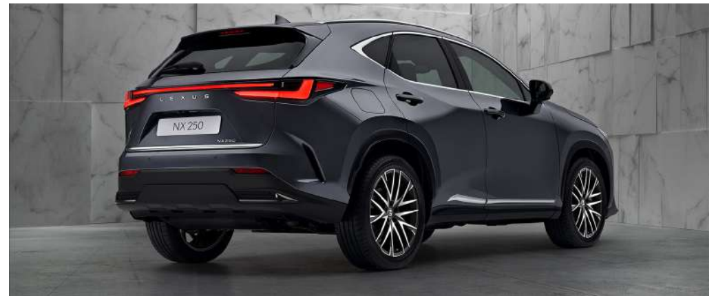
Rear Chrome Garnish & Side Chrome Garnish