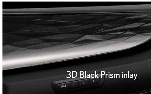
3D Black Prism inlay