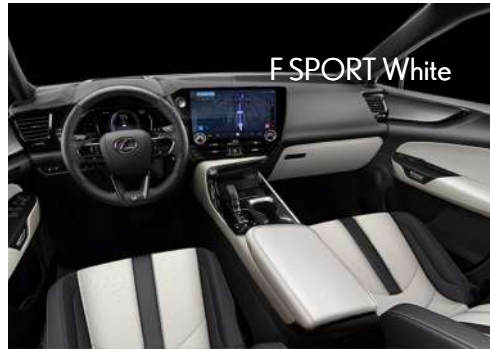
F SPORT White