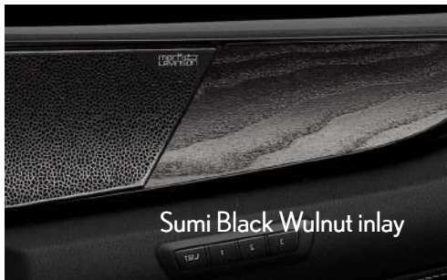
Sumi Black Walnut inlay