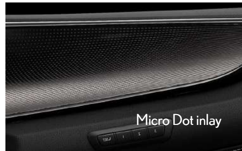
Micro Dot inlay