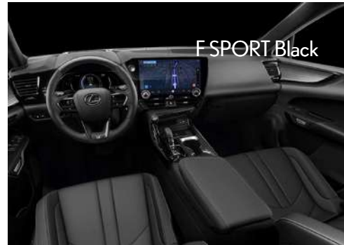
F SPORT Black