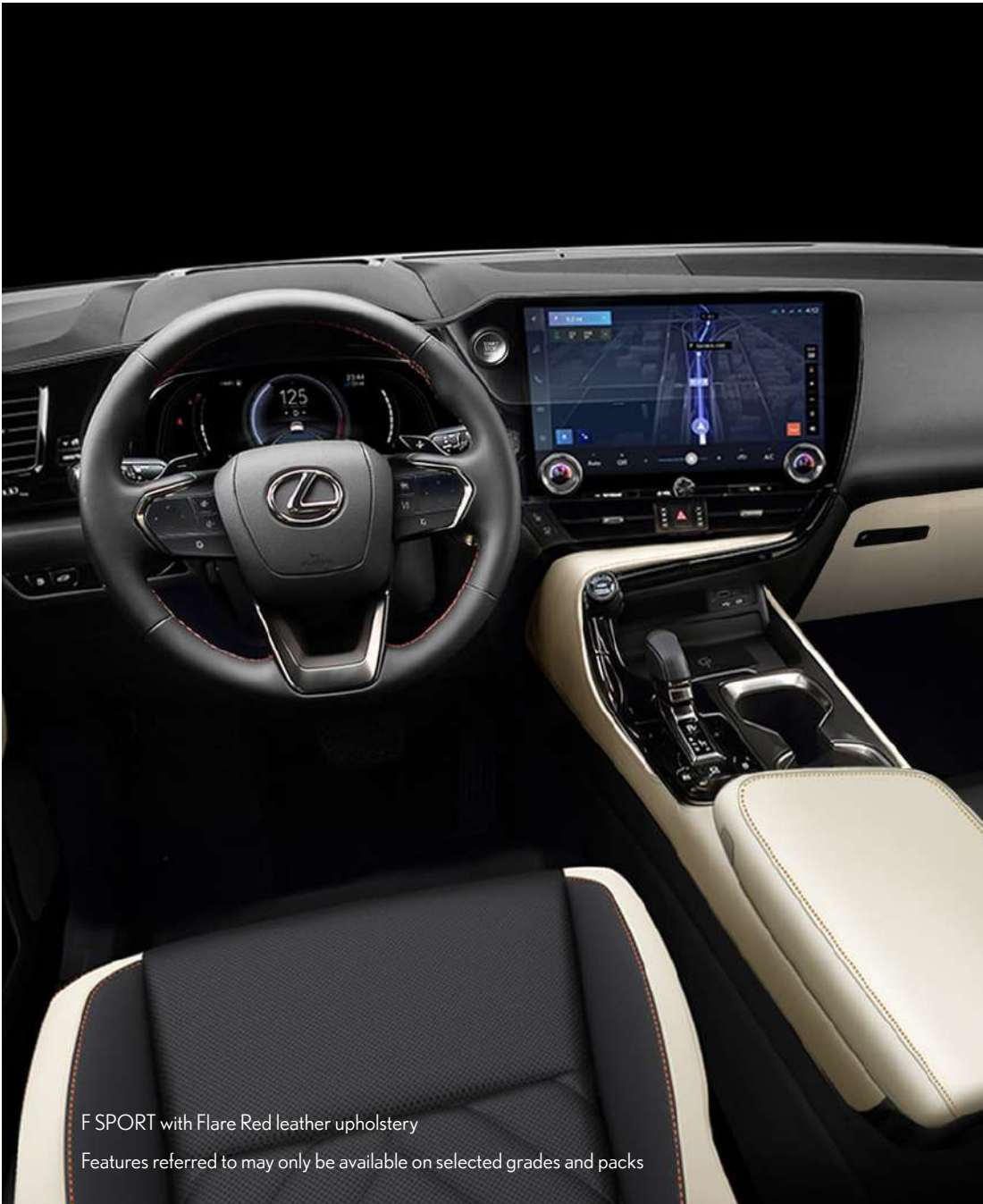
F SPORT with Flare Red leather upholstery

Features referred to may only be available on selected grades and packs