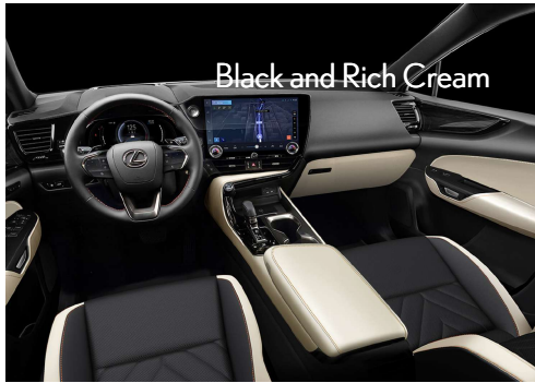
Black and Rich Cream