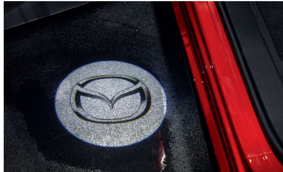
LED door illumination– Mazda logo puddle light