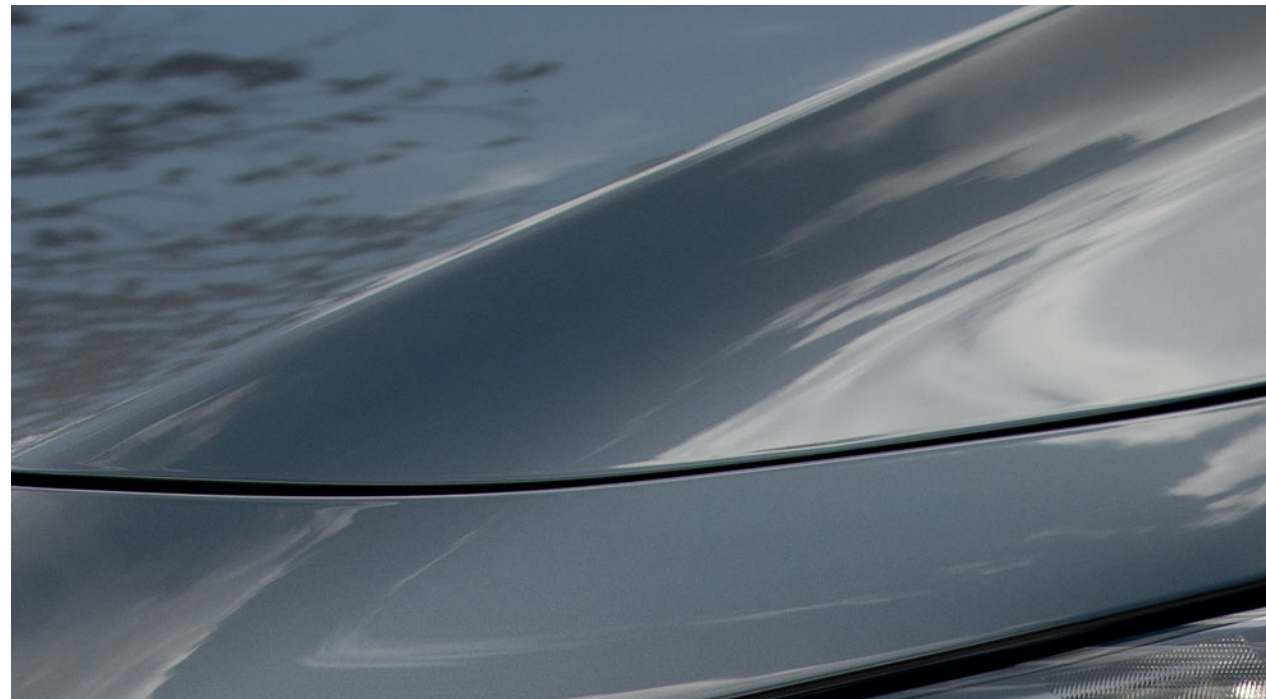
Machine Grey Metallic

The colour on the Mazda CX-5 is one of the first things that will catch your attention. Its delicate beauty and strong character are endorsed by the craft of Takumi-Nuri, Mazda's high-quality painting technology, which makes the Kodo design come alive and amplifies the beauty of every line. Takumi-Nuri balances depth and glossiness to give the impression of a hand-painted concept car. It enables the exceptional vividness and depth achieved in the signature Soul Red Crystal Metallic and Machine Grey Metallic premium colours.