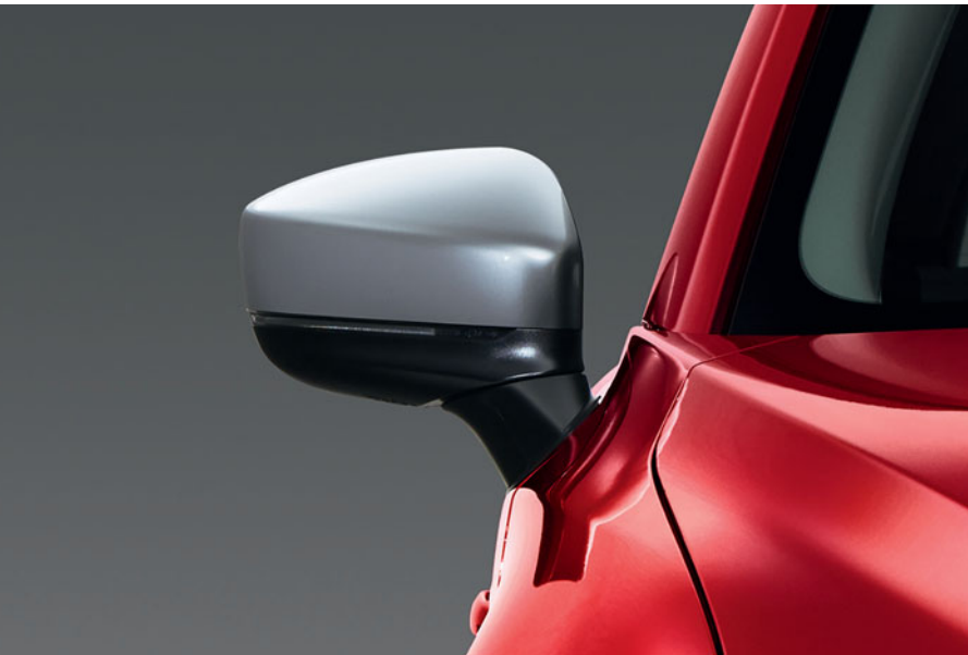
Silver mirror caps

Mazda has created thoughtfully designed accessories that perform seamlessly with your Mazda CX-5.