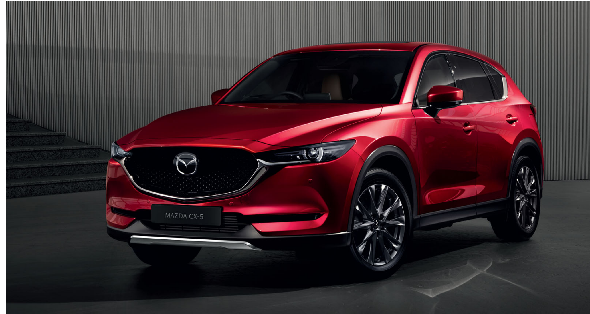
Front Under Trim