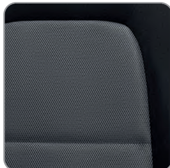
Black/Grey Fabric (CZ2/ClearTec)