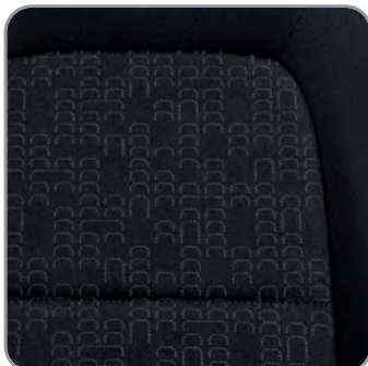
Black Fabric (CZ1)

Colours and trims reproduced on these pages may vary from the actual colours due to the limitations of the printing process used.