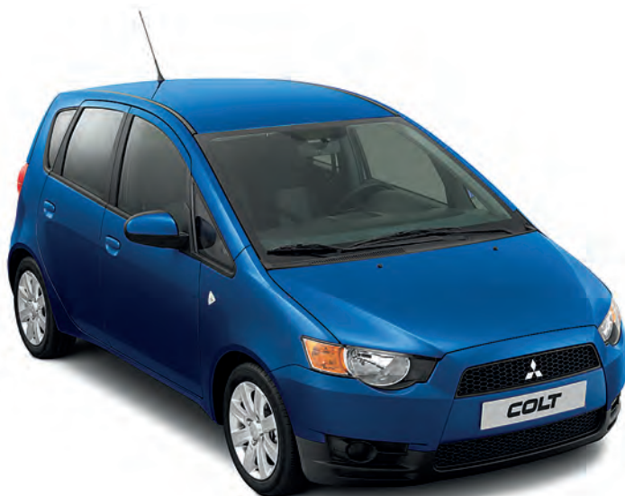
Atlantis Blue (P)