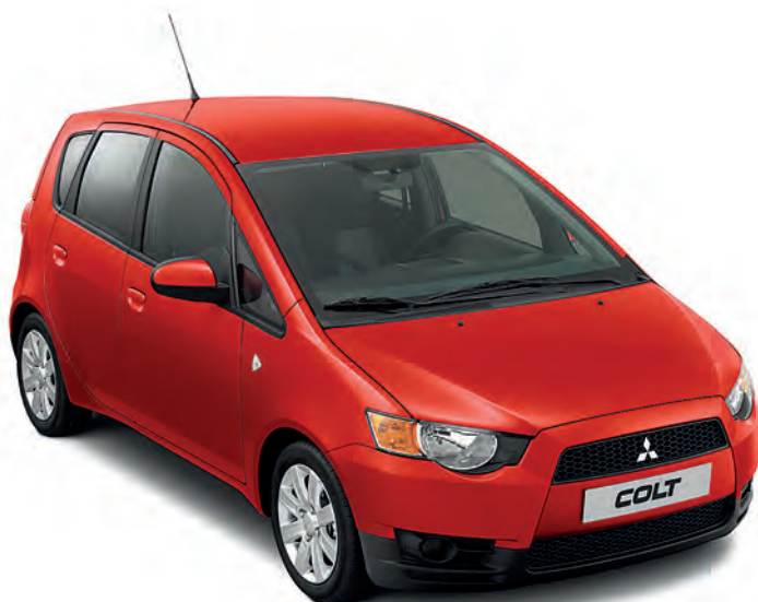
Spicy Red (S)