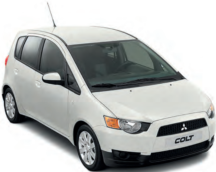
Porcelain White (S)