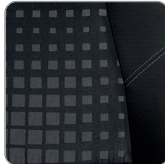
Black/Silver Fabric/Leather-look (Ralliart)