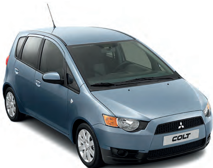
Graphite Blue (M)