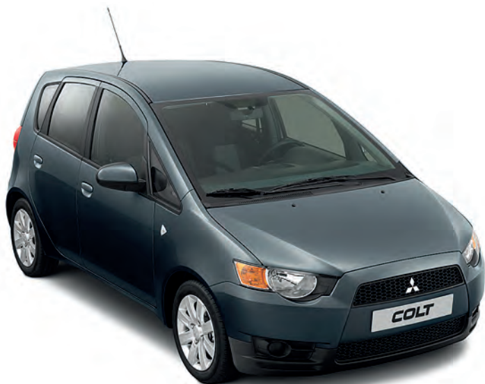
Smoked Grey (M)