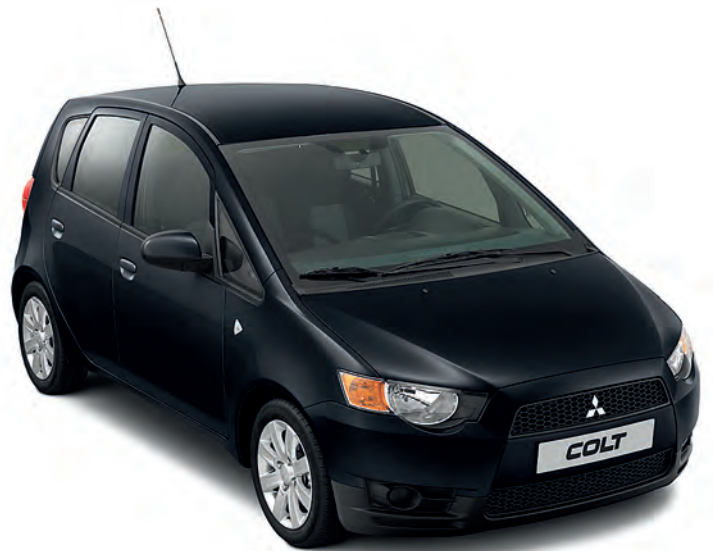
Sparkling Black (M)