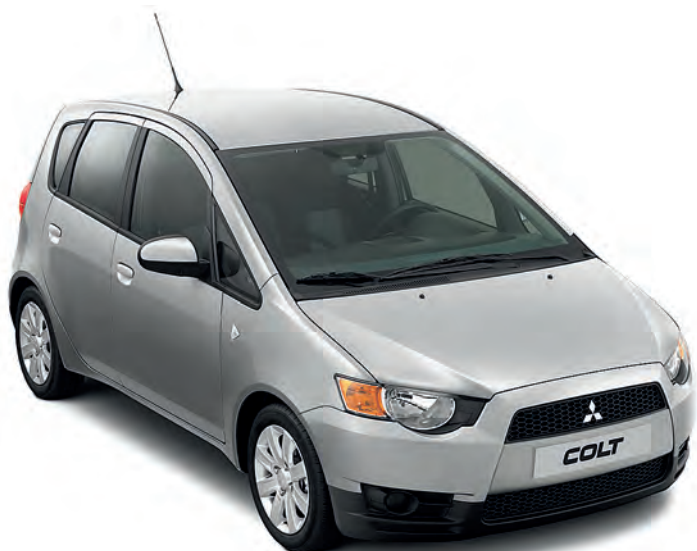
Lunar Silver (M)