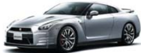
Ultimate Silver (KAB)