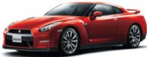
NEW Vermillion Red (NAS)