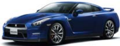
Daytona Blue (RAY)