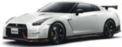
Storm White (QAB)