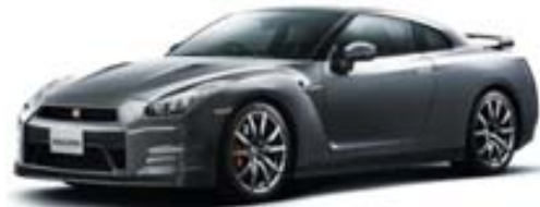
Gun Metallic (KAD)