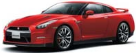
Vibrant Red (A54)