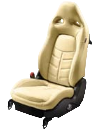
NEW Premium Ivory Leather*

*Some parts of leather trim may contain artificial leather