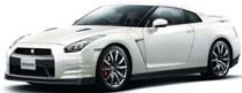
Storm White (QAB)