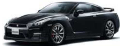
Pearl Black (GAG)