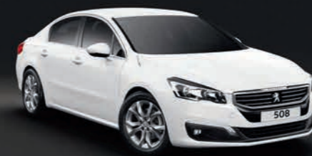
SOLID PAINT - Bianca White