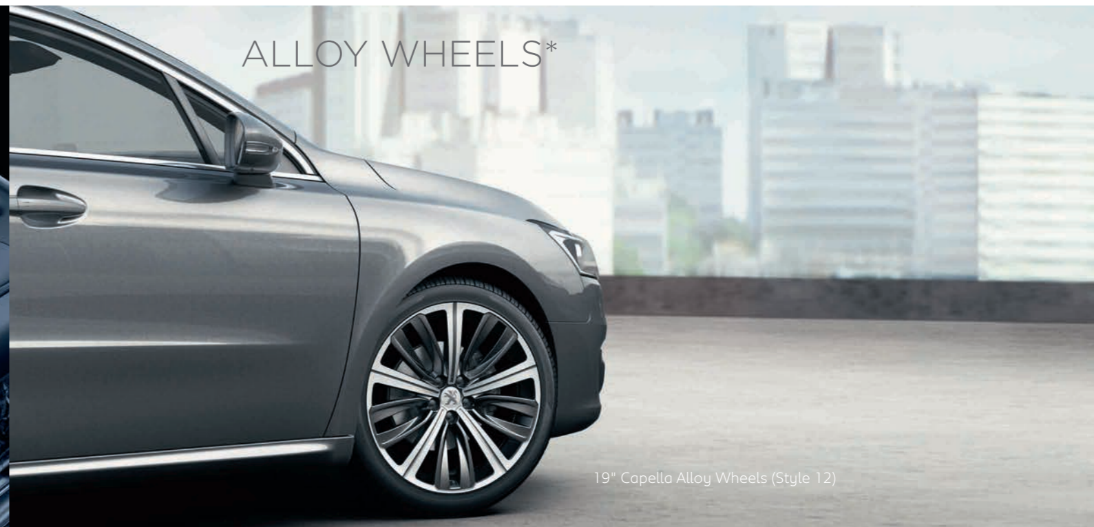
19" Capella Alloy Wheels (Style 12)