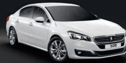
PEARLESCENT PAINT - Pearl White