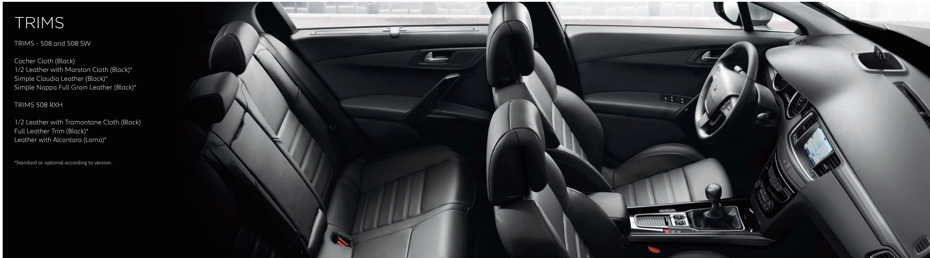
Cocher Cloth (Black)

*Standard or optional according to version.