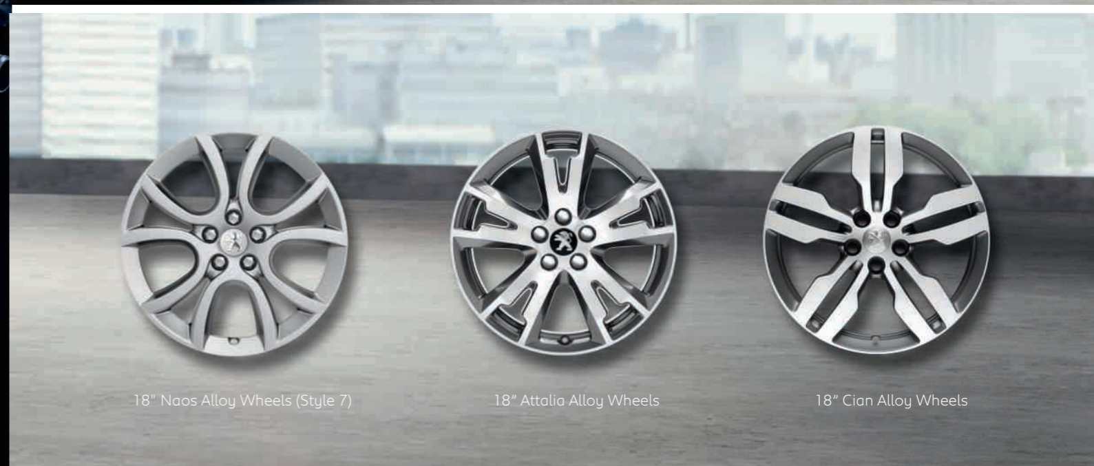
18" Naos Alloy Wheels (Style 7)