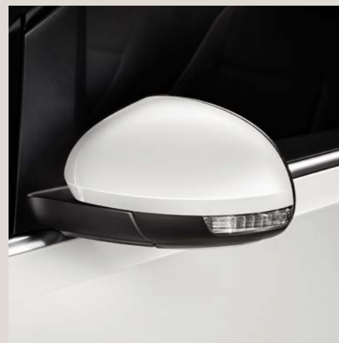
Pure White 1 S SE SEL XC