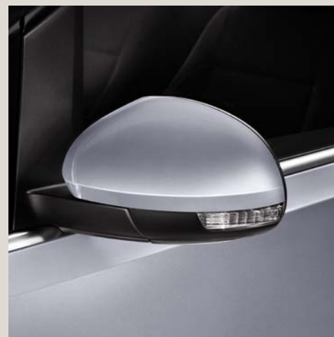
Moonstone Silver 2 S SE SEL XC