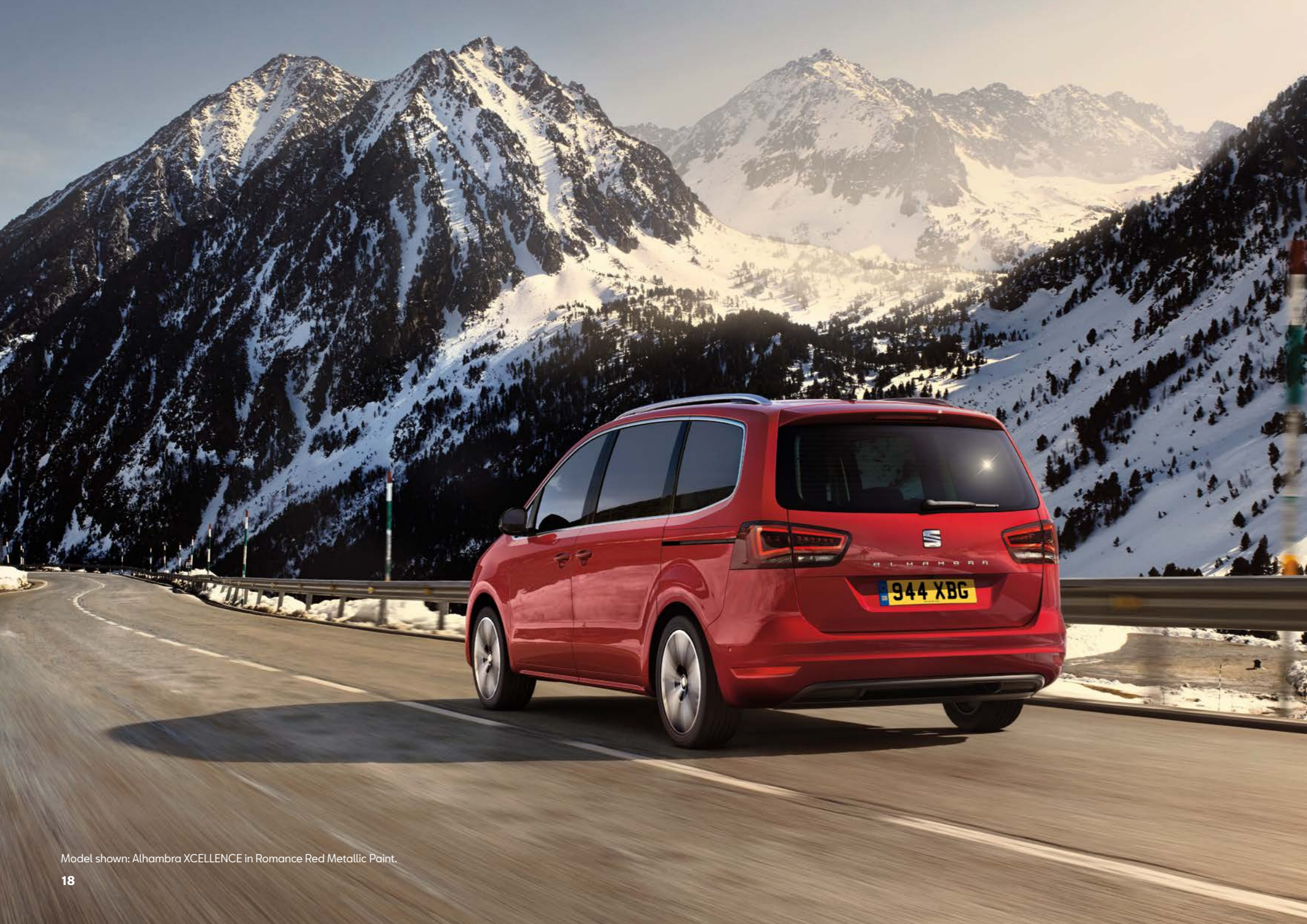
Model shown: Alhambra XCELLENCE in Romance Red Metallic Paint.