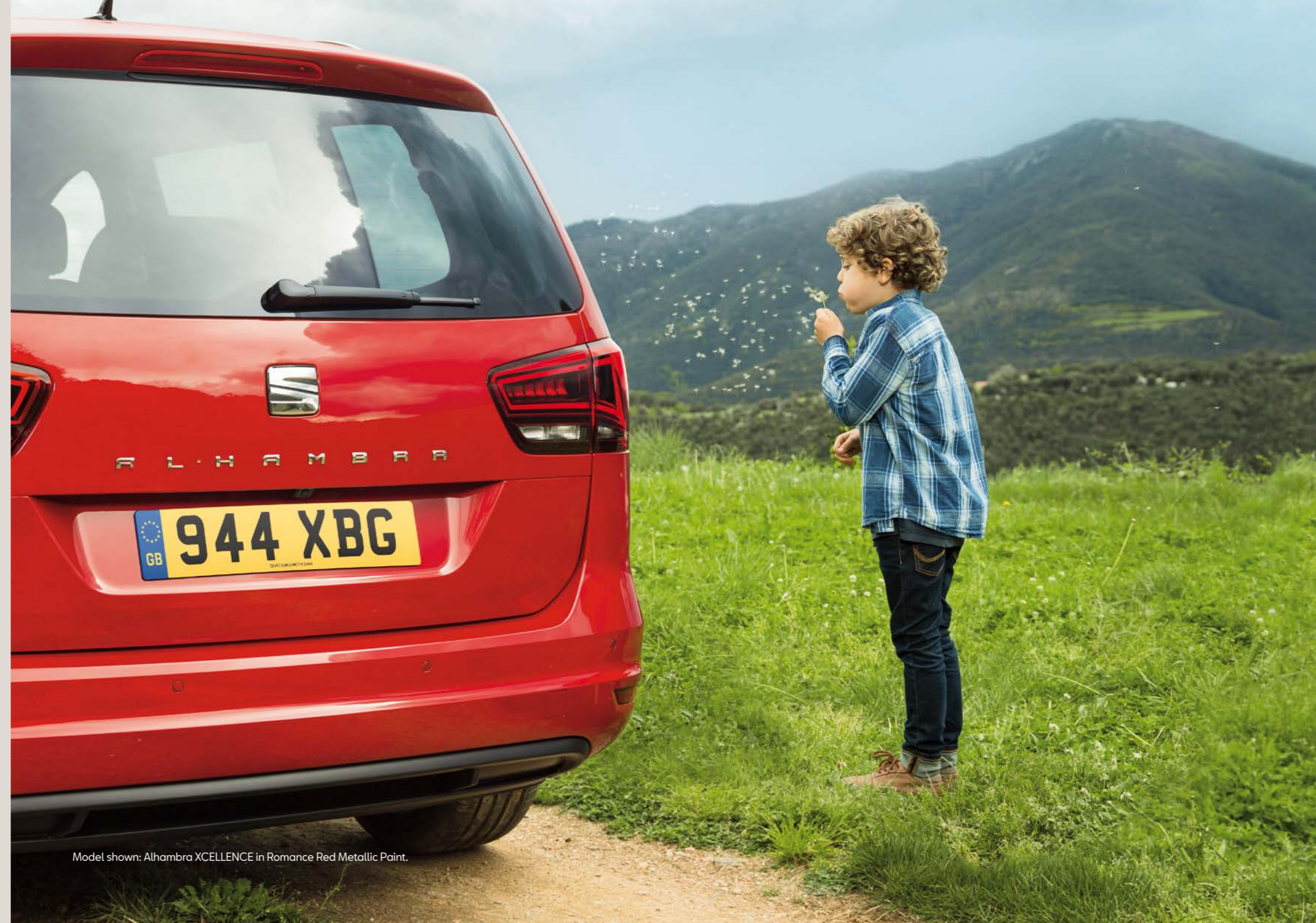
Model shown: Alhambra XCELLENCE in Romance Red Metallic Paint.

But Barcelona still inspires us. Its creative spirit runs through our veins. Feeds into every car we produce. (In fact, 50% of the energy we use to make our cars comes direct from Mediterranean sunshine). This is a city that never stops. And neither will we. Why? Because you have places to be.