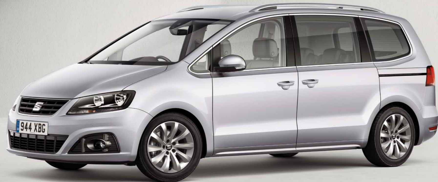
Model shown: Alhambra SE in White Silver Metallic Paint.