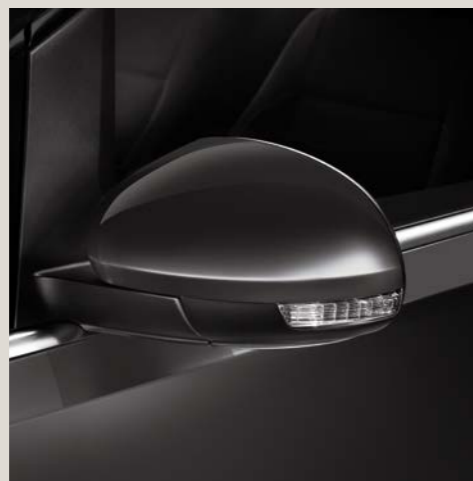
Urano Grey 1 S SE SEL XC