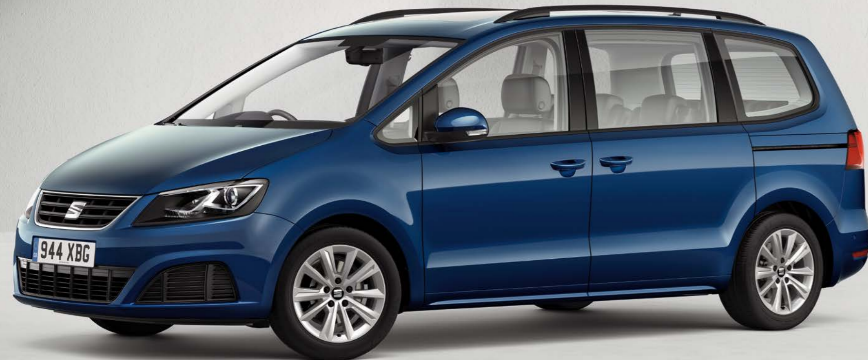
Model shown: Alhambra S in Atlantic Blue Metallic Paint.