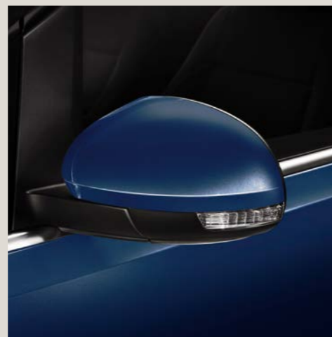
Atlantic Blue 2 S SE SEL XC