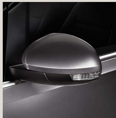
Indium Grey 2 S SE SEL XC