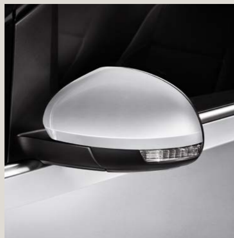
White Silver 2 S SE SEL XC