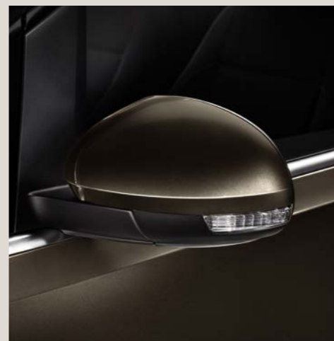
Black Oak Brown 2 S SE SEL XC