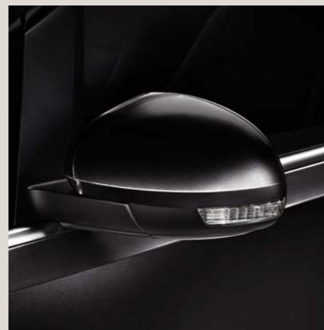
Deep Black 2 S SE SEL XC