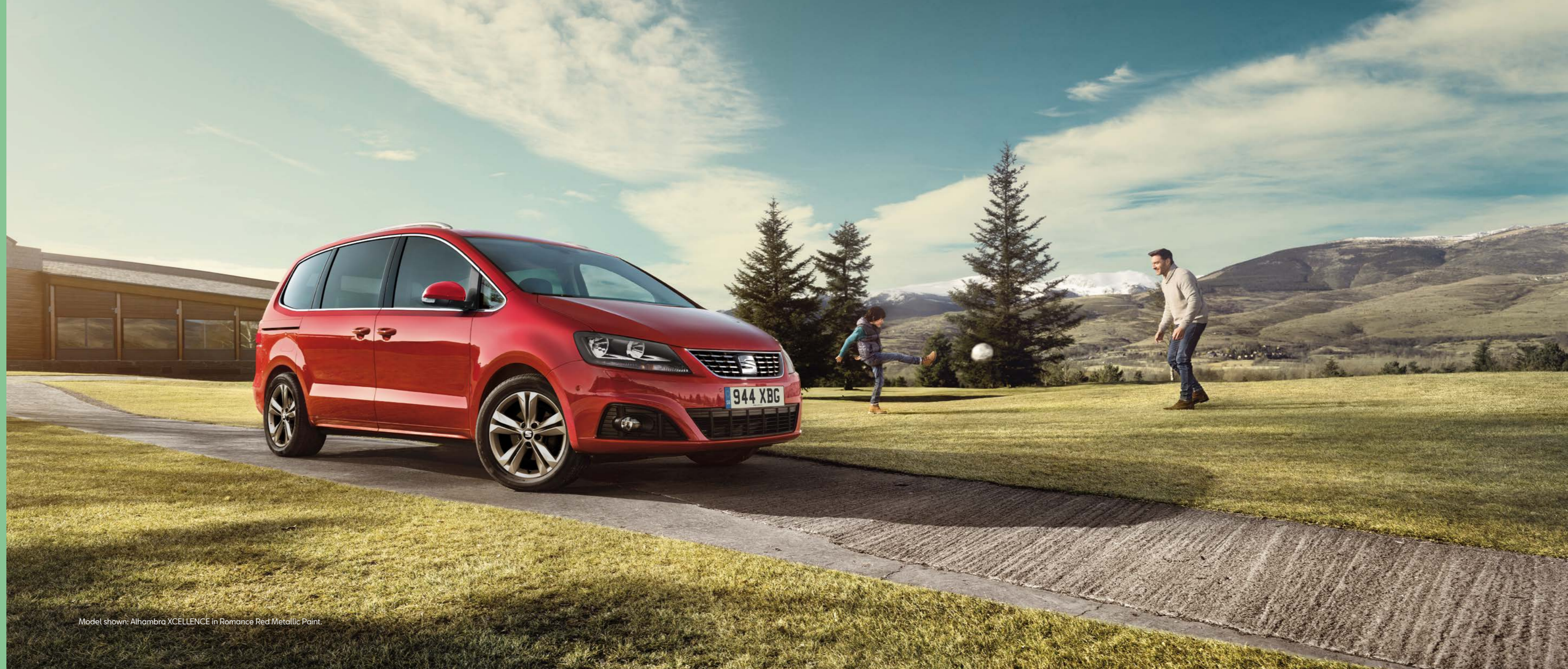
Model shown: Alhambra XCELLENCE in Romance Red Metallic Paint.

Big family decisions feel exciting when you know you've made the right choice. When it comes to an outstanding family car, you expect everything from space and safety to technology and efficiency, plus a powerful, sporty edge. This is the award-winning 7-seater Alhambra – one of the easiest choices you'll make together.