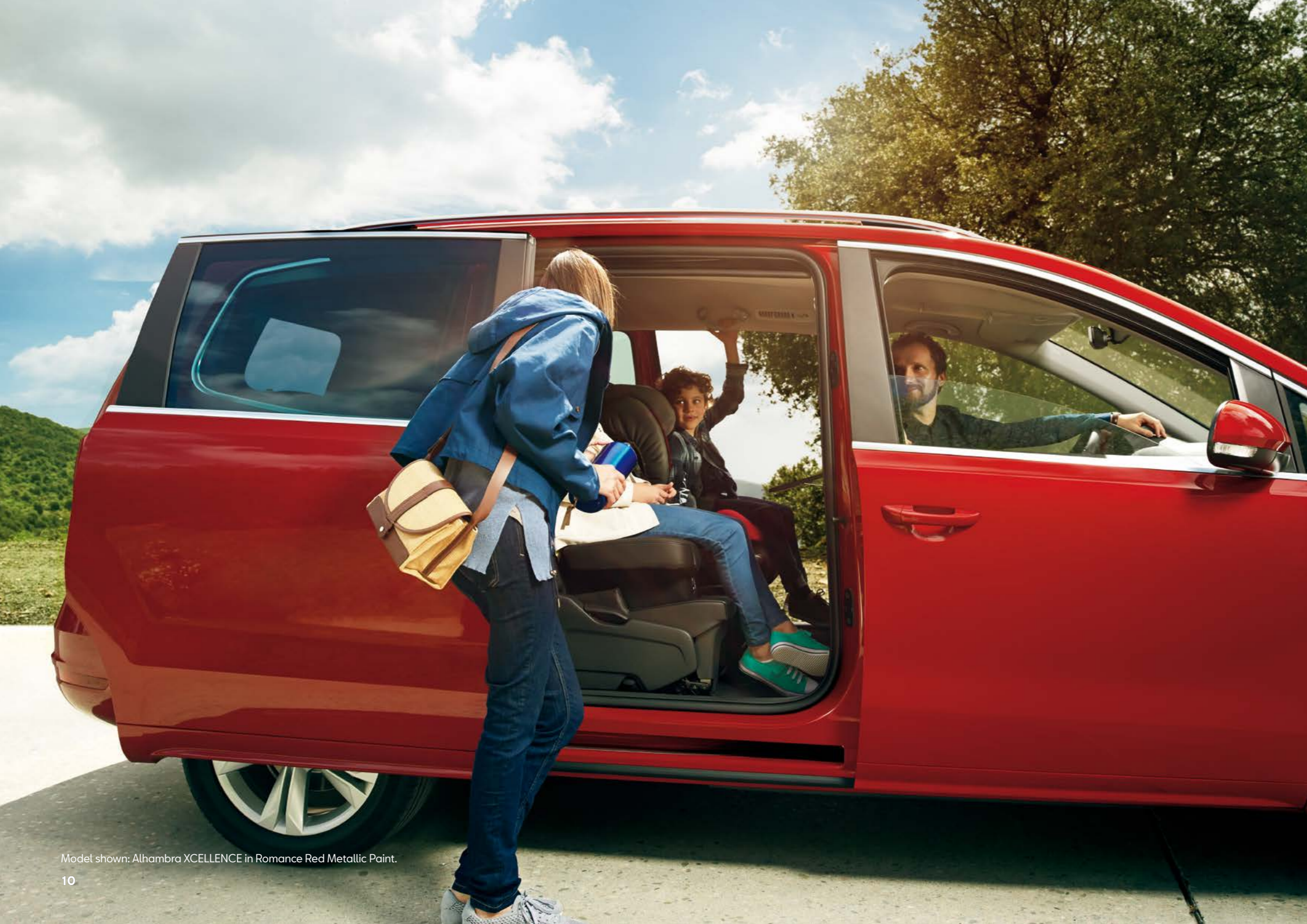
Model shown: Alhambra XCELLENCE in Romance Red Metallic Paint.