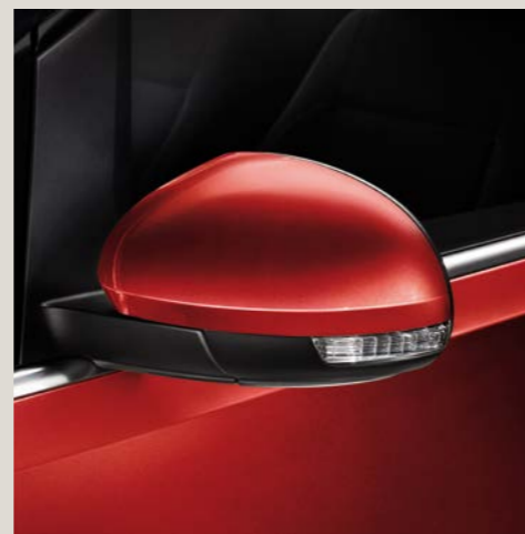
Romance Red 2 S SE SEL XC