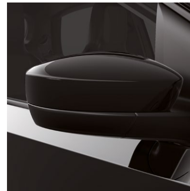
Deep Black 2