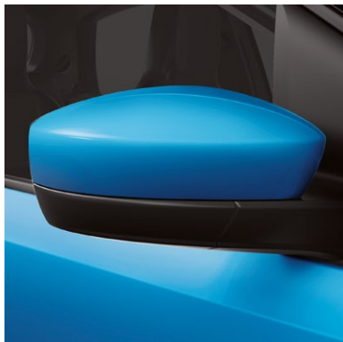
Chester Blue 2