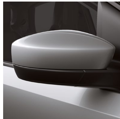
Tungsten Silver 2