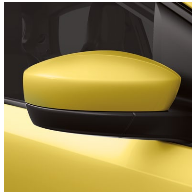
Sunflower Yellow 1*