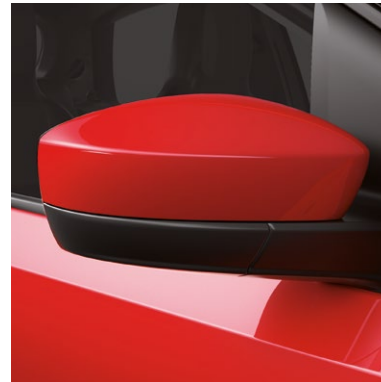
Tornado Red 1