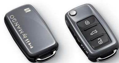
Mii by MANGO DECORATIVE KEY COVER.

There is no doubt that the SEAT Mii by MANGO brings together the best of two worlds and two brands. SEAT and MANGO. Innovative design and technology meet urban fashion.