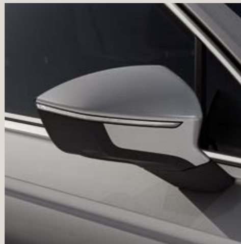
Reflex Silver** All models