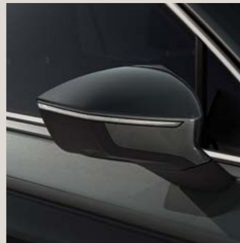
Dark Camouflage** All models