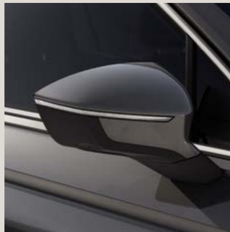
Urano Grey* All models