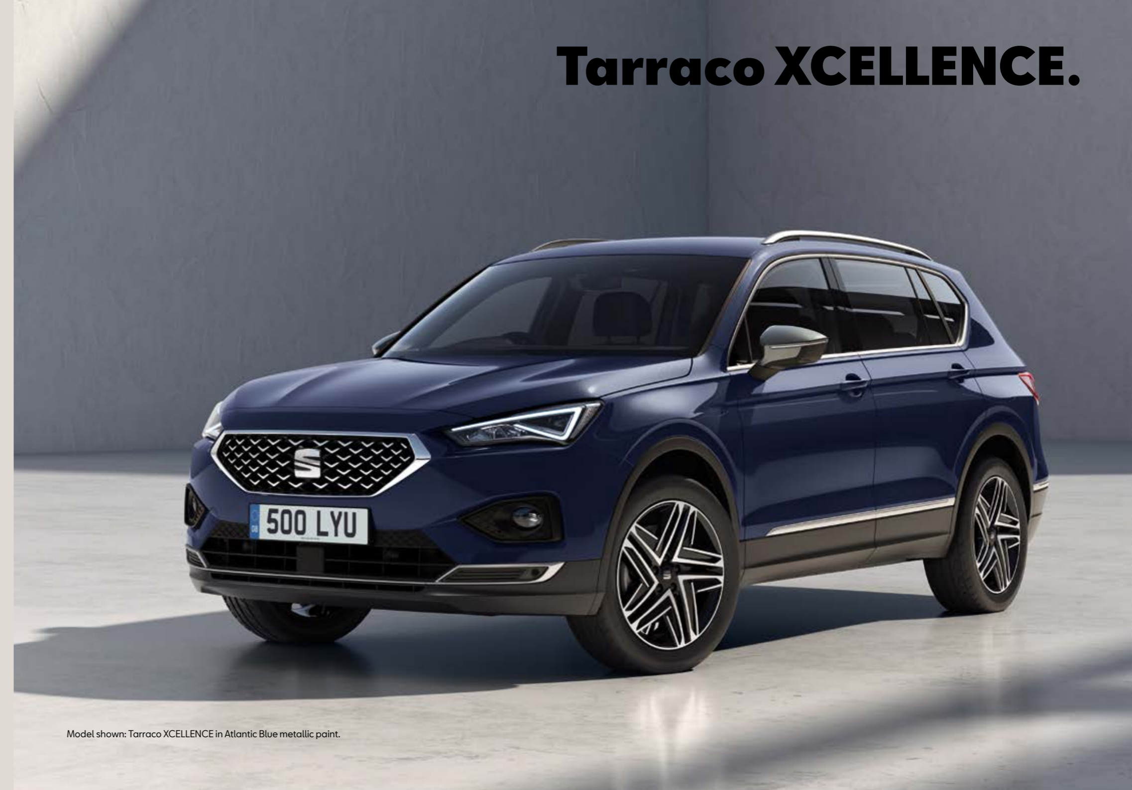
Model shown: Tarraco XCELLENCE in Atlantic Blue metallic paint.