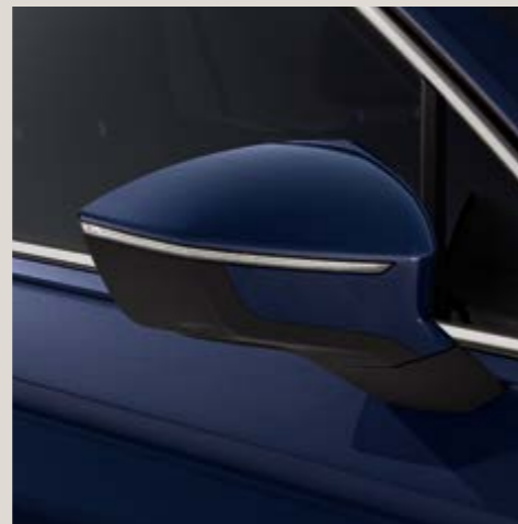
Atlantic Blue** All models