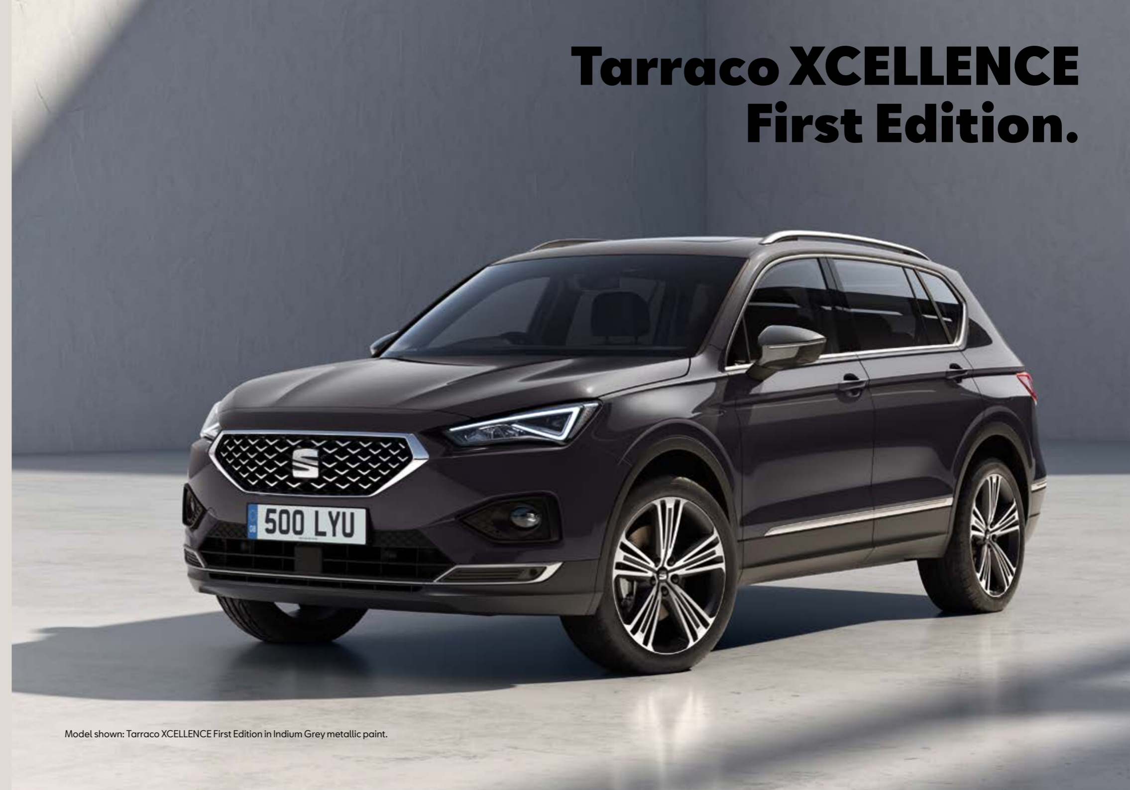
Model shown: Tarraco XCELLENCE First Edition in Indium Grey metallic paint.