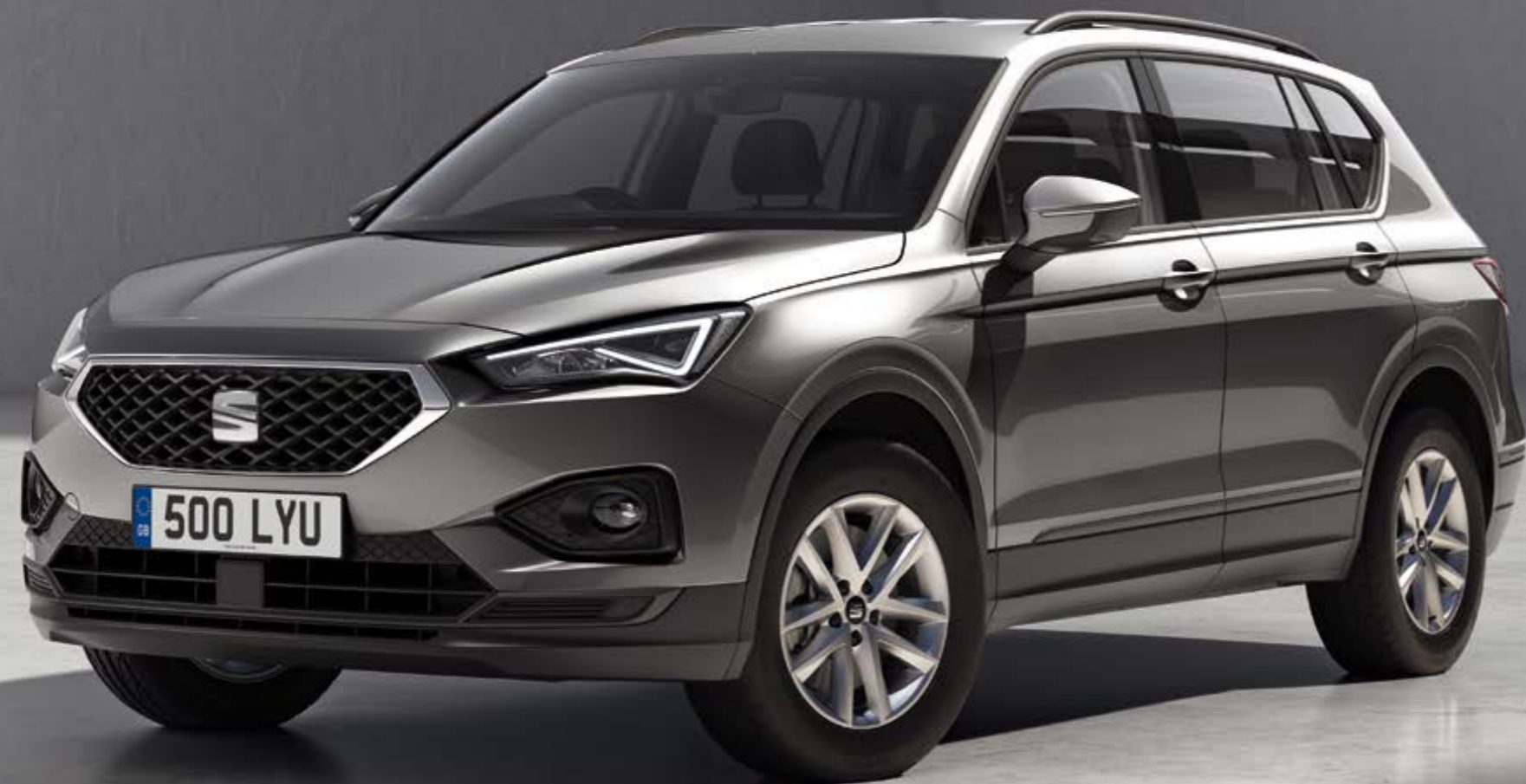
Model shown: Tarraco SE in Urano Grey paint.