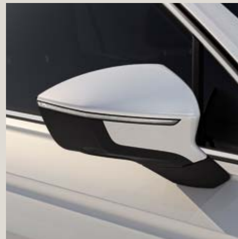
Oryx White** All models