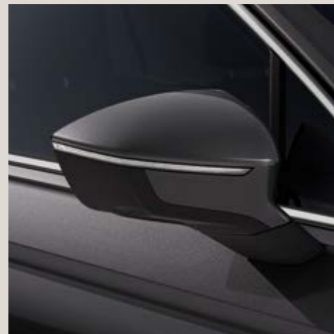
Indium Grey** All models