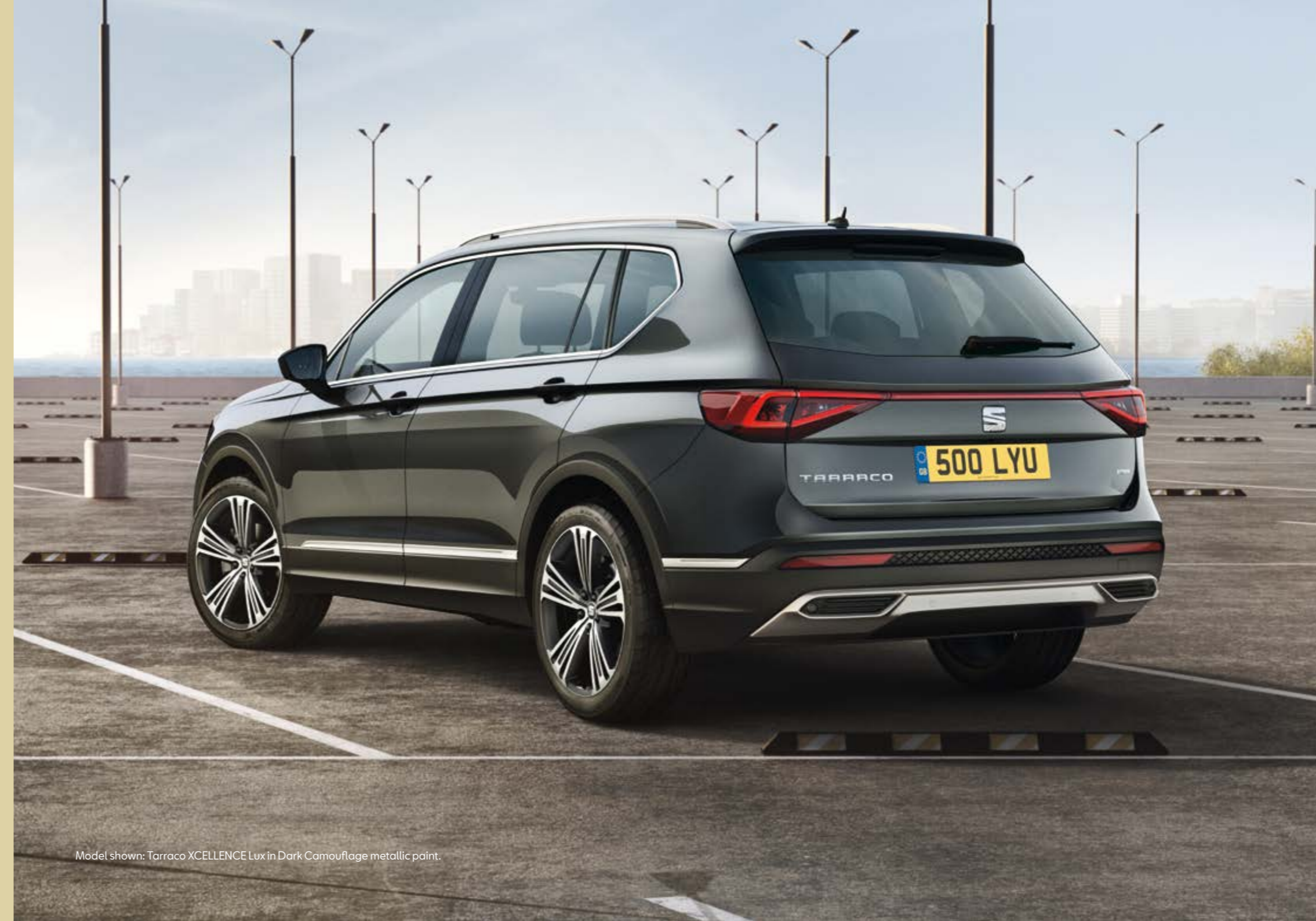
Model shown: Tarraco XCELLENCE Lux in Dark Camouflage metallic paint.

It's never too late to start something extraordinary. The new SEAT Tarraco is the large SUV that gives you the space to move, grow and expand. Because life isn't for standing still. Or settling for second best.