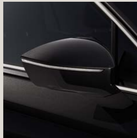
Deep Black** All models