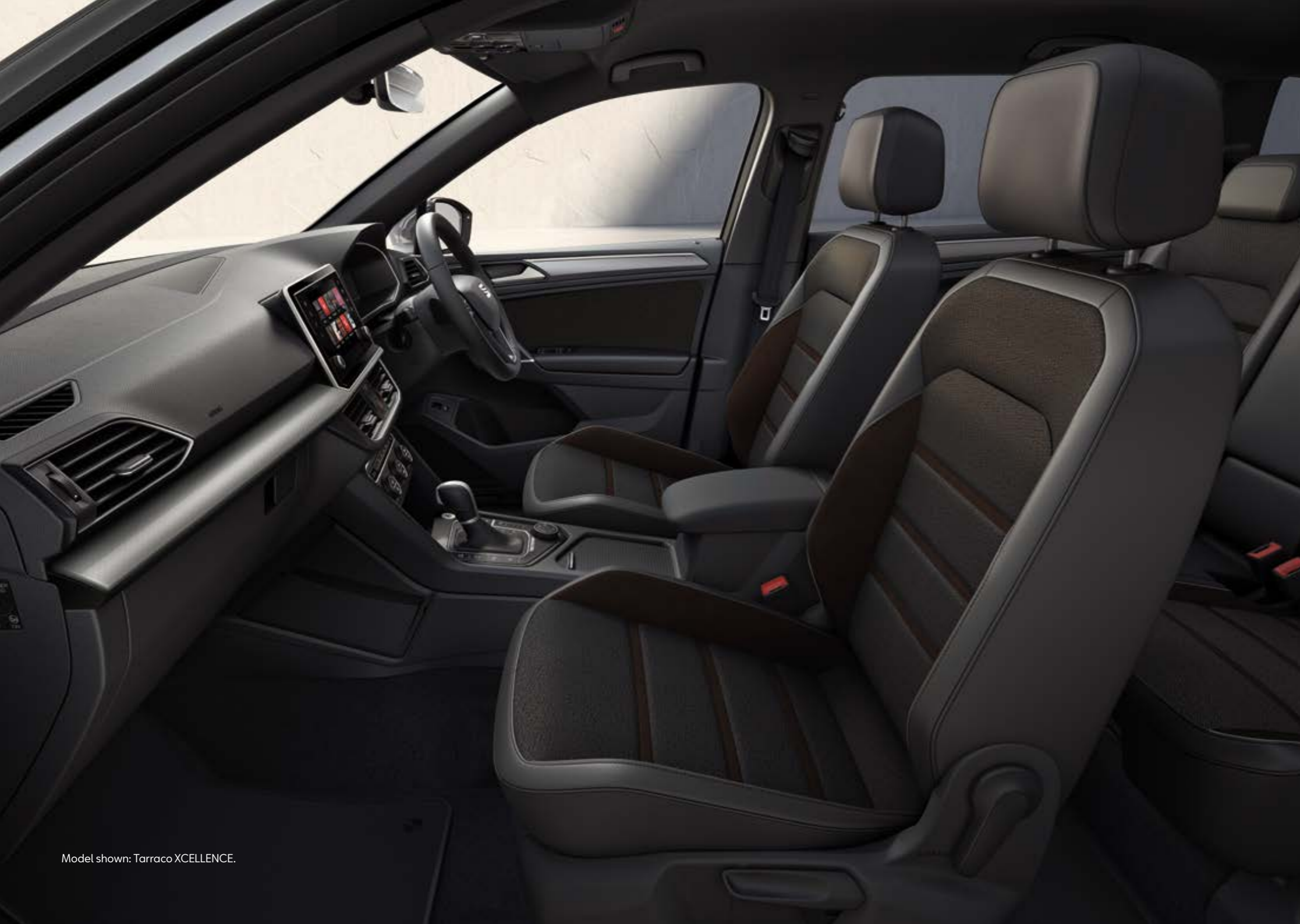
Model shown: Tarraco XCELLENCE.