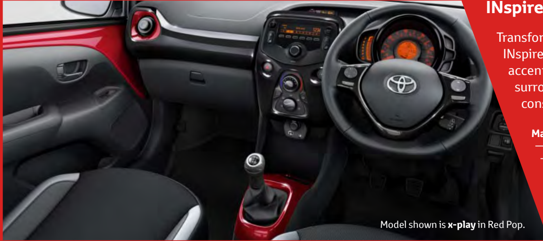
Model shown is x-play in Red Pop.