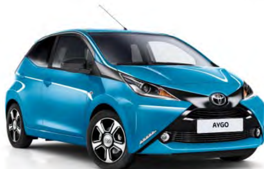
8W9 Cyan Splash* (only available on x-clusiv)