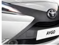
Black carbon front-x