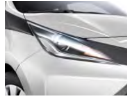
Projector headlights with LED tracer lights