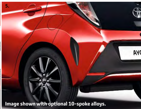
Image shown with optional 10-spoke alloys.