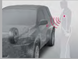
Smart Entry and Push-Button Start