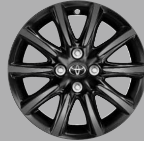
15" Gloss Black alloy wheels (10-spoke) Standard on x-press and x-style §