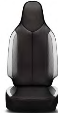
Glam dark grey fabric with light grey and white bolsters Standard on x-play , x-press and x-style