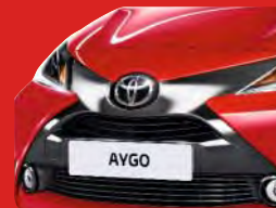
Contrasting front x, x-tension and rear difusser