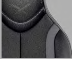
Vogue black and anthracite leather*