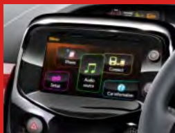
x-touch multimedia system