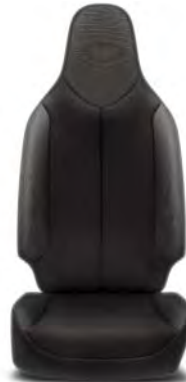
Mod dark grey fabric Standard on x