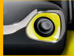
Yellow Fizz air vent surrounds create an interior highlight