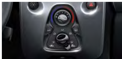
Air conditioning keeps you cool