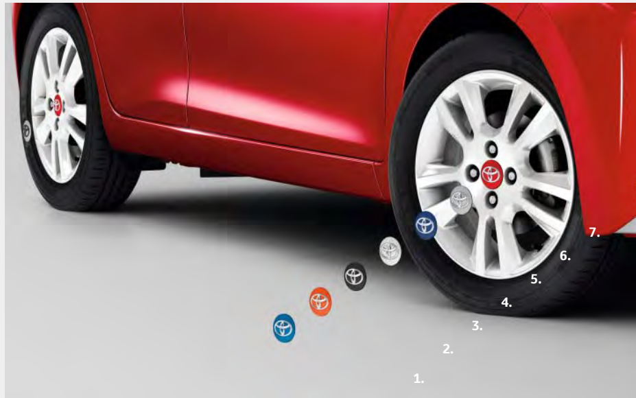
Small centre cap