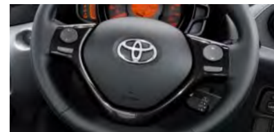
Steering wheel controls for both audio and telephone