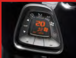
Automatic air conditioning