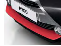
Colour accents to front, rear, side and roof