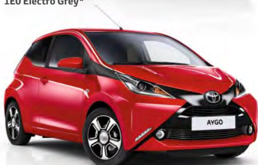
3P0 Red Pop