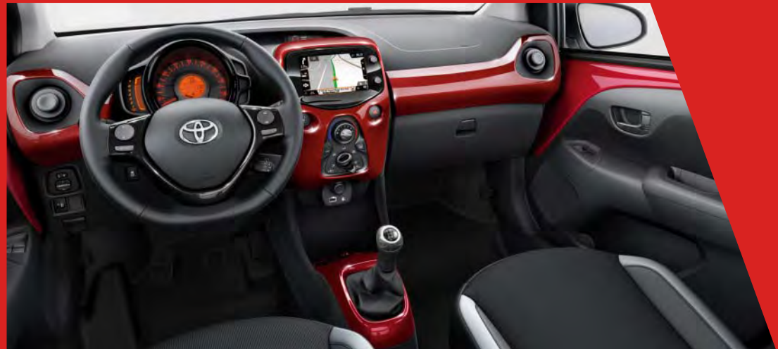
Image shown is not to UK specification and is used for illustrative purposes only. Model shown is x-play in Red Pop with optional x-touch multimedia system and optional x-nav system.