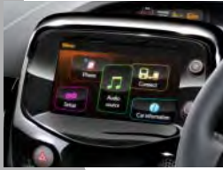
x-touch multimedia system