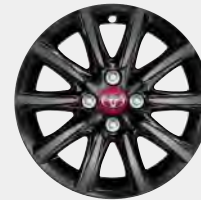
Gloss Black or Matt Black (Gloss Black shown) §