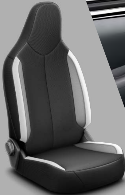
Gleam dark grey fabric sets with light grey and white bolsters