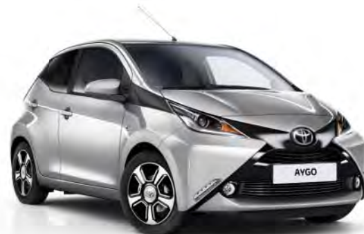
1E7 Silver Splash*