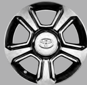
15" black machined-face alloy wheels (5-spoke) Standard on x-clusiv