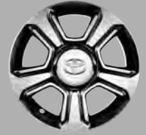
15" machined-face alloy wheels with silver centre cap