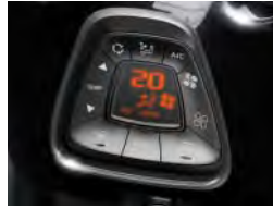
Automatic air conditioning