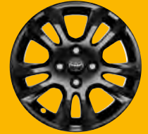
15" black alloy wheels with black centre caps