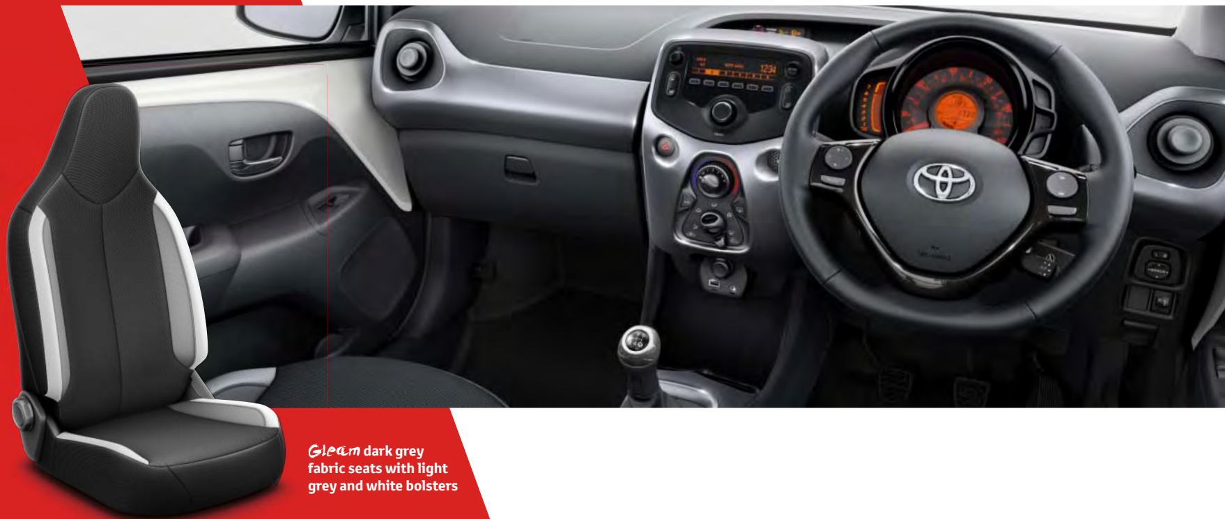
Glam dark grey fabric seats with light grey and white bolsters