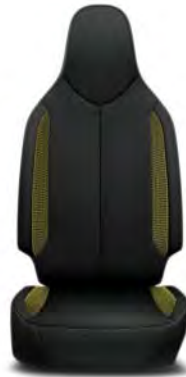
Beam black fabric with yellow inner bolsters and stitching Standard on x-cite