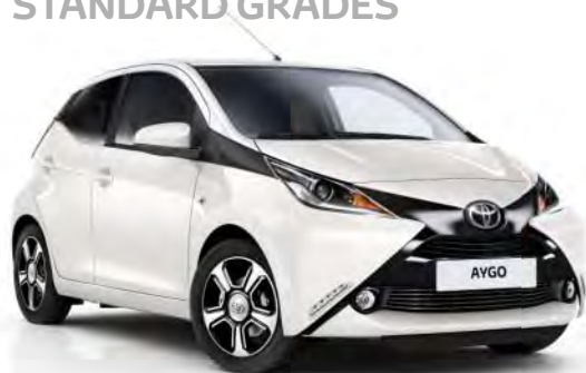
068 White Flash*