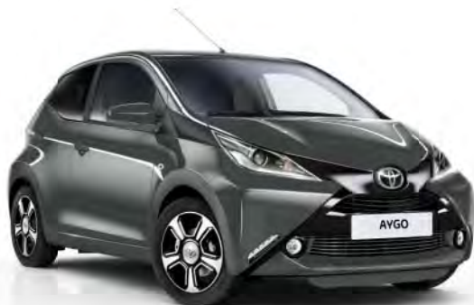
1E0 Electro Grey*