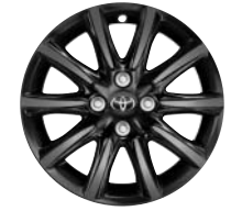
15" Gloss Black alloy wheels (10-spoke)*