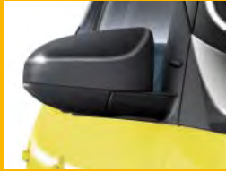
Exterior mirrors in black finish