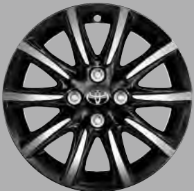
15" machined-face alloy wheels (10-spoke) Standard on x-press and x-style §