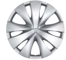
14" steel wheels