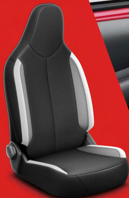
Glam dark grey fabric sets with light grey and white bolsters