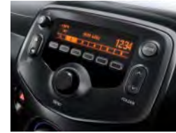
Audio system with USB and aux-in connections