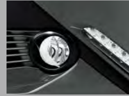
Front fog lamps for improved visibility