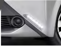
LED daytime running lights add style