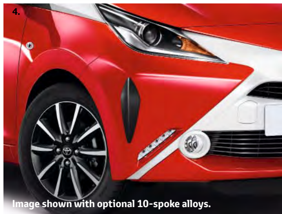
Image shown with optional 10-spoke alloys.