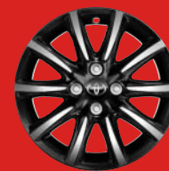
15" black machined-face alloy wheels (10-spoke)*