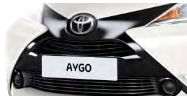
Premium Gloss Black front-x