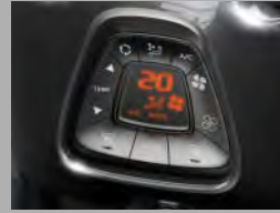
Automatic air conditioning