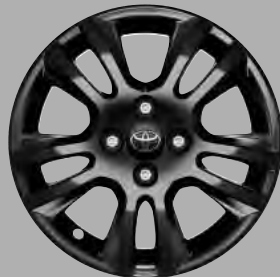
15" Gloss Black alloy wheels (5-double-spoke) Standard on x-cite