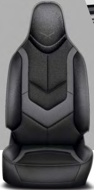
Vogue black and anthracite leather*