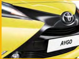
Gloss Black front-x contrasts with Yellow Fizz exterior