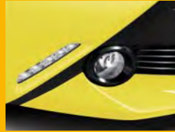
Front fog lamps for extra visibility