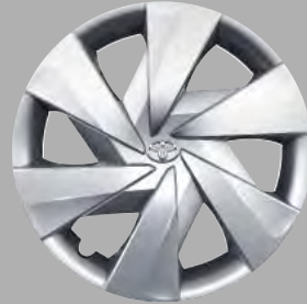
15" steel wheels with wheel caps (6-spoke) Standard on x-play