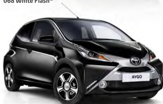
211 Bold Black* (not available on x)