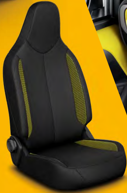
Beam black seats with yellow inner bolsters and stitching