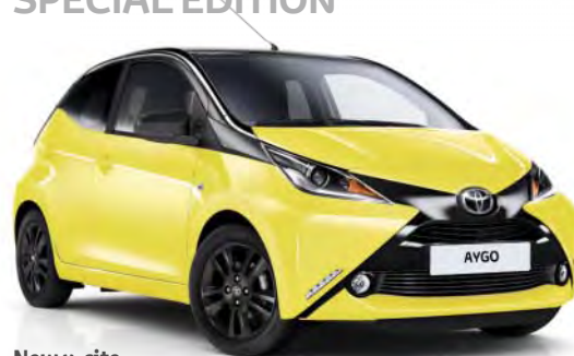
New x-cite Available in 5B9 Yellow Fizz 9