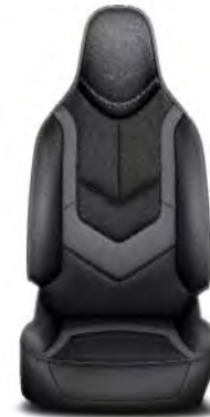
Vogue black and anthracite leather* Standard on x-clusiv