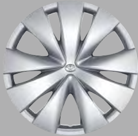
14" steel wheels with wheel caps (9-spoke) Standard on x