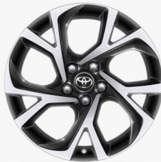
18" black machined-face alloy wheels (5-double-spoke)