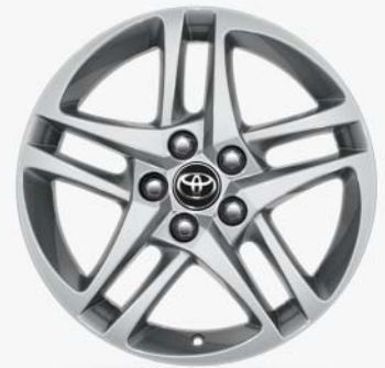
17" silver alloy wheels (5-double-spoke)