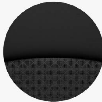
Black perforated leather with diamond pattern

COMPROMISE IS NOT YOUR STYLE NEXT LEVEL LUXURY THAT COMES AS STANDARD