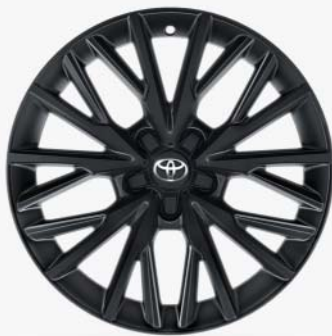
18" matt black alloy wheels (5-double-spoke)