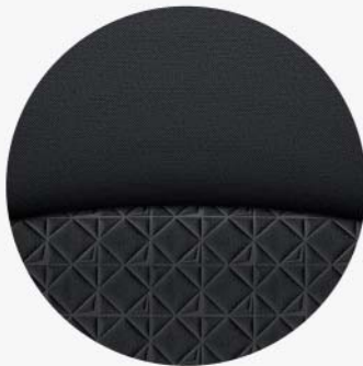
Black fabric with light blue stitching

MAKE A STATEMENT SET THE STANDARD WITH PLENTY OF EXTRA FEATURES