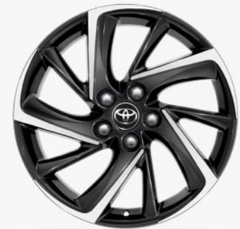
18" dark grey machined-face alloy wheels (10-spoke)