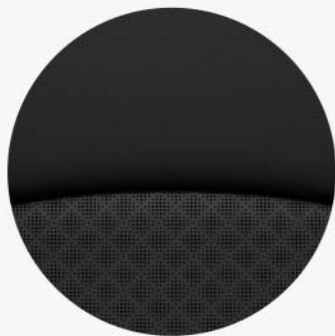
Black perforated leather with diamond pattern

BE THE DIFFERENCE SAY NO TO CONVENTION AND GIVE YOURSELF THAT URBAN EDGE