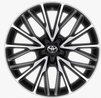
18" black machined-face alloy wheels (10-double-spoke)