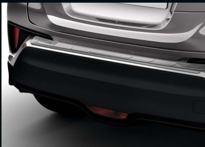
Rear bumper protection plate (chrome or black)