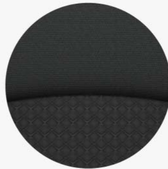
Black fabric with light grey stitching