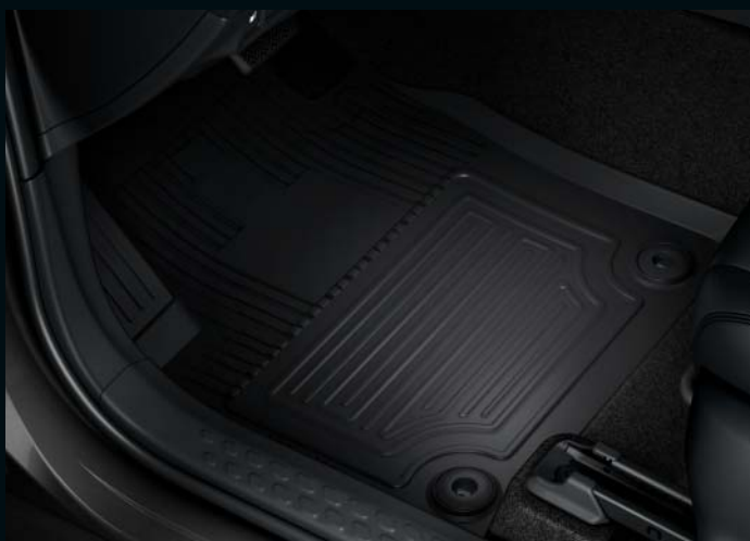
Rubber floor mats

Designed to protect your car's interior, rubber floor mats are lightweight, waterproof and incredibly hard-wearing.