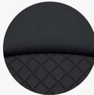
Black quilted fabric with blue stitching and blue bolsters

NEVER ORDINARY STAND-OUT LOOKS WITH CUTTING-EDGE TECHNOLOGY