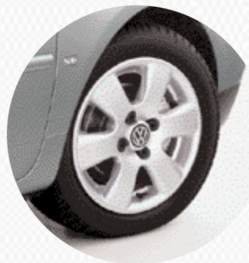
The Lupo SE is fitted with stylish 14" 'Suzuka' alloy wheels.

Whether parking in the city or heading for the countryside, you'll experience a drive like few other small cars. Nimble enough to steal the smallest parking spaces, yet big enough to revel