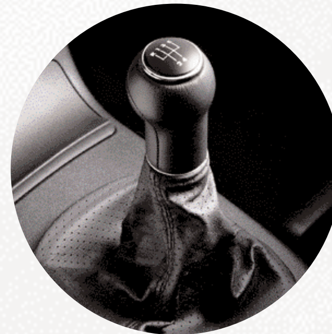
The sporty gear lever is trimmed with a perforated leather gaiter.

The list of standard features includes 14 inch 'Suzuka' alloy wheels with 185/55 R14 tyres, easy entry seats, split folding rear seats and height-adjustable front seats.