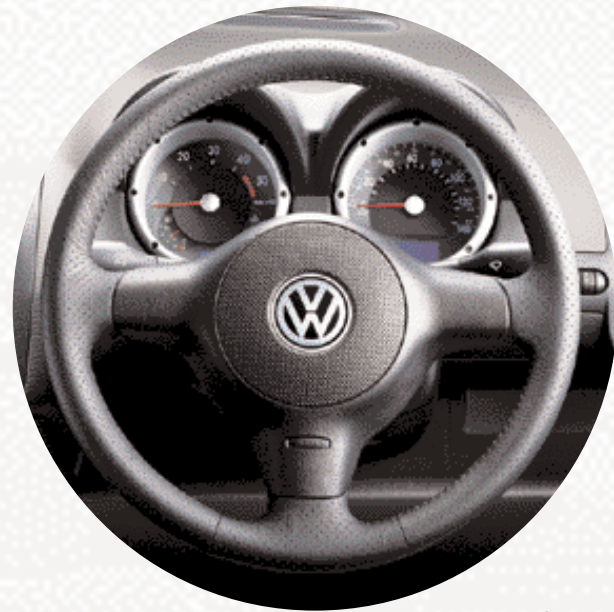
The finishing touch: perforated leather on the steering wheel, handbrake and gear lever gaiter.

on the open road. Comfort and lots of standard features will make you believe you're driving a much larger class of car. Inevitably, something will make you realise this isn't the case – petrol stations! As you pass one after the other, mile after mile, suddenly the economical Lupo brings an added smile to your face as you realise small really is beautiful.