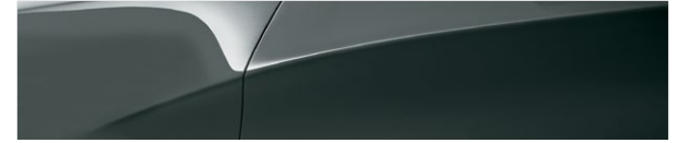
A52 Space Gray Metallic