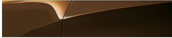
C29 Chestnut Bronze Metallic