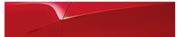
C06 Flamenco Red Metallic