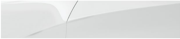
A14 Mineral Silver Metallic