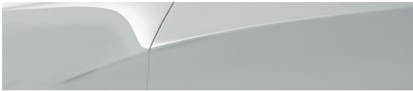
A83 Glacier Silver Metallic