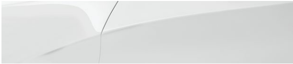
A96 Mineral White Metallic