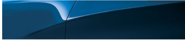
C10 Mediterranean Blue Metallic