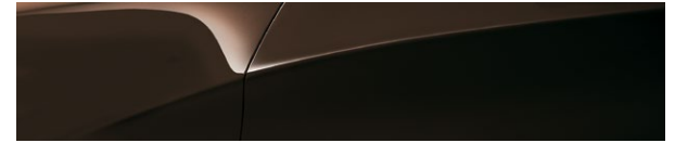
B53 Sparkling Brown Metallic