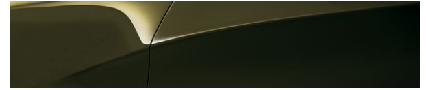
C07 Dark Olive Metallic