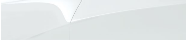
300 Alpine White (Non-Metallic)