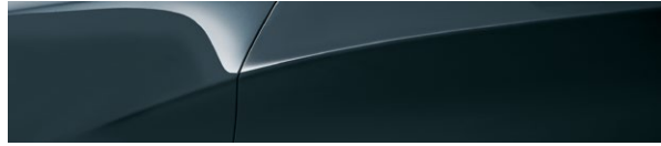
B39 Mineral Gray Metallic