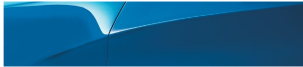
B45 Estoril Blue Metallic