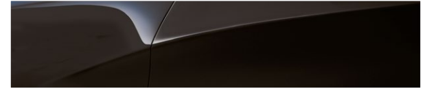
A90 Dark Graphite Metallic