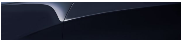
416 Carbon Black Metallic