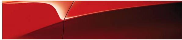
A75 Melbourne Red Metallic