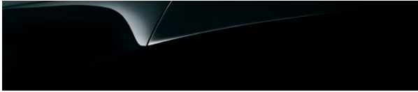
668 Jet Black (Non-Metallic)