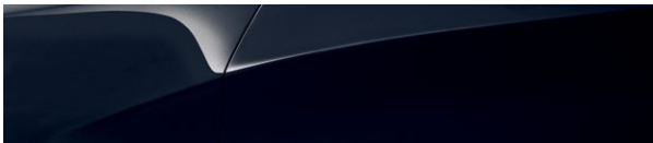
475 Black Sapphire Metallic