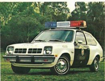
High Energy Ignition system on all models, standard.