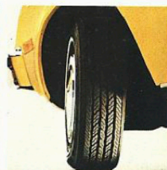
Radial Ply Tires. GM Specification steel-belted. Blackwall, white stripe or white lettered.