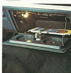
Auxiliary Lighting. Includes glove compartment and courtesy lights, "headlights on" reminder buzzer, and more.