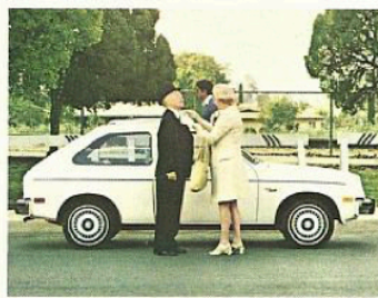
White-stripe tires, bright wheel trim rings, standard.† †Except Scooter.