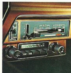
Four-Season Air Conditioning. For year-round interior comfort.