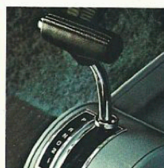
Automatic Transmission. Three speed ranges. May be shifted manually.