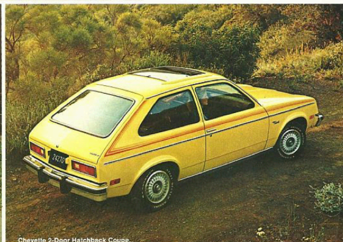
Chevette 2-Door Hatchback Coupe.