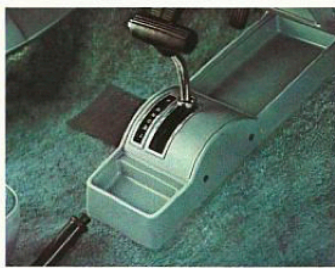
Center console with handy coin pocket, standard.† †Except Scooter.