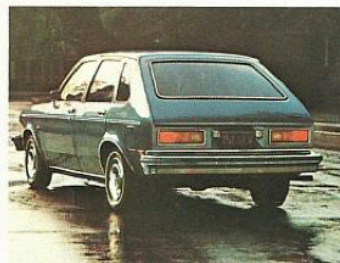
Front disc brakes with audible wear sensors, standard.