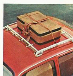
Luggage Carrier. Added styling plus a practical way to handle extra luggage.