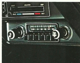
AM radio now standard.

When our Chevy Chevette first hit the roads two years ago, car buyers were quick to discover that it delivered a lot of car for the money. And for 1978, we've made a good thing even better—added as standard a whole list of equipment (some of which is shown above) that you might expect to pay extra for. Now it's all included in Chevette's basic low price. (For a complete listing of Chevette standard equipment, see page 9.)