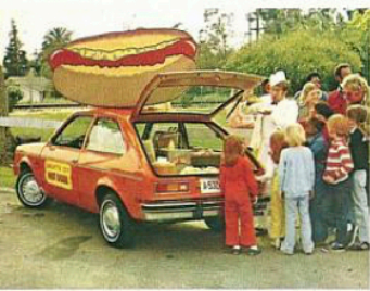
4-ft.-wide, easy-open rear hatch, standard.