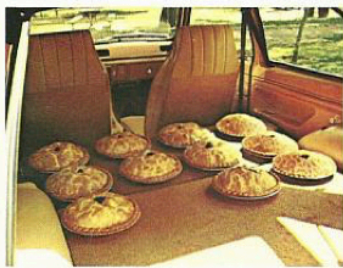
A rear seat back that folds flat, standard.