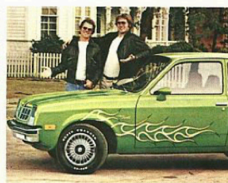
1.6 Litre (98 Cu. In.) L4 overhead-cam engine, standard.