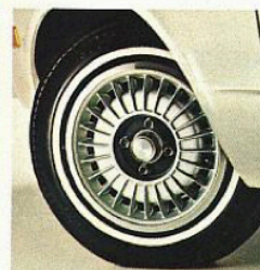
Sport Wheel Covers. Feature an attractive center hub and fin design.††