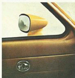
Sport Mirrors. For both doors. Available with remote control for both sides or left-side mirror only.††