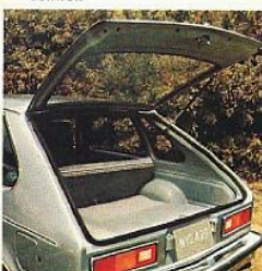
Carpeted Cargo Area. Color-keyed rear seat-back and removable load floor carpeting.††