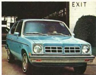
Diagnostic connector to help simplify servicing, standard.