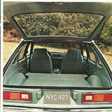
Chevette 4-Door Hatchback Sedan load area.