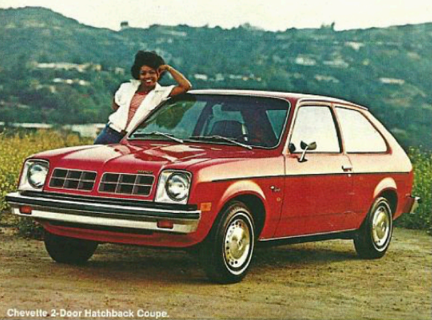
Chevette 2-Door Hatchback Coupe.

Our lowest priced Chevette. You can save even more by deleting the fold-down rear seat. The 1.6 Litre (98 Cu. In.) L4 OHC engine and 4-Speed manual transmission are standard. A wide range of options is also available. See your Chevrolet dealer for details.