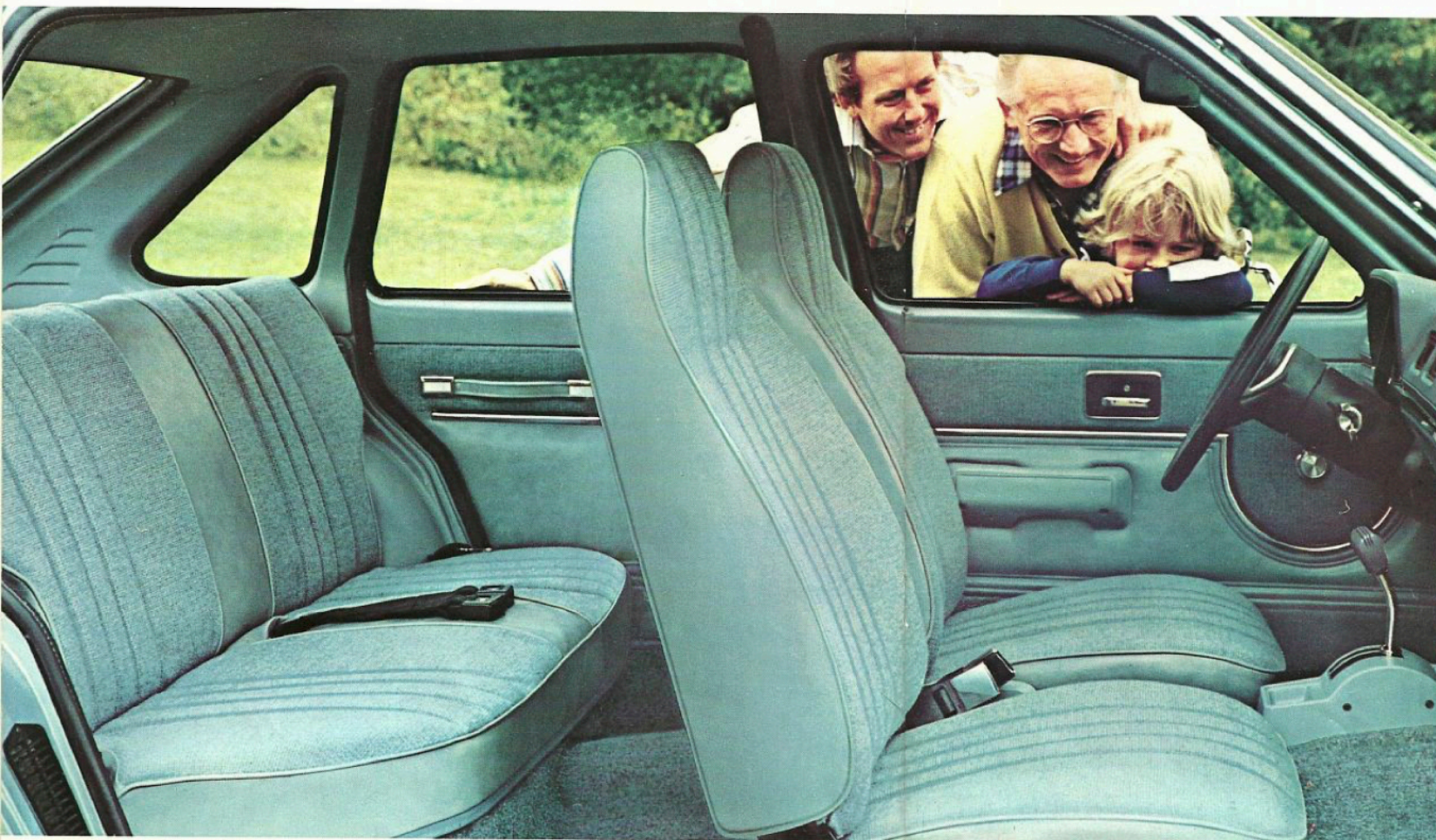
Chevette available Custom Interior with woven cloth-and-vinyl trim.

Large, hooded instruments in a color-keyed panel center; center console with handy coin pocket; console-mounted transmission controls and sport steering wheel (except Scooter). Column-mounted "Smart Switch" puts turn and lane-changing signals, windshield wiper and washer, headlight dimmer and flasher controls at your fingertips. Wide-view, vinyl-edged rearview mirror.