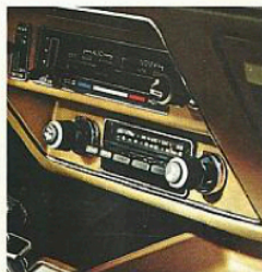
AM/FM Radio. Push-button tuning, twin speakers.