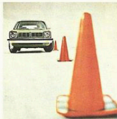
Rear Stabilizer. For added firmness and maneuvering feel many drivers prefer.††