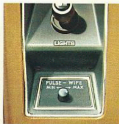
Intermittent Windshield Wiper System. Lets you adjust wipe cycle from ½ to as long as 20 seconds.