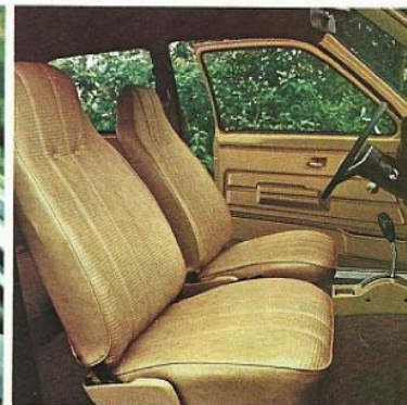
Chevette Standard Interior with all-vinyl trim.