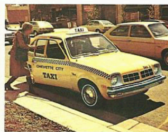
Chevy's best mileage rating, standard*.