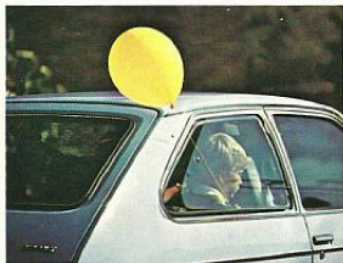
Swing-out rear window on Coupe, standard.† †Except Scooter.