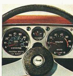
Special Instrumentation. Adds a tachometer and a voltmeter to instrument panel.††