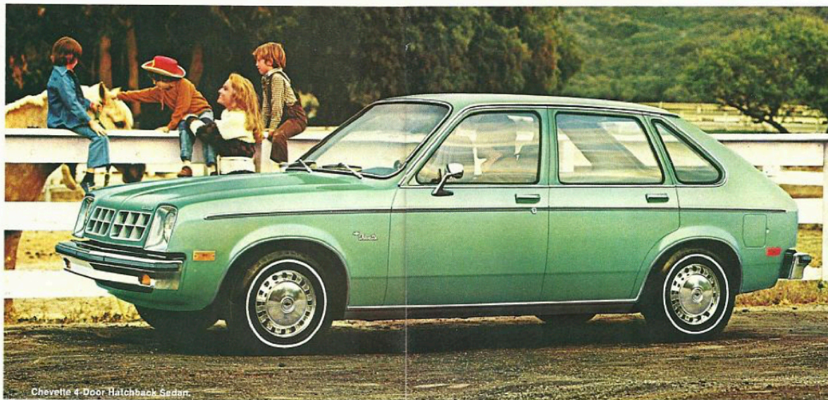
Chevette 4-Door Hatchback Sedan.

The 4-Door illustrated is equipped with the available Custom Exterior Package which adds: Wheel opening moldings and side window reveal moldings. But look what the standard 4-Door has to start with: Deluxe grille with bright trim, bumper rub strips and bright trim moldings, bright headlight bezels, even bright wheel trim rings and white stripe tires!