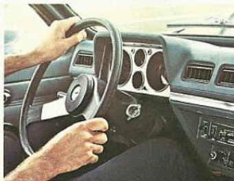
Sport steering wheel, Deluxe instrument panel, standard.† †Except Scooter.