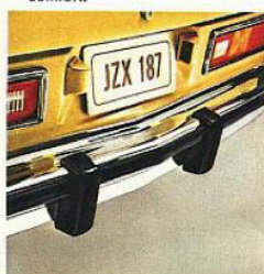
Bumper Guards. Provide extra parking protection front and rear.