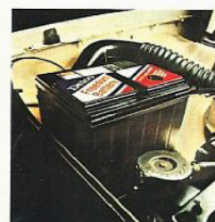
Heavy-Duty Battery. Delco Freedom. Never needs water or service.