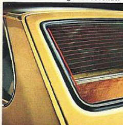
Electro-Clear Rear Window Defogger. Handy instrument panel control.