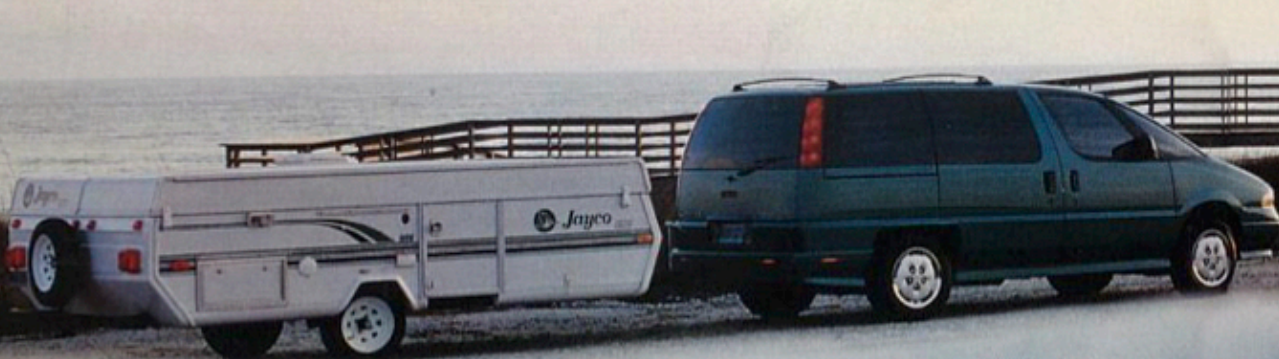
Lumina Minivan with optional LS luxury-level trim. Shown in Bright Aqua Metallic.

NOTE: The safety steps described here are by no means the only precautions to be taken when trailering. See the Owner's Manual for the Chevy vehicle of your choice for additional guidelines and trailering tips.