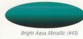
Bright Aqua Metallic (#43)