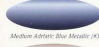
Medium Adriatic Blue Metallic (#30)