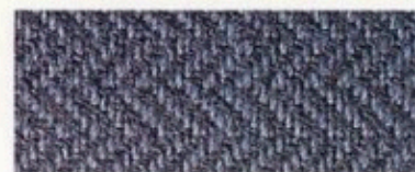
LS Custom Cloth