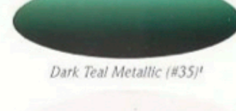
Dark Teal Metallic (#35) 1