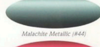
Malachite Metallic (#44)