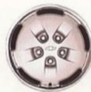
Custom 15" bolt-on wheel covers, included with LS trim