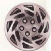
Optional 15" cast-aluminum wheels with locks