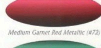
Medium Garnet Red Metallic (#72)