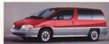
Custom Two-Tone (RPO D84)

NOTE: Secondary color is always Light Gray Metallic with Gray Accents.