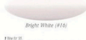
Bright White (#16)