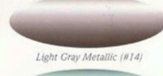
Light Gray Metallic (#14)