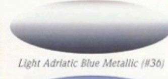
Light Adriatic Blue Metallic (#36)