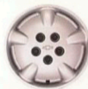
Standard 15" bolt-on full wheel covers