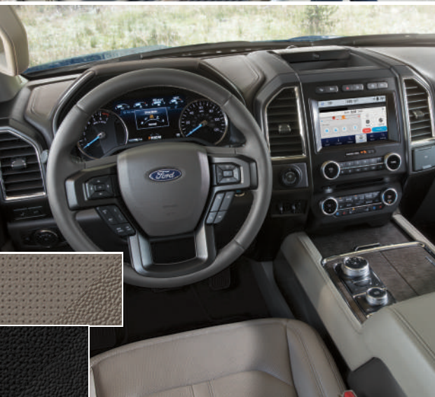
LEATHER-TRIMMED SEATING SURFACES: Medium Stone, Ebony