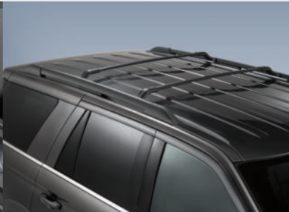
Roof crossbars 2