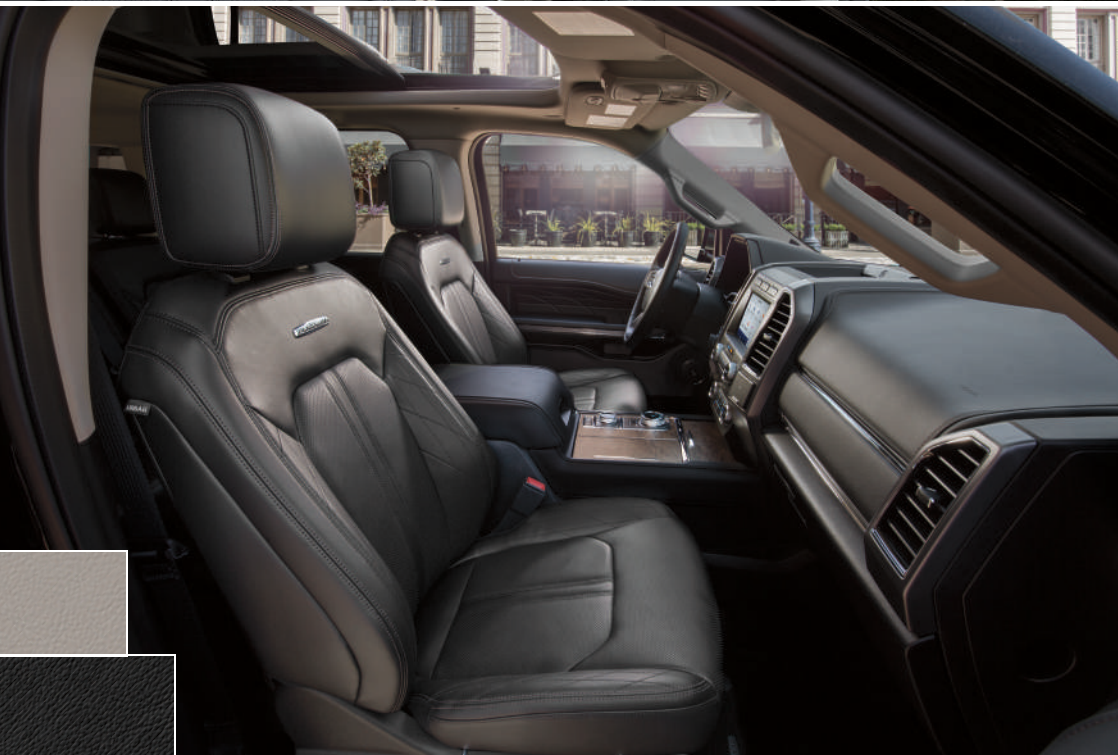
LEATHER-TRIMMED SEATING SURFACES: Medium Soft Ceramic, Ebony

ENHANCED 3.5L ECOBOOST V6 WITH AUTO START-STOP TECHNOLOGY 10-SPEED AUTOMATIC TRANSMISSION