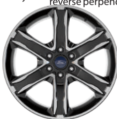
22" PREMIUM BLACK-PAINTED ALUMINUM Included with Stealth Edition (303A), Special Edition and Texas Edition Packages