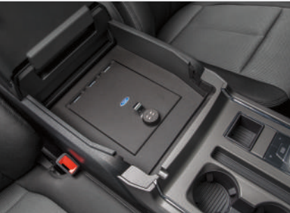
In-vehicle safe 1

Expedition MAX Platinum in Rapid Red Metallic Tinted Clearcoat accessorized with hood deflector, side window deflectors, 1 splash guards, 1 roof crossbars, and