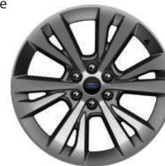
22" 6-SPOKE PAINTED MACHINED-FACE ALUMINUM WITH DARK TARNISH- PAINTED POCKETS Standard

Heavy-Duty Trailer Tow Package: heavy-duty radiator, Pro Trailer Backup Assist™ 3.73 electronic limited-slip rear differential (eLSD), integrated trailer brake controller, and 2-speed automatic 4WD (4x4 only) with Neutral towing capability 2nd-row power-folding tip-and-slide captain's chairs 4-wheel drive (4WD) (includes 1-speed transfer case, Terrain Management System™, Hill Descent Control and front tow hooks) Dual-Headrest Rear Seat Entertainment System 4 Engine block heater Floor liners for 1st and 2nd rows Reversible