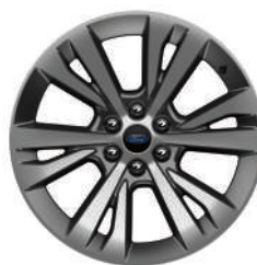
22" 6-SPOKE PAINTED MACHINED-FACE ALUMINUM WITH DARK TARNISH-PAINTED POCKETS Included with 302A