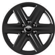
20" 6-SPOKE GLOSS BLACK-PAINTED ALUMINUM Optional 3 Not available with 302A, or Stealth Edition (303A), FX4 Off-Road, Special Edition or Texas Edition Packages