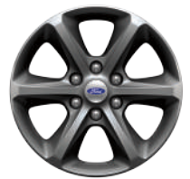
18" MAGNETIC-PAINTED CAST-ALUMINUM

Always consult the owner's manual before off-road driving. Follow all laws and drive on designated off-road trails and recreation areas.