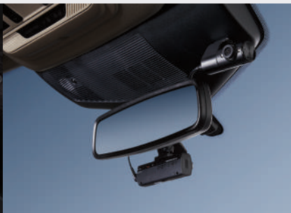
Dash cam systems 1

SHOP THE COMPLETE COLLECTION | accessories.ford.com