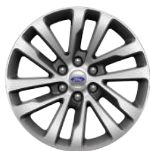
20" PREMIUM DARK TARNISH-PAINTED ALUMINUM Standard

Voice-Activated Touchscreen Navigation System with pinch-to-zoom capability (includes SiriusXM Traffic