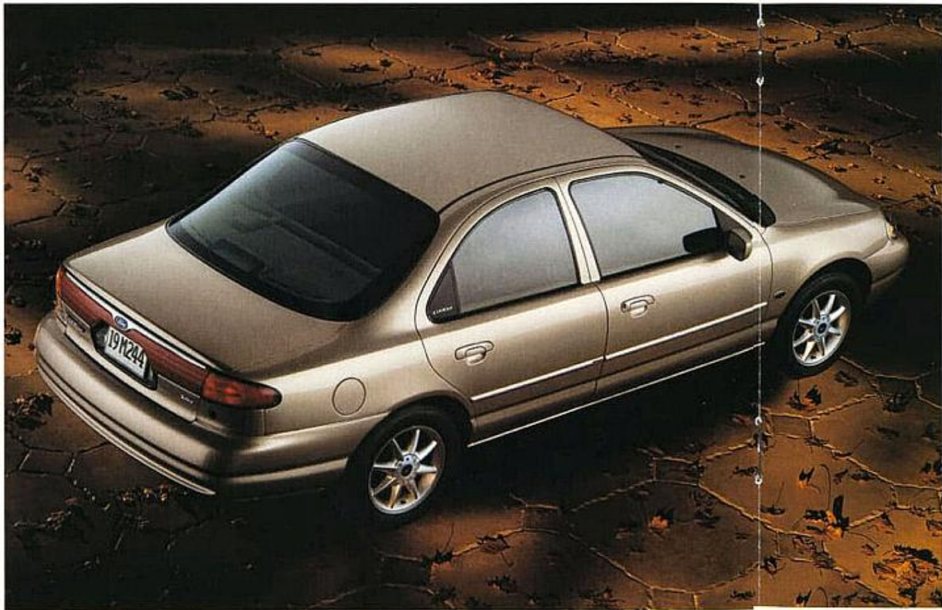
Contour LX with the optional Sport Package in Light Prairie Tan Clearcoat Metallic.

There's also an exciting Sport Package available with GL and LX that includes such items as fog lamps, a tachometer and special sport badging.