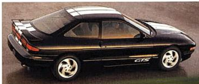
Probe GTS in Black Clearcoat.