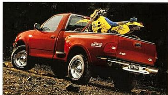
F-Series F-150 Flareside 4x4 in Dark Toreador Red Clearcoat Metallic.