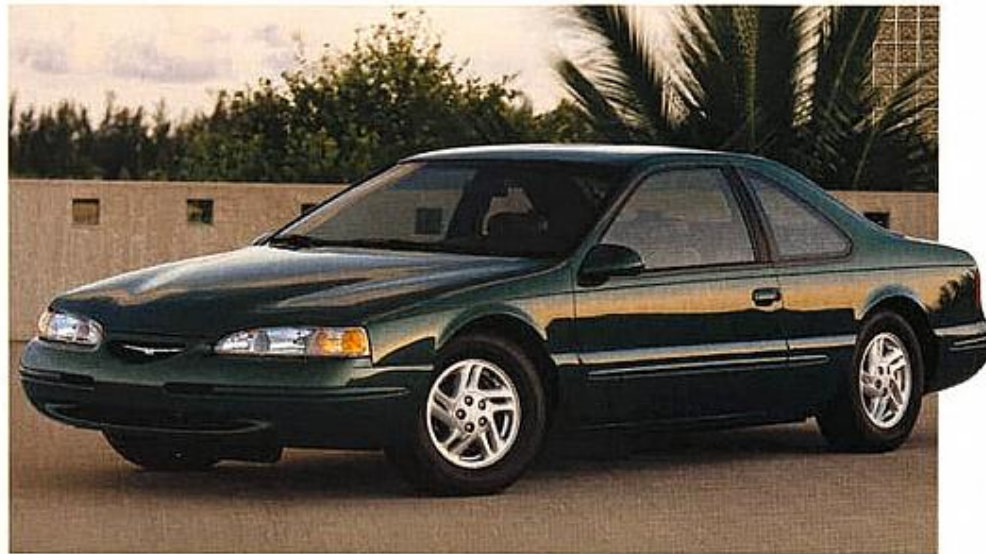
Thunderbird LX in Pacific Green Clearcoat Metallic.

How many cars on the road today can you identify at a glance, whose badges elicit instant recognition and admiration? There certainly aren't many, but one should readily come to mind. It's the familiar angular aviator with the wide wingspan – the legendary Thunderbird. It's gone through many changes in its 42-year history, and yet its identity as a distinctive personal sports coupe is as evident today as it was when it came on the scene for the first time.