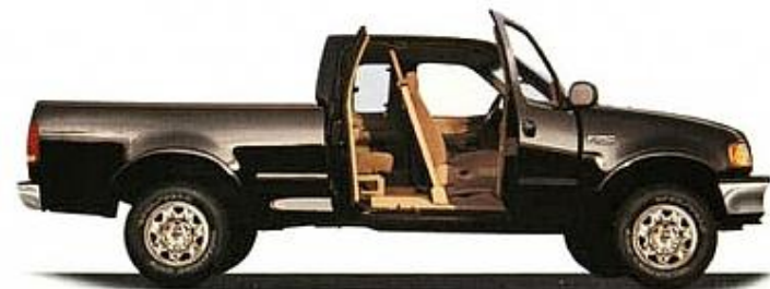
The F-Series F-250 SuperCab with standard third door in Black Clearcoat.

You may have experienced the inconvenience of trying to get out of the back seat of a pickup, especially when there is a passenger in the front seat. Not any longer. Ford, and only Ford, offers the convenience of a standard third door on the F-Series SuperCab.