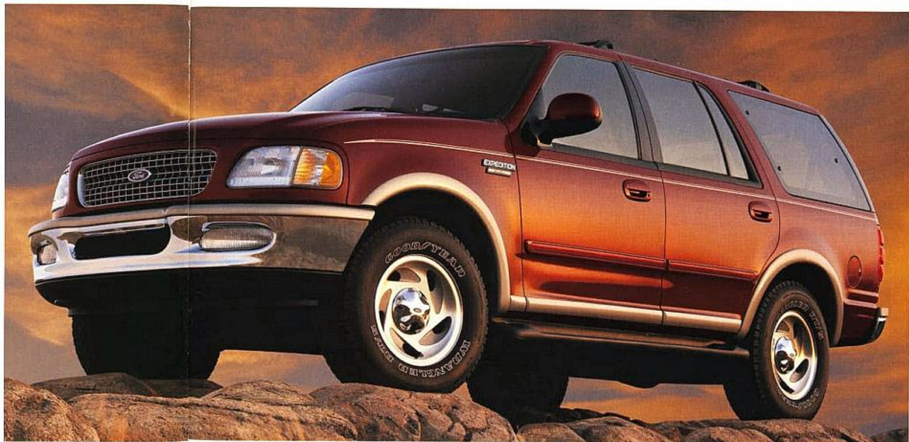
Expedition Eddie Bauer edition 4x4 in Dark Toreador Red Clearcoat Metallic.