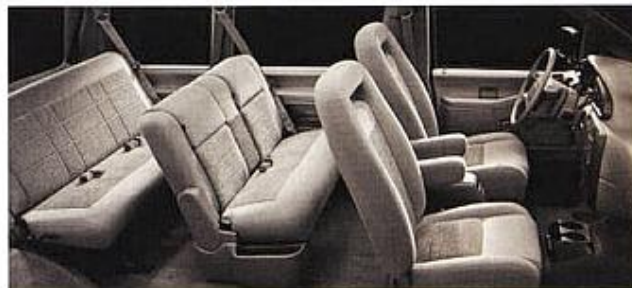
Aerostar's standard 7-passenger seating in Medium Grey cloth.