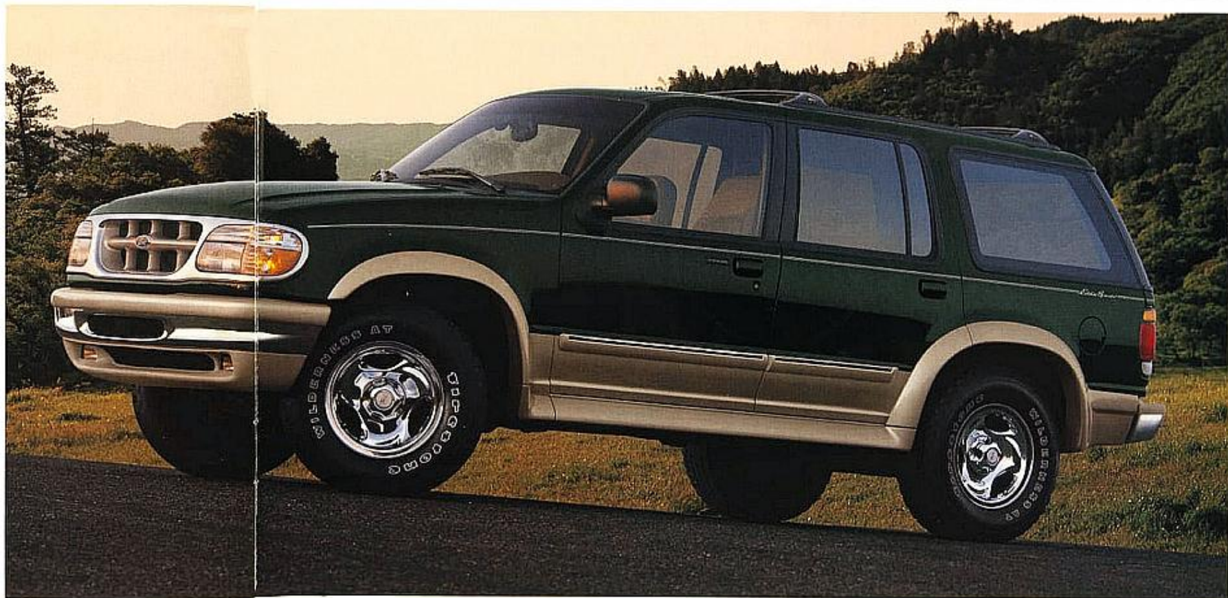
Explorer Eddie Bauer edition in Deep Emerald Green Metallic over Light Prairie Tan Clearcoat Metallic.