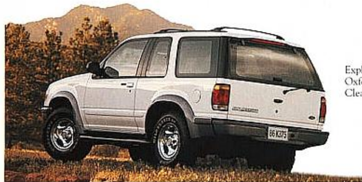
Explorer Sport in Oxford White Clearcoat.