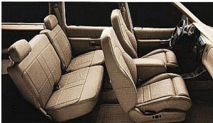
The Eddie Bauer edition combines elegant comfort and spirited style. Shown here with optional leather seating surfaces in Medium Prairie Tan.

Explorer has been America's best-selling compact sport utility for five years running. Since its introduction, no other vehicle in its class has matched its combination of style, comfort and convenience. Choose 2-Door XL or Sport, 4-Door XL, XLT, Eddie Bauer or Limited.