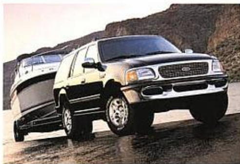
Expedition XLT 4x2 in Black Clearcoat.