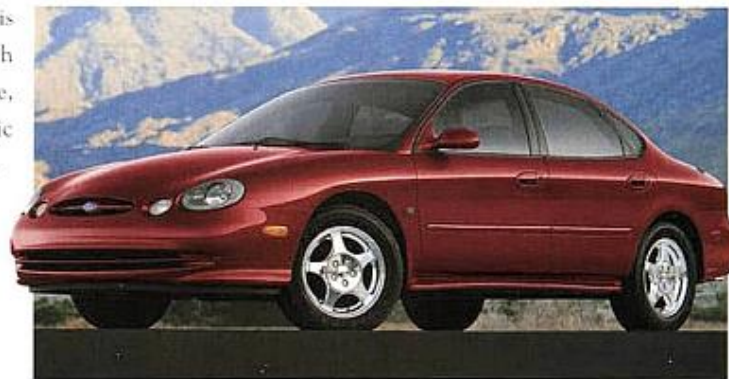
Taurus SHO in Toreador Red Clearcoat Metallic.

The heart of Taurus SHO is sophisticated performance with its 235-hp V8 engine, responsive 4-speed automatic overdrive transaxle, ride-adaptive suspension and 4-wheel-disc, anti-lock braking system.