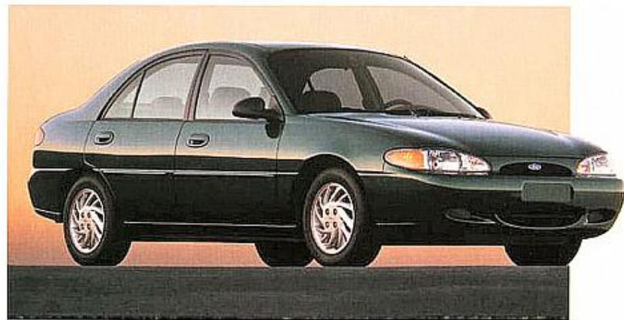
Escort LX in Pacific Green Clearcoat Metallic.

Escort Wagon provides 63.4 cu. ft. of cargo area with the rear seat backs down. The split-fold feature lets you fold both backs down when cargo takes priority, or just one for cargo and passengers. It's shown here in Toreador Red Clearcoat Metallic.