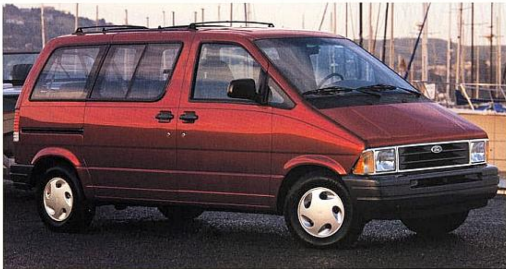
Aerostar Wagon in Toreador Red Clearcoat Metallic.

* Up to 4,400 lbs. with a properly equipped 2-wheel-drive extended length model.