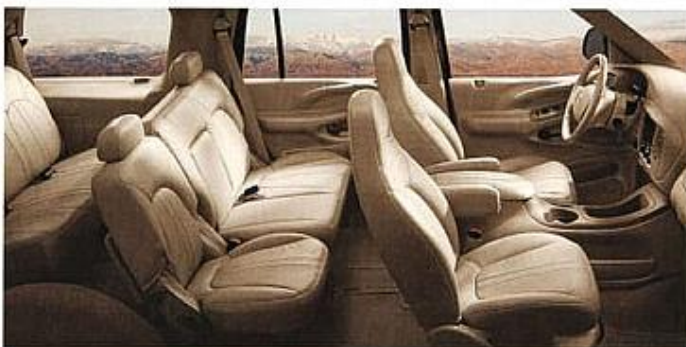
The Eddie Bauer edition interior with leather seating surfaces and optional 3rd-row bench seat in Medium Prairie Tan.