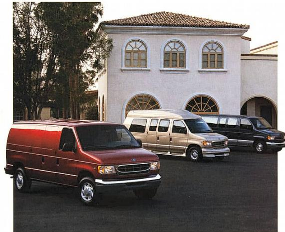
Left to right: Econoline XL in Toreador Red Clearcoat Metallic;

1997, Econoline has been re-engineered and refined to be even better. There's a new line of V6, and Triton™ V8 and V10 engines. New ergonomic instrumentation for greater convenience. More space. More safety features, too, such as dual front air bags standard or available in all models (always wear your safety belts and seat children in rear seat).