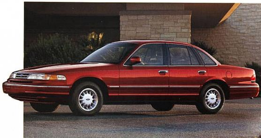
Crown Victoria LX in Toreador Red Clearcoat Metallic.

Few cars on the road today can match Crown Victoria's traditional advantages. There's not only ample space, but full 6-passenger accommodations with room to spare. Not only a pleasant ride, but one that can only be described as remarkably refined. Crown Victoria is powered by an advanced V8 with a scheduled tune-up interval of 100,000 miles (under normal driving conditions with routine fluid/filter changes).