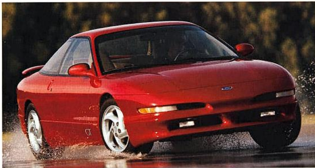
Probe GT in Laser Red Tinted Clearcoat Metallic.

The true embodiment of the Probe spirit is the dynamic GT with its sport suspension and power 4-wheel disc brakes. The 24-valve, 2.5-liter V6 engine with multi-port electronic fuel injection delivers 164 horsepower. There's also a new GTS Sport Appearance option to dress it up. Whether you choose GT or the standard Probe, you'll be getting a car that takes your driving enjoyment seriously.