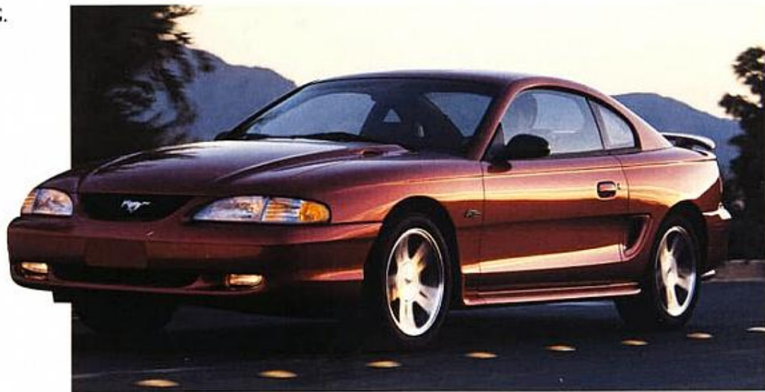
Mustang GT Coupe in Autumn Orange Clearcoat Metallic.

There's nothing on the road quite like the legendary style and performance of Ford Mustang, from the standard model, with its SEFI V6 performance, to Mustang GT, with its exhilarating 215-hp SOHC V8 and agile handling, to the carefree convertible. Experience what countless driving enthusiasts have been enjoying since 1964 – that irrepressible Mustang spirit!