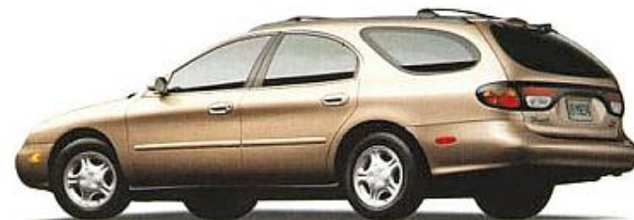
Taurus GL Wagon in Light Saddle Clearcoat Metallic.