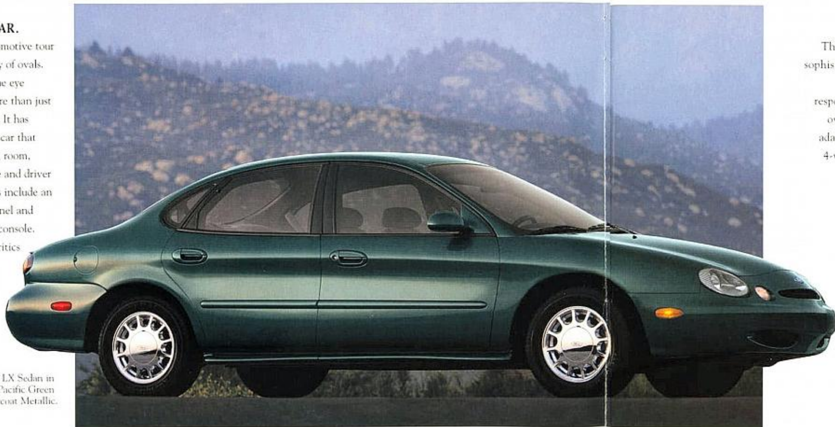
Taurus LX Sedan in Pacific Green Clearcoat Metallic.

The design is an automotive tour de force. A symphony of ovals. On the road, it's a true eye catcher. Taurus is more than just a pretty face, though. It has established itself as a car that solidly delivers safety, room, comfort, performance and driver reward. Industry firsts include an integrated control panel and 3-way flip-up center console. It's a car praised by critics and owners alike.