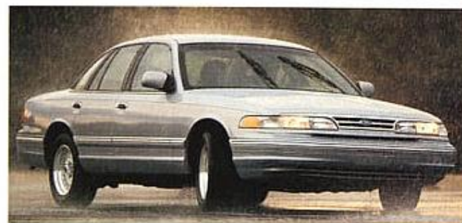
Crown Victoria LX in Silver Frost Clearcoat Metallic.