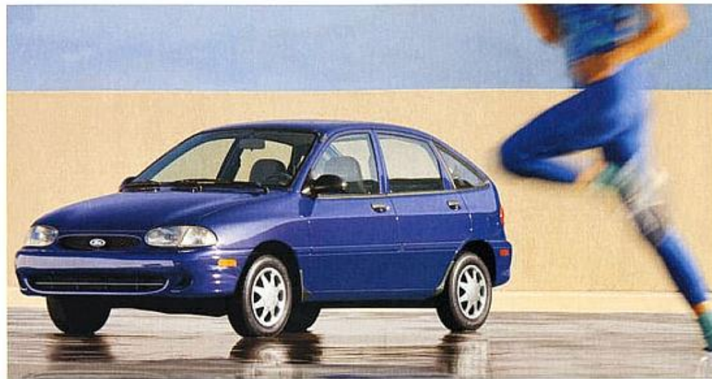
Aspire 5-Door in Bright Sapphire Clearcoat.