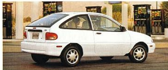
Aspire 3-Door in Crystal White.