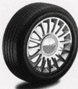
17" 16-Spoke Micro-Machined-Aluminum Wheel Optional on Premium