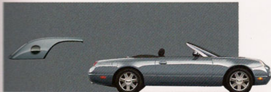
Medium Steel Blue