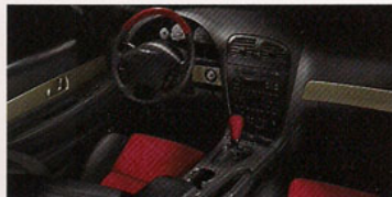
Torch Red Partial Interior Color Accent Package