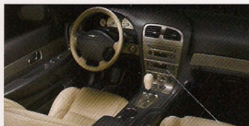
Light Sand Appearance Package