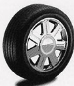
17" 7-Spoke Chromed-Aluminum Wheel Standard on Premium