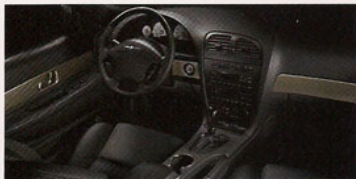
Black Accent Package