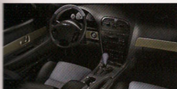
Medium Steel Blue Partial Interior Color Accent Package