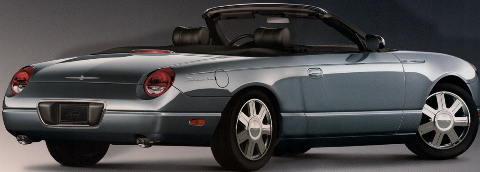
Thunderbird Premium - Medium Steel Blue (limited Color - 2005 model year only)

Standard and Available Features New Exterior and Interior Colors