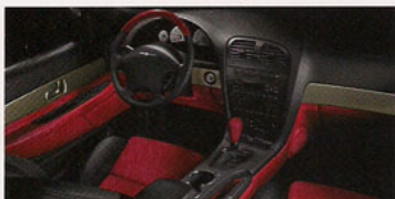
Torch Red Full Interior Color Accent Package