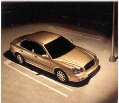
The standard battery saver feature automatically turns headlights off in case you forget to.