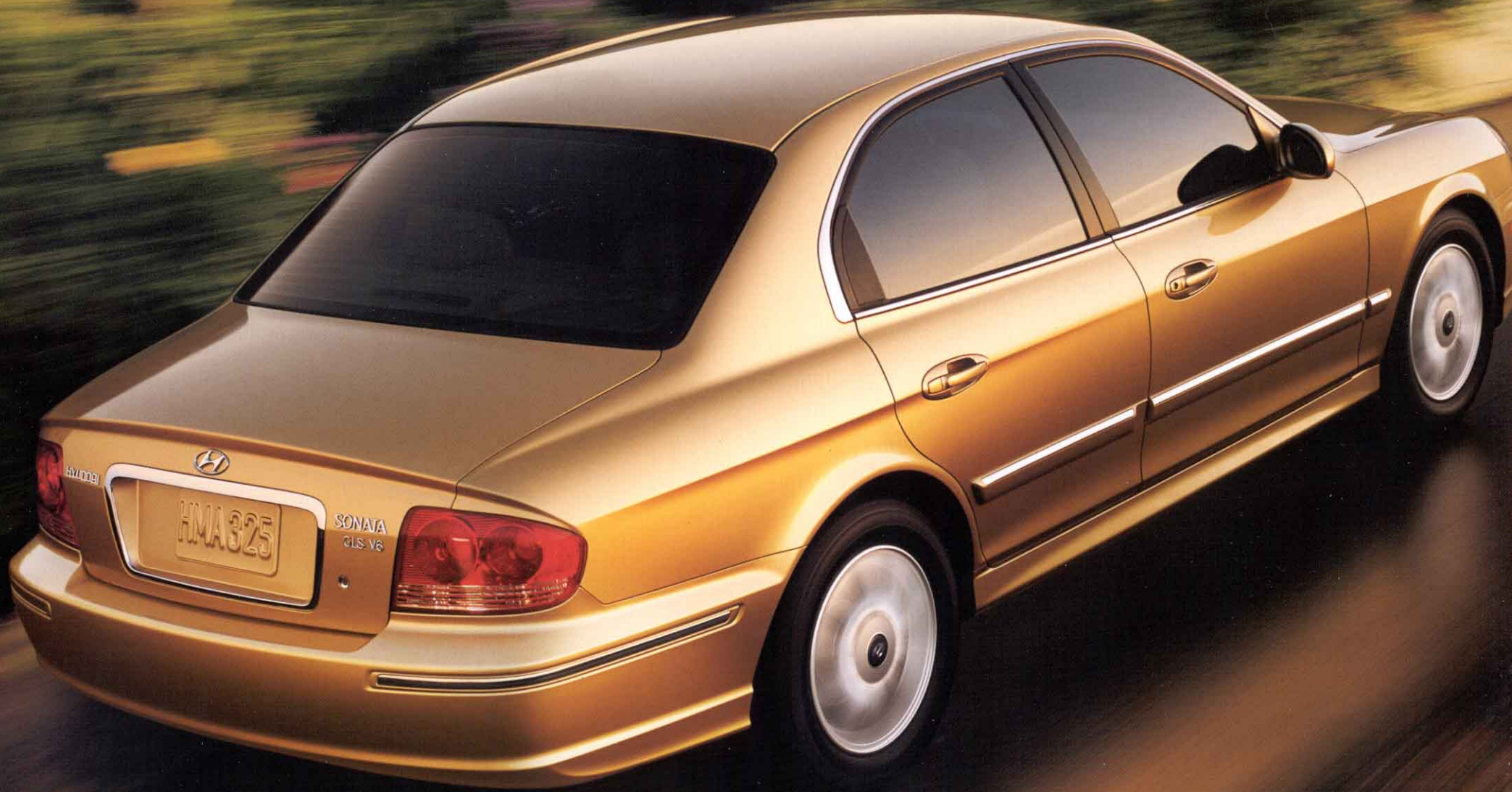
Sonata GLS in Desert Sand