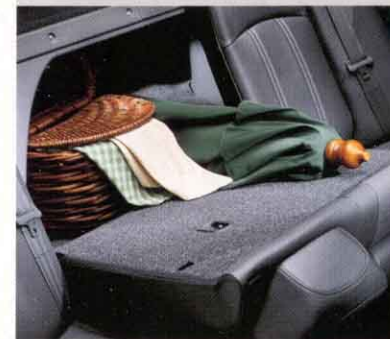
A 60/40 split fold-down rear seatback helps you handle plus-size cargo.