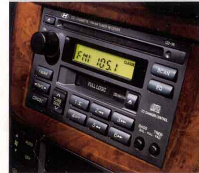
Both the Sonata GLS and LX include a premium AM/FM stereo cassette and CD player with 6 speakers and power antenna.

If you love the new Sonata because of its looks, who can blame you? It is, after all, quite a beautiful car. It's also every bit as appealing inside, with the kind of smart design that makes driving easier and more enjoyable. For instance, Sonata's gauges are set in the driver's natural line of sight for easy readability. Vital controls and switches, right down to the stereo and climate controls, are ergonomically designed and placed. The Sonata's functionality is matched by an impressive array of creature comforts, including power windows with a driver's Auto-down feature, power door locks and mirrors, and a 60/40 split fold-down rear seatback that helps you handle oversize cargo. Dialing things up a notch or two are the Sonata GLS and LX. Both feature a powerful 2.7-liter V6 engine, 4-wheel disc brakes, a premium AM/FM stereo cassette and CD player with 6 speakers, aluminum alloy wheels and woodgrain-trimmed interior. To this, the luxurious Sonata LX adds leather seating surfaces, an automatic climate control system and an 8-way power driver's seat.